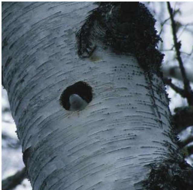
Figure 55. Tachycineta bicolor , tree swallow, in a nest where bryophytes were used. Photo through public domain.