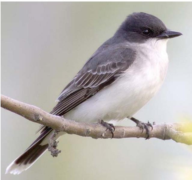
Figure 29. Tyrannus tyrannus , Eastern Kingbird. Members of this species often include mosses in their nests.

The Eastern Kingbird ( Tyrannus tyrannus ; Figure 29) of the Great Plains typically lives in forests where the canopy level is uneven, providing high points for observation and foraging (Johnsgard 2009). The female picks the nest site and builds the nest (Figure 30). She places it on outer branches of shrubs or small trees and often incorporates mosses in the construction.