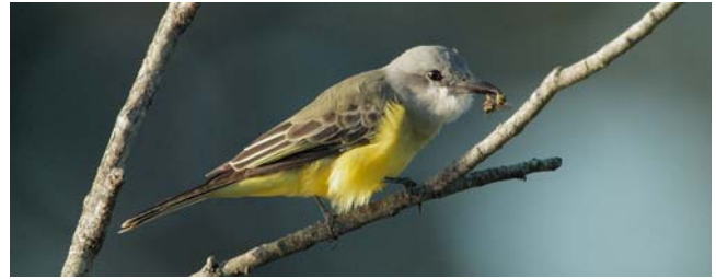
Figure 31. Tyrannus melancholicus , Tropical Kingbird. Members of this species often include mosses in their nests..