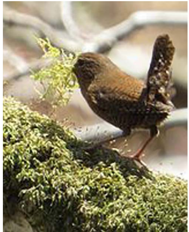
Figure 116. Troglodytes troglodytes fumigatus , Japanese Winter Wren, shown here gathering mosses for its nest.