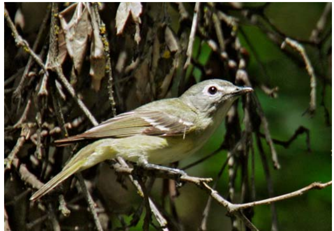
Figure 41. Vireo cassinii , Cassin's Vireo. Members of this species often include mosses in their nests.