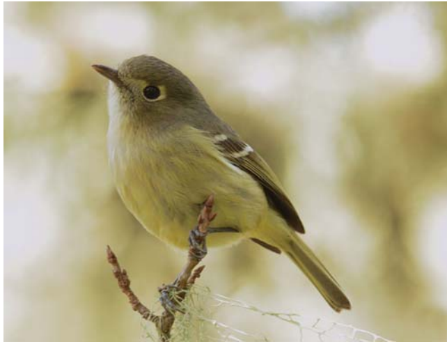
Figure 43. Vireo huttoni , Hutton's Vireo. Members of this species often include mosses in their nests.