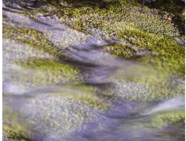
Figure 119. Platyhypnidium riparioides , a common moss used in nests of the American Dipper ( Cinclus mexicanus ).

riparioides (Figure 119) for the construction. The nest (Figure 120), wedged under the cliff behind a waterfall, appeared to be made entirely of mosses. Dan Norris (Bryonet 22 November 1995) reports that this bird is indeed selective, using mosses with a different frequency from that found in their habitat.