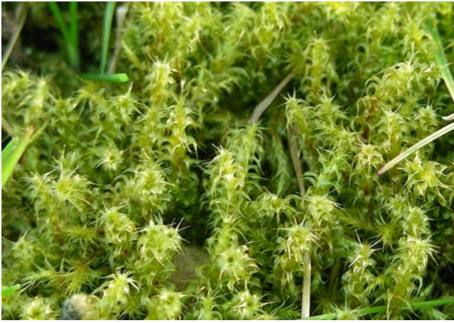
Figure 90. Rhytidiadelphus squarrosus , one of the nesting materials of Great Tits in the Czech Republic.

Álvarez et al. (2013) asserted that the properties and structure of a nest affect breeding performance. This drives the selection of behavior that produces nests characteristic of the species, including the appropriate nesting materials. Where preferred materials are low, birds select alternative materials, often at the cost of reduced breeding success. The researchers set out to support this hypothesis with the Great Tit, a species that has a wide range of habitats, using populations in four different Mediterranean habitats. Interestingly, the clutch size decreased as moss mass increased in the four sites. However, hatching success increased as the moss mass increased in one site. And in all the habitats, the nestling condition was poorer in nests with a greater proportion of sticks and feathers.