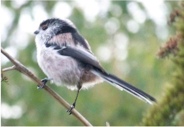
Figure 99. Aegithalos caudatus , Long-tailed Tit, a species whose members build nests with mosses.

bark crevices and buds. The families stay together, so that a flock will contain only related birds. Relatives that have lost their family members will join the flock. Nests may be tended by 1-8 adults. The female sits on the eggs and the male brings the food. Once the dozen or more babies hatch, helper adults gather food to feed them.