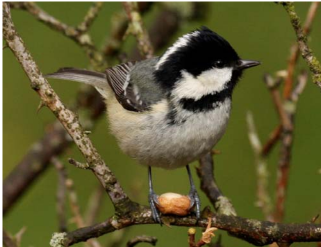
Figure 85. Periparus ater , Coal Tit. Members of this species often include mosses in their nests, preferring Hypnum cupressiforme .