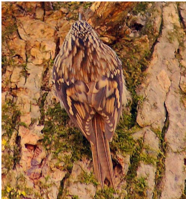
Figure 106. Certhia americana , Brown Creeper, a bird that uses mosses to construct its nests.