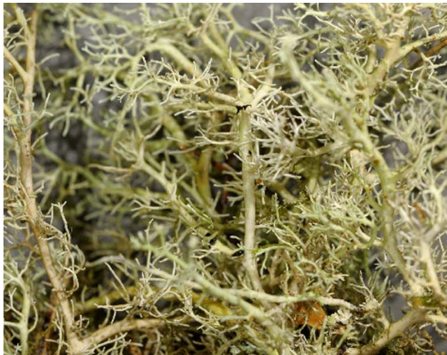
Figure 12. Sphaerophorus globosus , one of the lichen materials used in nests of the Pacific-slope Flycatcher ( Empidonax difficilis ).