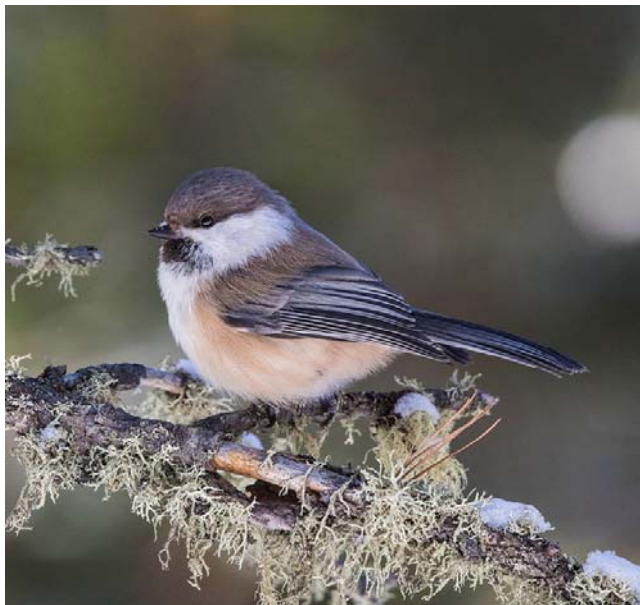
Figure 75. Poecile cinctus , Grey-headed Chickadee. Members of this species often include mosses in their nests.