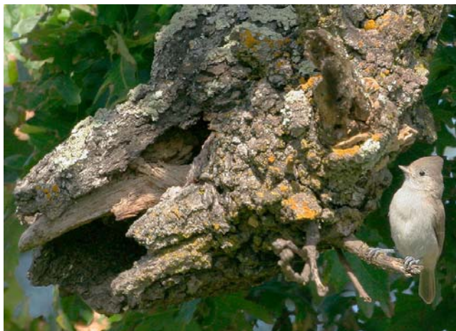
Figure 76. Baeolophus inornatus , Oak Titmouse, with its nest in the large hole at the bottom left. Members of this species include bryophytes in their nests.