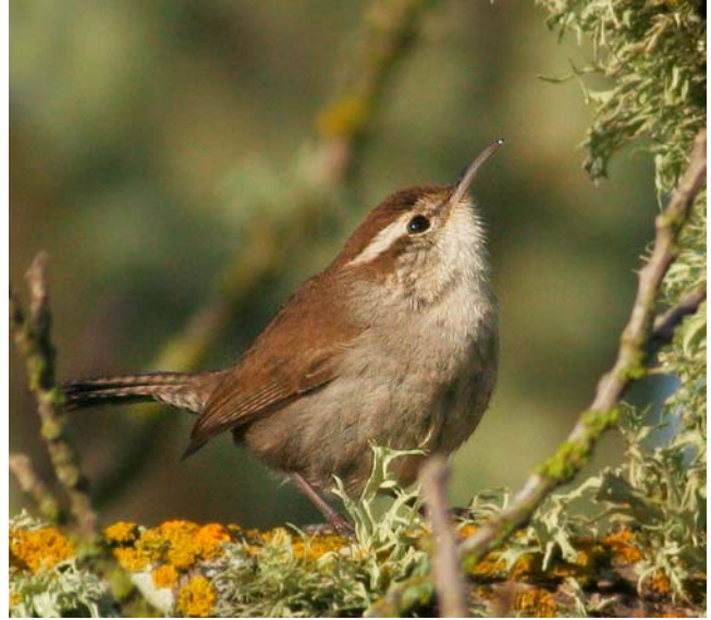
Figure 111. Thryomanes bewickii , Bewick's Wren. Members of this species often include mosses in their nests.