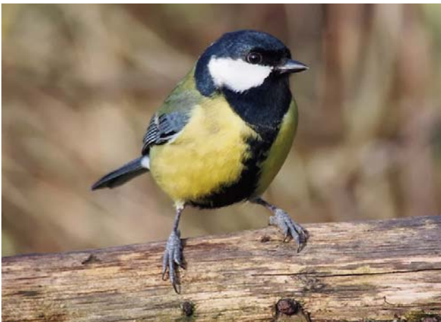
Figure 80. Parus major , Great Tit,. Members of this species often include bryophytes in their nests.

The Great Tit ( Parus major ; Figure 80-Figure 81) and the Blue Tit ( Cyanistes caeruleus ; Figure 82-Figure 84) both use mosses to build their nests (Figure 81) (Hribek 1985). Likewise, Gustavo Tomás and Andrew Spink (pers. comm. 2010) have collected mosses from a large number of Blue Tit ( Cyanistes caeruleus ) and Coal Tit ( Periparus ater ; Figure 85) nests in the Netherlands. The most common species in the nest is the locally common Hypnum cupressiforme (Figure 86). But other locally common species are not common in the nests, suggesting a preference. It appears that different species may be used in different parts of the nest, but so far there is no quantitative analysis available to support this. Figure 91 demonstrates the use of a Hypnum species (with Thuidium ) in the nest of an unknown bird in Pennsylvania, USA.