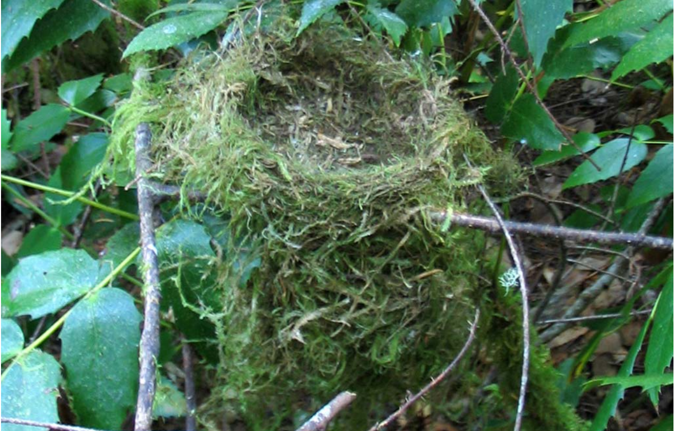
Figure 1. Moss nest from the Pacific Northwest, USA. The bryophytes include Isothecium and Neckera .