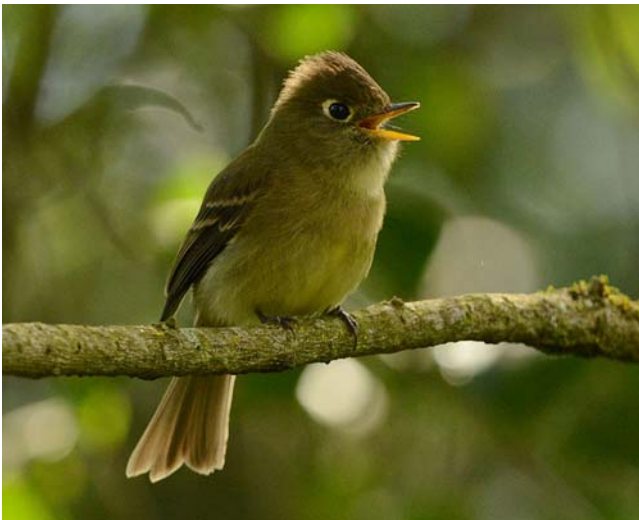
Figure 18. Empidonax occidentalis , Cordilleran Flycatcher. Members of this species often include mosses in their nests.