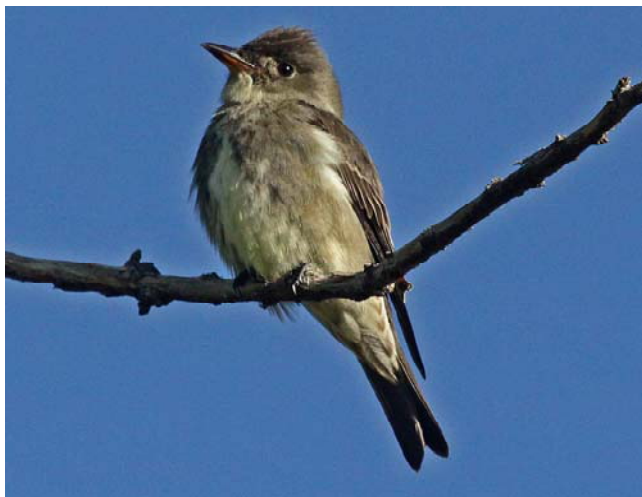
Figure 3. Contopus cooperi , Olive-sided Flycatcher. Members of this species often include mosses in their nests.

The Olive-sided Flycatchers ( Contopus cooperi ; Figure 3) typically hide their nests in a cluster of needles and twigs at distal ends of horizontal conifer branches (Johnsgard 2009). These may occur anywhere from 5-13 m above the ground. They use twigs, lichens, mosses, and needles to construct a cup ~12-15 cm in diameter.