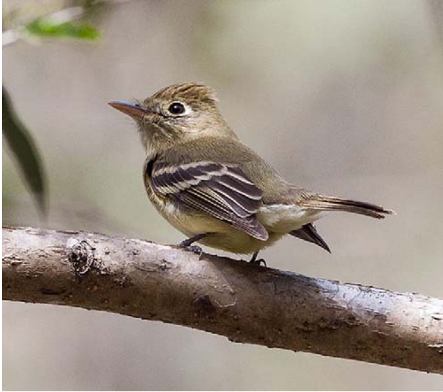
Figure 7. Empidonax difficilis , Pacific-slope Flycatcher, a species that uses Isoetecium in their nests in Douglas fir forests of the Pacific Northwest, USA.

The Pacific-slope Flycatcher ( Empidonax difficilis ; Figure 7-Figure 8) typically builds nests on ledges or crevices of canyon walls (Johnsgard 2009). These are often concealed by mosses or ferns. When the nest is built on trees, they are supported from below and from the rear, occurring in a crotch or on a limb that projects far from the main trunk. They contain a variety of materials, frequently including mosses (Figure 8-Figure 9).