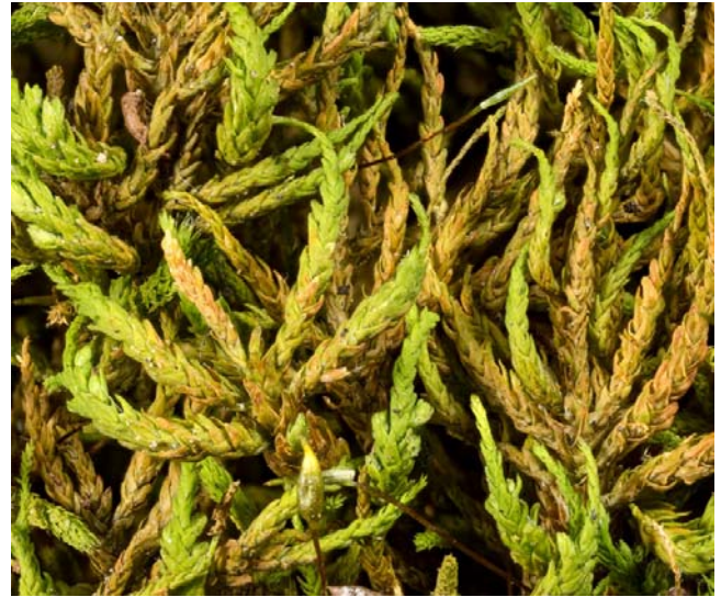
Figure 66. Anomodon attenuatus with capsules, an epiphytic moss that was ignored when the Carolina Chickadee built its nest.