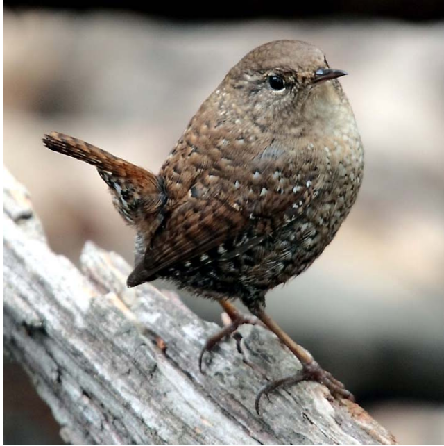
Figure 113. Troglodytes hiemalis , Winter Wren. Members of this species often include mosses in their nests.

Piers (1897) reported two Winter Wren ( Troglodytes hiemalis ; Figure 113) nests in Nova Scotia, Canada, built in moss that was constantly saturated by water trickling from the bank above. Piers suspected that the second nest was a later one built by the same pair as the first.