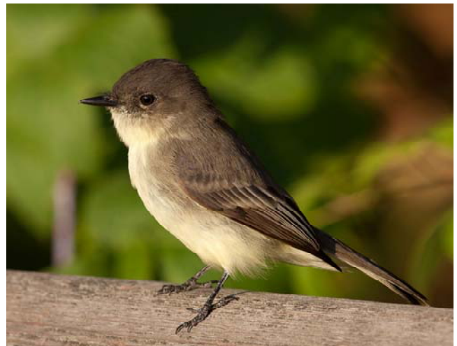
Figure 20. Sayornis phoebe , Eastern Phoebe, a bird that can be identified by the mosses in its nest.

I picked up my copy of "A Complete Field Guide to Nests in the United States" with eager anticipation. I quickly scanned the keys that depended on nesting location and materials and found several that mentioned mosses or peatlands. As I looked up each appropriate item in the key, I soon discovered only one bird was cited as a bryophyte user, the Eastern Phoebe – Sayornis phoebe (Figure 20) (Headstromn 1970). The Eastern Phoebe builds a cup-shaped nest (Figure 21) lined with mud and fibrous plant material. It uses mosses as a binding material with mud in the inner cup (Breil & Moyle 1976). It also uses mosses to line the cup. The outermost layer is also covered with moss (Headstromn 1970). Bent (1963) provided interesting bryological information. In a single nest, Mnium stellare (Figure 22), Funaria sp. (Figure 23), Polytrichum sp. (Figure 24), Hypnum "crisatum," and Climacium dendroides (Figure 25) were used as construction materials.