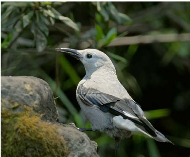
Figure 50. Nucifraga columbiana , Clark's Nutcracker. Members of this species often include mosses in their nests.