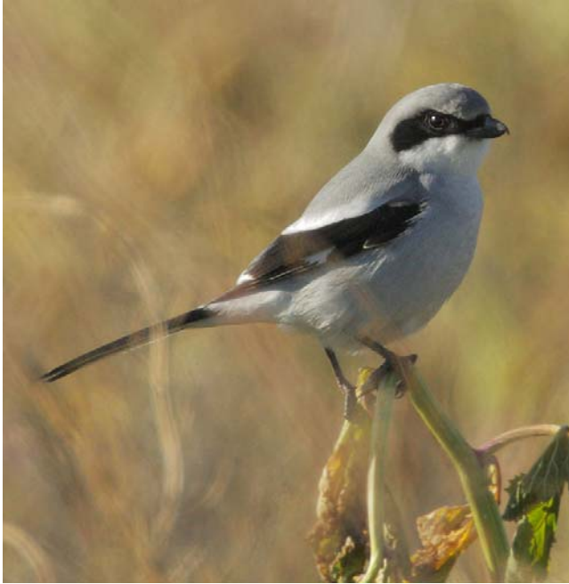
Figure 38. Lanius ludovicianus , Loggerhead Shrike. Members of this species often include mosses in their nests.

Lanius excubitor (Northern Shrike; Figure 39)