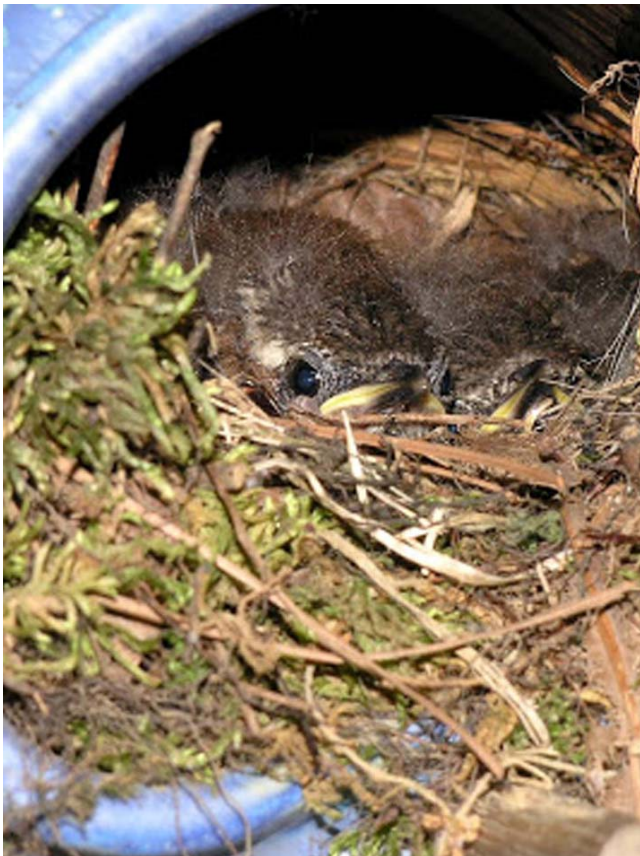
Figure 110. Thryothorus ludovicianus , Carolina Wren, nest with a considerable proportion of mosses, and nestlings.