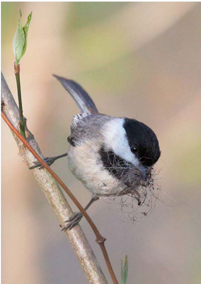
Figure 59. Poecile carolinensis , Carolina Chickadee, with nesting materials.