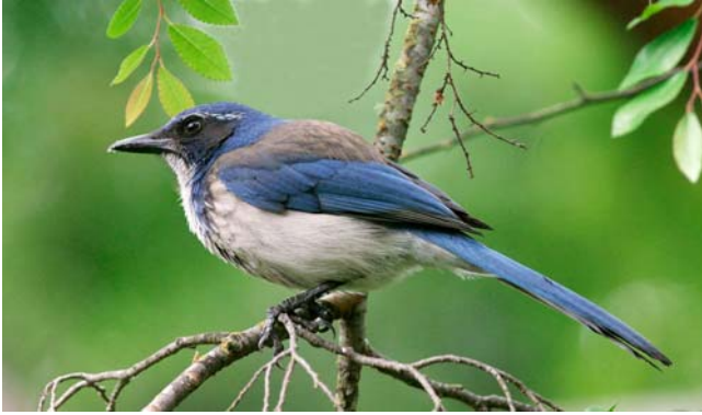
Figure 48. Aphelocoma californica , California Scrub-jay. Members of this species often include mosses in their nests.