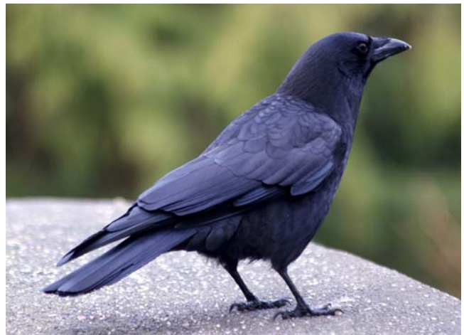
Figure 52. Corvus caurinus , Northwestern Crow. Members of this species often include mosses in their nests.