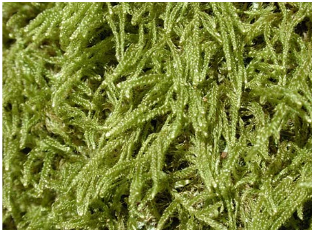
Figure 86. Hypnum cupressiforme , a preferred moss in the nests of Blue Tits and Coal Tits.

Although the population may use a wide variety of mosses, a few species of bryophytes typically comprise the nest. For example, the Japanese Tit, Parus minor , used 21 species of bryophytes in the nests, but among 91% of the 47 nests, more than 50% of the volume was comprised of only three bryophyte species (Hamao et al. 2016).