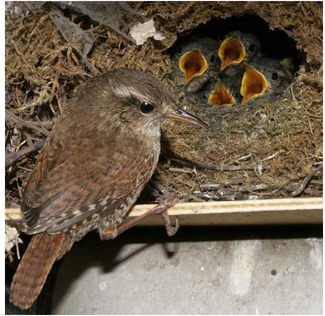
Figure 115. Troglodytes troglodytes , Eurasian Wren, feeding young in nest of mosses and other materials.