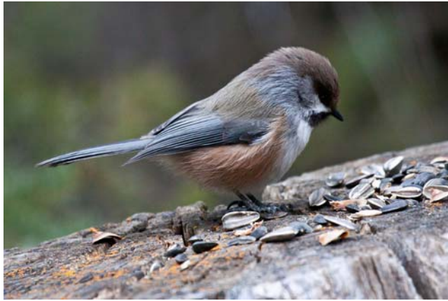
Figure 74. Poecile hudsonicus , Boreal Chickadee. Members of this species often include mosses in their nests.