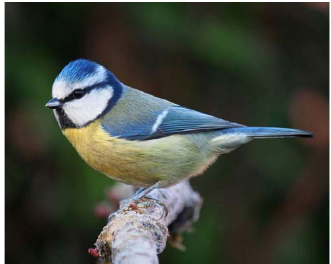
Figure 82. Cyanistes caeruleus , Eurasian Blue Tit,. Members of this species build their nests with mosses.