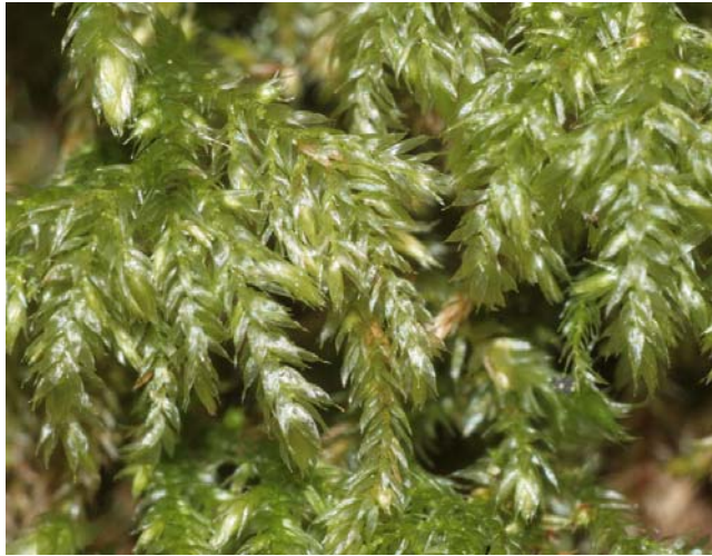
Figure 11. Isothecium myosuroides , representing a genus among those used in nests of the Pacific-slope Flycatcher ( Empidonax difficilis ).