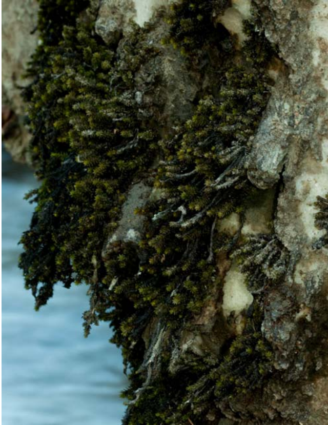
Figure 121. Scouleria marginata , a common component of the American Dipper nests.