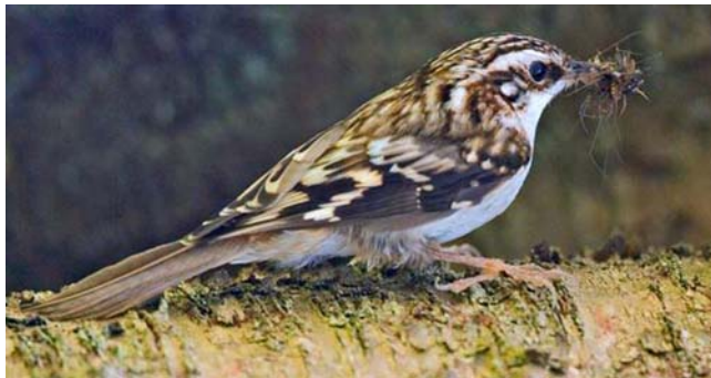
Figure 105. Certhia americana , Brown Creeper, with a beak full of dinner.

Wolf (2009) found one species of Certhiidae whose members use bryophytes in their nests in North America: Certhia americana (Brown Creeper; Figure 105-Figure 106).