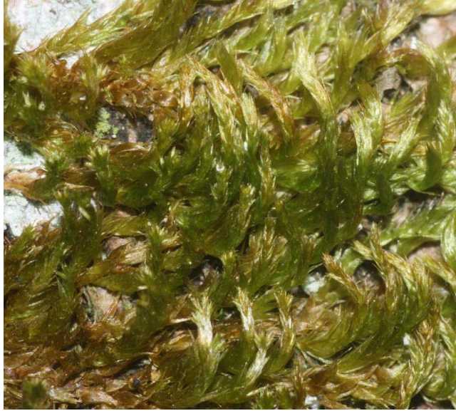
Figure 62. Platygyrium repens with bulbils, a moss used in nests of Carolina Chickadees.