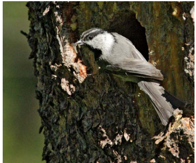
Figure 72. Poecile gambeli , Mountain Chickadee. Members of this species often include mosses in their nests.