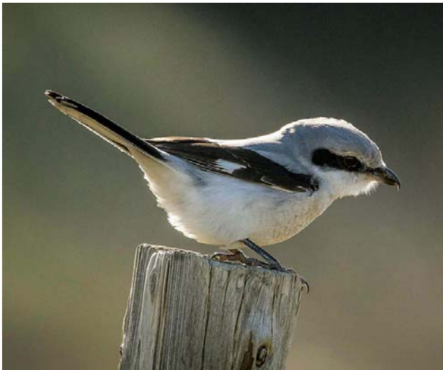
Figure 39. Lanius excubitor , Northern Shrike. Members of this species often include mosses in their nests.