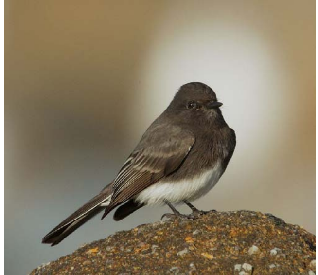
Figure 19. Sayornis nigricans , Black Phoebe. Members of this species often include mosses in their nests.