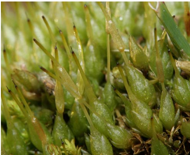
Figure 23. Funaria hygrometrica with immature capsules, a species used in nests of the Eastern Phoebe.