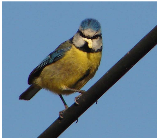
Figure 93. Cyanistes caeruleus ogliastreae , Corsican Blue Tit. Members of this species often include mosses in their nests.

The Corsican Blue Tit ( Cyanistes caeruleus ogliastreae ; Figure 93) includes 1-5 aromatic herbs in its nest (Lambrechts & Dos Santos 2000). Herbs are included in a number of kinds of bird nests, and researchers have suggested that they may serve an anti-parasite function (Figure 94) (Wimberger 1984; Bucher 1988; Cowie & Hinsley 1988; Clark 1991; Banbura et al. 1995). Using an herb removal experiment when the young hatched, these researchers found that the parents brought fresh aromatic greens to the nest. They proposed the Potpourri hypothesis that included at least seven functional causes for materials used in the nests. When the Blue Tits breed in cavities, they use predominately mosses, but also include other materials, including fresh herbaceous leaves. They suggested that mosses may optimize the microclimate in the nest cavity. The aromatic herbs are likely to serve an anti-parasitic function.