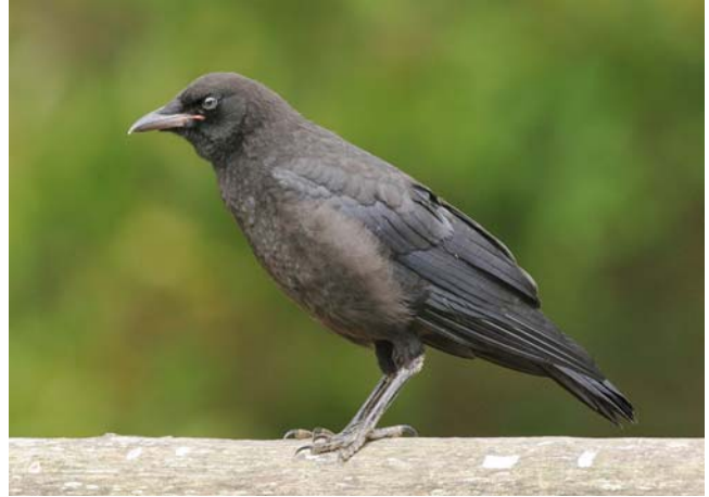
Figure 51. Corvus brachyrhynchos , American Crow. Members of this species often include mosses in their nests.