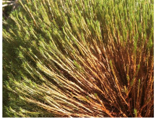
Figure 24. Polytrichum commune , member of a genus used in construction of nests of the Eastern Phoebe.