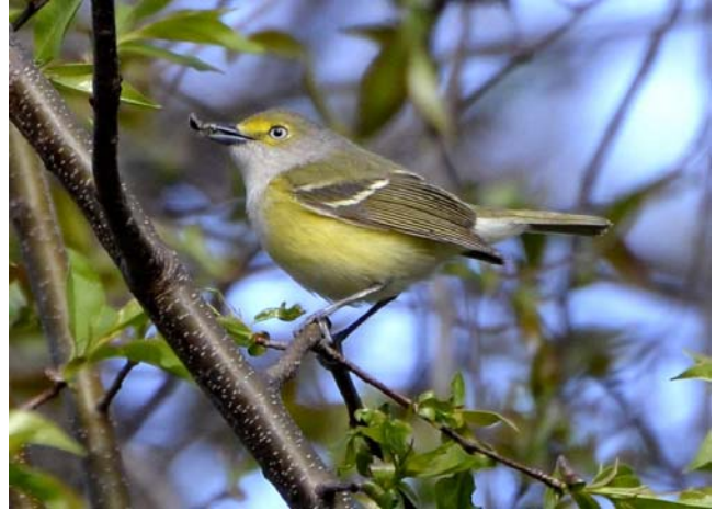
Figure 40. Vireo griseus , White-eyed Vireo. Members of this species often include bryophytes in their nests.

Vireo huttoni (Hutton's Vireo; Figure 43)