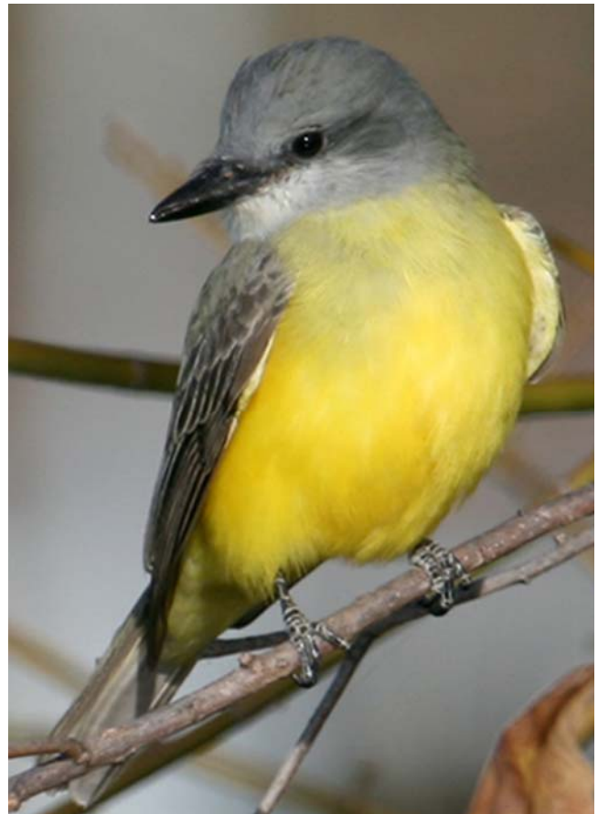
Figure 32. Tyrannus couchii , Couch's Kingbird. Members of this species often include mosses in their nests.