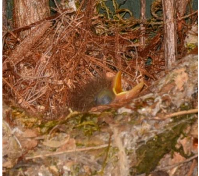
Figure 9. Empidonax difficilis , Pacific-slope Flycatcher, nest with mosses and young bird.

In the Pacific Northwest, USA, Wolf (2009) found a nest of the Pacific-slope Flycatcher (Figure 8) on a fractured piece of bark on the tree bole of Pseudotsuga menziesii (Figure 10) at ~4 m above the ground. The bird had woven strands of the moss Isoetecium (Figure 11) into the rim of the nest and decorated the exterior with fragments of the lichen Sphaerophorus globosus (Figure 12). The Isoetecium had been relocated from elsewhere in the forest understory.