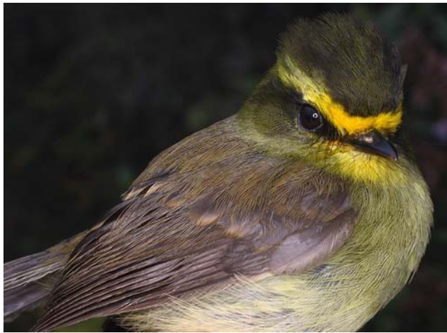
Figure 34. Ochthoeca diadema , Yellow-bellied Chat Tyrant. Members of this species sometimes build their nests into vertical hanging mats of mosses.

Miller and Greeney (2008) described the nest of the Yellow-bellied Chat-tyrant ( Ochthoeca diadema ; Figure 34). They found a partially domed cup built into a vertical mat of mosses that hung from a horizontal vine. The cup was thick and composed of bryophytes with a sparse lining of feathers. The dome covered only about one-third of the cup. Closer examination revealed that the nest was actually built into the vertical sheet of mosses.