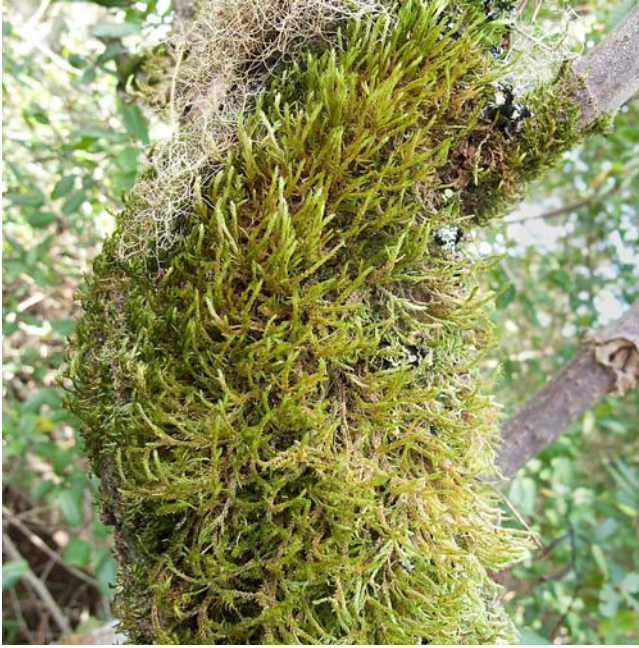
Figure 16. Alsia californica , member of a genus used in nests of the Hammond's Flycatcher in parts of North America.