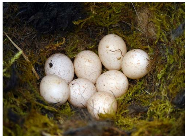
Figure 83. Cyanistes caeruleus , Blue Tit, mossy nest and eggs.