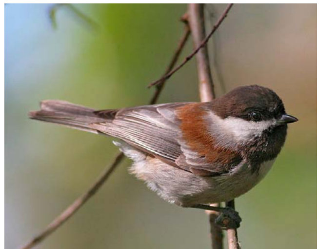
Figure 73. Poecile rufescens , Chestnut-backed Chickadee. Members of this species often include mosses in their nests.

In Cashiers, NC, a Carolina Chickadee ( Poecile carolinensis ; Figure 58) used Thuidium delicatulum (Figure 71) in its nest in an English Boxwood shrub (Annie Martin, Bryonnet 1 June 2010).