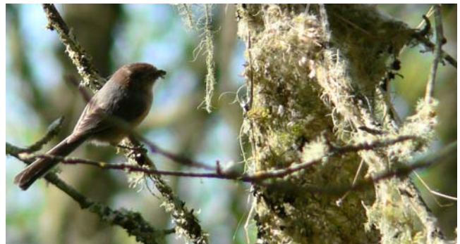
Figure 97. Psaltriparus minimus , Bushtit, at mossy nest.

Wolf (2009) found one species of Aegithalidae whose members use bryophytes in their nests (Figure 97) in North America: Psaltriparus minimus (Bushtit; Figure 98).