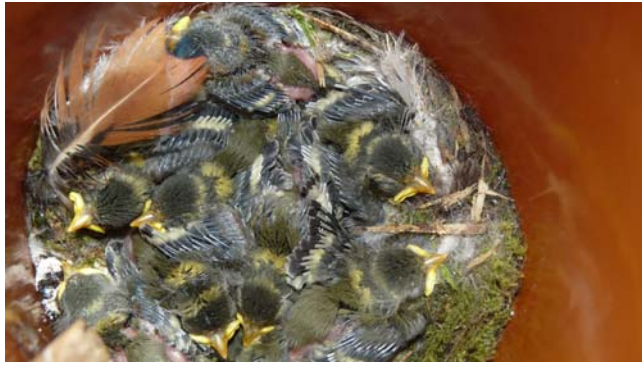
Figure 84. Cyanistes caeruleus , Blue Tit, nest with moss and nestlings.