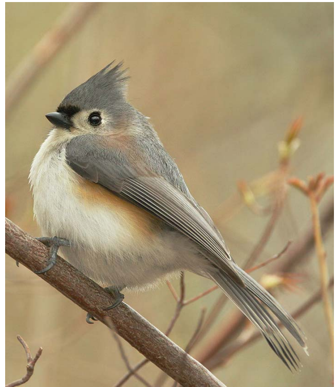
Figure 78. Baeolophus bicolor , Tufted Titmouse. Members of this species often include mosses in their nests.