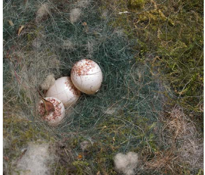
Figure 81. Parus major , Great Tit, nest with bryophytes and eggs.