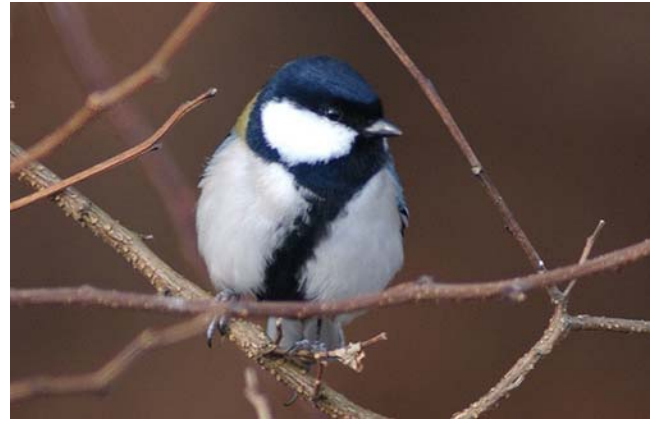
Figure 87. Parus minor , Japanese Tit, a species that seems to be selective in choice of mosses for its nests.

Although the population may use a wide variety of mosses, a few species of bryophytes typically comprise the nest. For example, the Japanese Tit, Parus minor , used 21 species of bryophytes in the nests, but among 91% of the 47 nests, more than 50% of the volume was comprised of only three bryophyte species (Hamao et al. 2016).