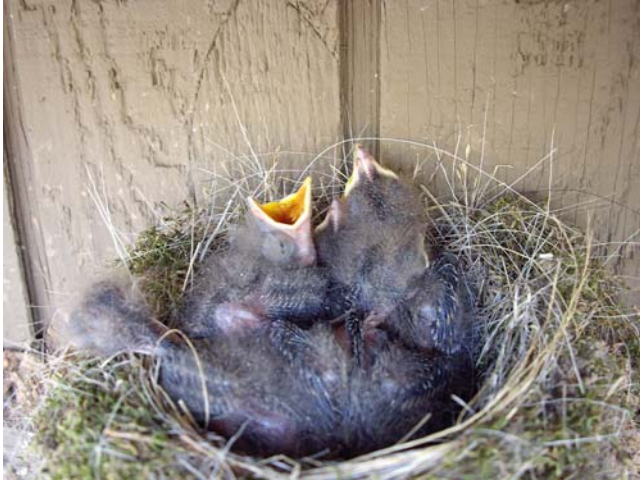
Figure 21. Sayornis phoebe , Eastern Phoebe, nest.