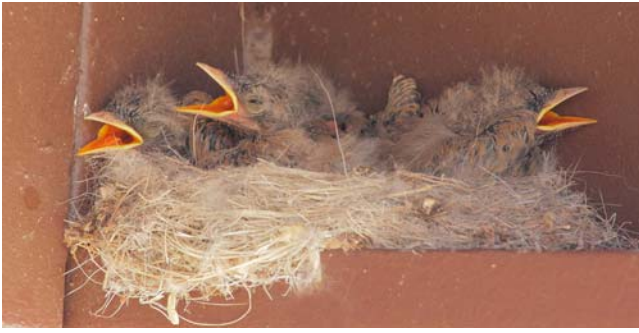
Figure 27. Sayornis saya , Say's Phoebe, nest with young.