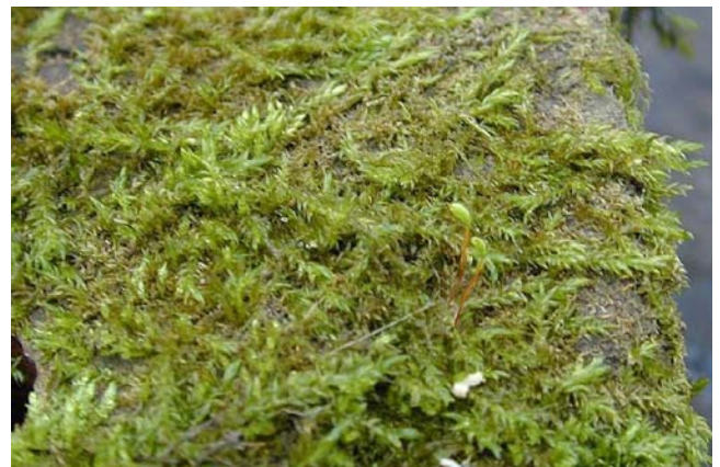
Figure 88. Leptodictyum riparium , a favorite nesting material of Blue Tits in the Czech Republic, with capsule.

In the Czech Republic, Hříbek (1985) found that Blue Tits (Figure 82-Figure 84) used mostly softer species ( Hypnum cupressiforme (Figure 86), Leptodictyum riparium (Figure 88), whereas the Great Tits used mostly the large-stemmed mosses such as Calliergonella cuspidata (Figure 89) and Rhytidiadelphus squarrosus (Figure 90).