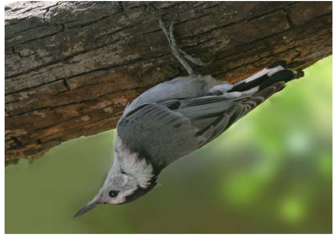
Figure 102. Sitta carolinensis , White-breasted Nuthatch. Members of this species often include bryophytes in their nests.

Sitta pygmaea (Pygmy Nuthatch; Figure 104)