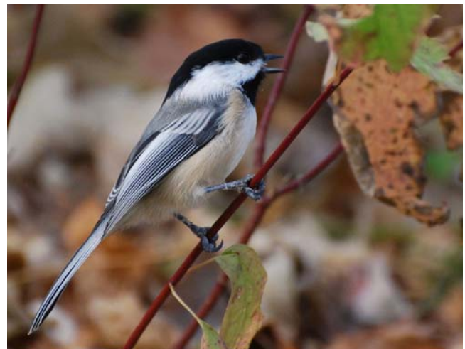
Figure 57. Poecile atricapillus , Black-capped Chickadee. Members of this species gather dry mosses near a stream for their nests.

Allen (2017) observed a Black-capped Chickadee ( Poecile atricapillus ; Figure 57) busily gathering dry moss for its nest, then flying to the nestbox. The stream had lots of moss, but the bird ignored these, preferring the dry patch next to the stream. The Robin, on the other hand, preferred the wet moss for its open, mud-lined nest.