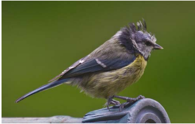
Figure 94. Cyanistes caeruleus , Eurasian Blue Tit, with mite infestation causing balding.