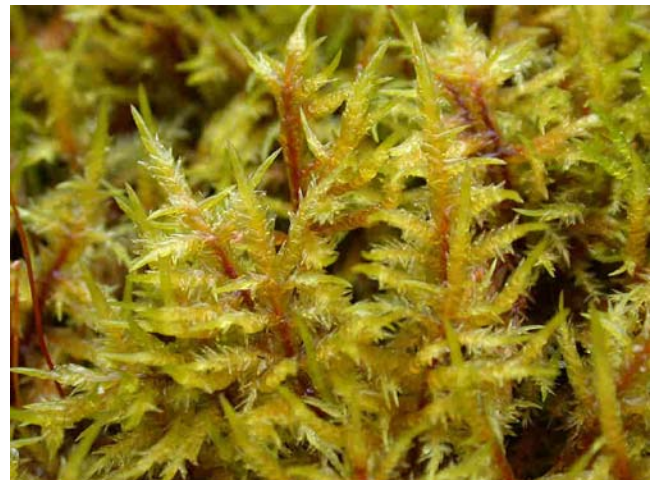
Figure 89. Calliergonella cuspidata , one of the nesting materials of Great Tits in the Czech Republic.