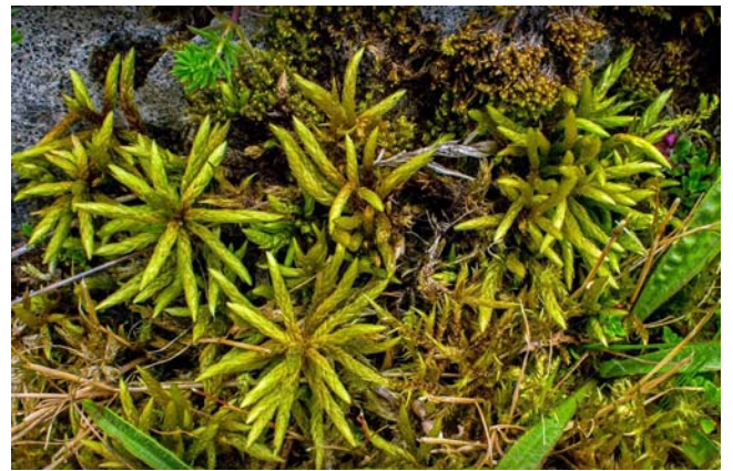
Figure 25. Climacium dendroides , a moss used in nests of the Eastern Phoebe.