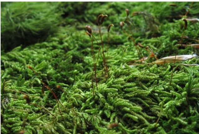
Figure 69. Hypnum pallescens , an epiphytic moss that was ignored when a Carolina Chickadee built its nest.