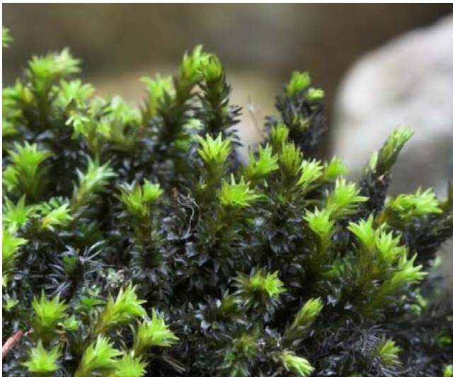
Figure 122. Scouleria aquatica , a common moss that is ignored as nesting material for the American Dipper when S. marginata is present.

Roger Rosentreter (pers. comm. 20 January 2014) observed numerous American Dipper ( Cinclus mexicanus ; Figure 117-Figure 118) nests on the Payette River, Idaho, USA, reaching up to 2 nests per kilometer. In this case, the nests were composed primarily of the aquatic moss Scouleria aquatica (Figure 122), an abundant moss in the river.