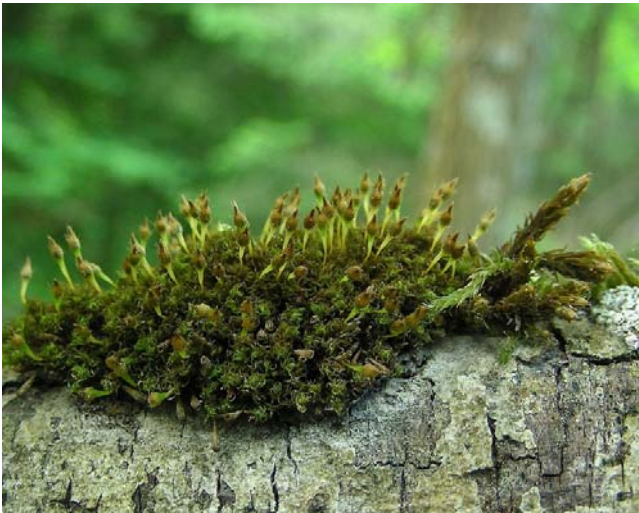
Figure 70. Ulota crispa , an epiphytic moss that was ignored when a Carolina Chickadee built its nest.

In Cashiers, NC, a Carolina Chickadee ( Poecile carolinensis ; Figure 58) used Thuidium delicatulum (Figure 71) in its nest in an English Boxwood shrub (Annie Martin, Bryonnet 1 June 2010).