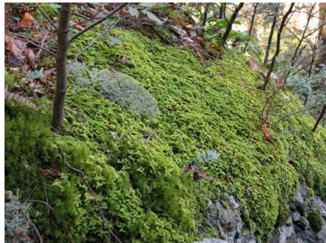
Figure 61. Hypnum imponens , a common species in a genus used for nests of the Carolina Chickadee.

Andreas (2010) observed nests of two Carolina Chickadees ( Poecile carolinensis ; Figure 58). These included ten mosses and two liverworts. The dominant species were the pleurocarpous moss Platygyrium repens (Figure 62) and the leafy liverwort Frullania eboracensis (Figure 63) plus a few others, which comprised 55% of the nesting material by volume. In another year, the bryophytes comprised 70.4% of the nest material. The selection of bryophytes was not in proportion to their abundance and all species used were epiphytic on bark. Andreas suggested that they may select Frullania eboracensis for its chemical properties, possibly protecting them from mites (Figure 94). Only corticolous (growing on tree bark) bryophytes were used, with the exception of a single piece of Bryoandersonia illecebra (Figure 64) in one nest. But even clumps of acroparpous (mostly upright with archegonia and capsules forming at tip of stem) mosses were removed from the tree trunks as tiny tufts for nest usage, including Orthotrichum ohioense and Dicranum montanum (Figure 65). Other corticolous bryophytes, including Anomodon attenuatus (Figure 66), Brachythecium laetum (Figure 67), Clasmatodon parvulus (Figure 68), Hypnum pallescens (Figure 69), and Ulota crispa (Figure 70), were ignored.