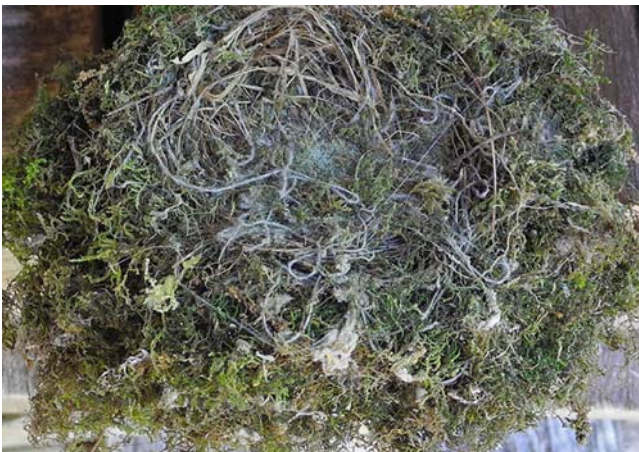
Figure 91. Hypnum and Thuidium in unidentified nest.

Mainwaring et al. (2012) reported that the nests of Blue Tits ( Cyanistes caeruleus ) and Great Tits ( Parus major ; Figure 80-Figure 81) in Great Britain consist of a "pad of moss mixed with dry grass and other plant material placed at the base of the nest box" (Figure 92) (Cramp & Perrins 1993; Mainwaring et al. 2008; Mainwaring & Hartley 2008, 2009; Britt & Deeming 2011). The nest cup is lined with fine dry grass, hair, wool and feathers. In this case, it appears that the mosses may be used to regulate the temperature and insulate the eggs and young birds. When temperatures increase, the female reduces the amount of lining material.