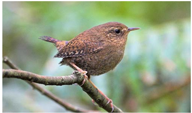
Figure 112. Troglodytes pacificus , Pacific Wren. Members of this species often include mosses in their nests.

The Winter Wren has been divided into two species, the Pacific Wren ( Troglodytes pacificus ; Figure 112) and the Winter Wren ( Troglodytes hiemalis ; Figure 113), the eastern species (Toews & Irwin 2008). Where their breeding ranges overlapped, the two species were distinguishable by their songs and lack of cross mating. This evidence was supported by DNA analysis.