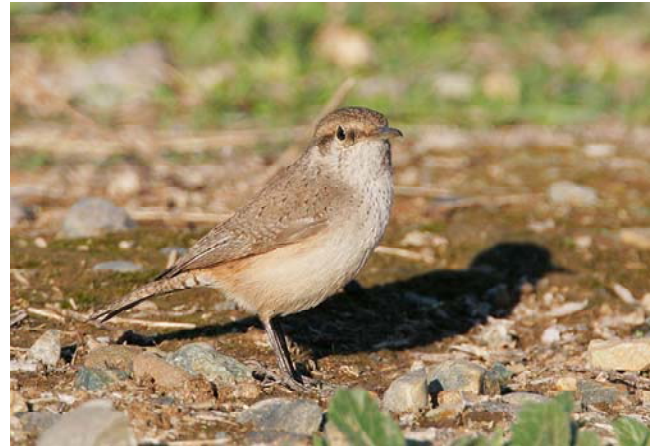
Figure 107. Salpinctes obsoletus , Rock Wren. Members of this species often include mosses in their nests.

Troglodytes pacificus (Pacific Winter Wren; Figure 114-Figure 116)