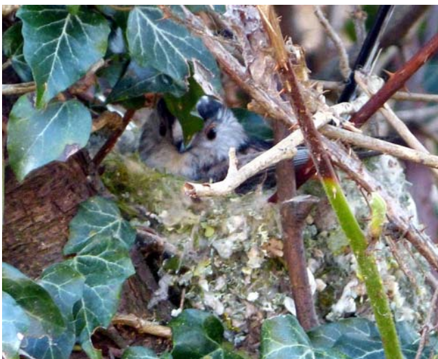
Figure 101. Aegithalos caudatus , Long-tailed Tit, building her nest in a hedgerow.

The nests are bag-shaped and woven from mosses, bound with spider webs (Burton 1996). The birds cover the outside of the nest with lichens, sometimes substituting plastic and newspaper in areas of human habitation. This nest is insulated on the inside with feathers. The tits may accumulate ~1130 km of travel to gather nest materials. Hansell (2002) reported a nest with 5000-6000 pieces of material, including short-leaved mosses and cocoons intertangled, creating a Velcro effect with a few hundred sprigs of mosses.