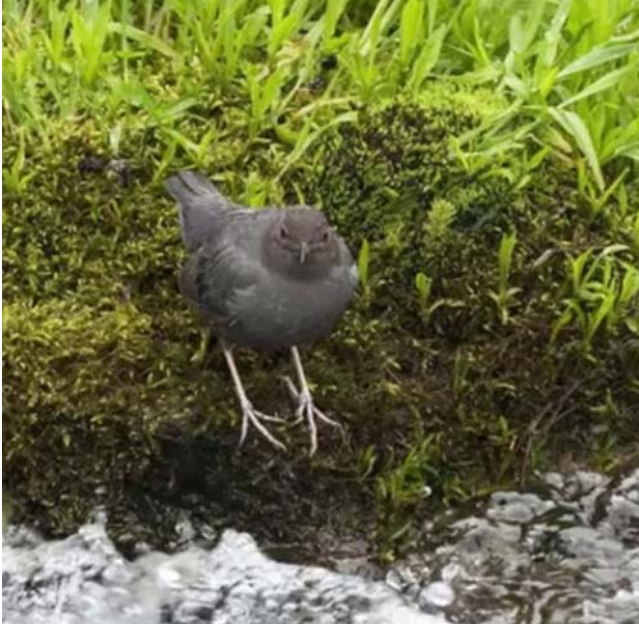
Figure 117. Cinclus mexicanus , American Dipper, on mosses on the streambank.