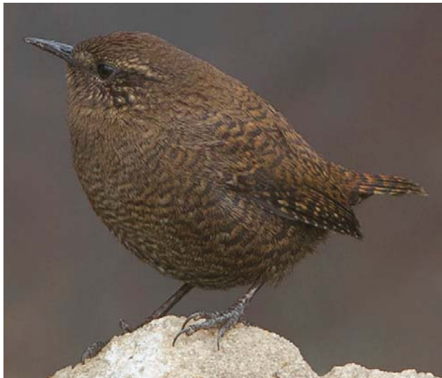
Figure 114. Troglodytes troglodytes , Eurasian Wren, a bryophyte nest builder.

Nests of the Eurasian Wren ( Troglodytes troglodytes ; Figure 114) can make its nest almost entirely of bryophytes (Figure 115). The Japanese variety ( Troglodytes troglodytes fumigatus ) likewise uses mosses (Figure 116).