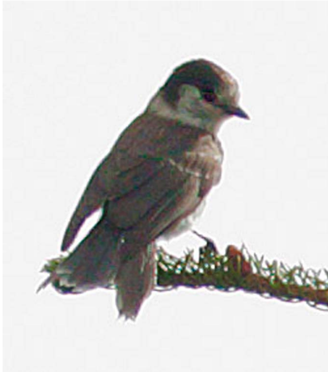
Figure 44. Perisoreus canadensis , Gray Jay. Members of this species often include mosses in their nests.