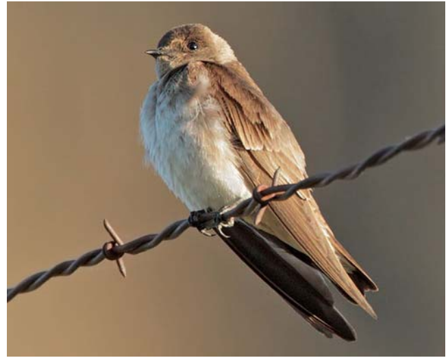
Figure 56. Stelgidopteryx serripennis , Northern Rough-winged Swallow. Members of this species often include mosses in their nests.