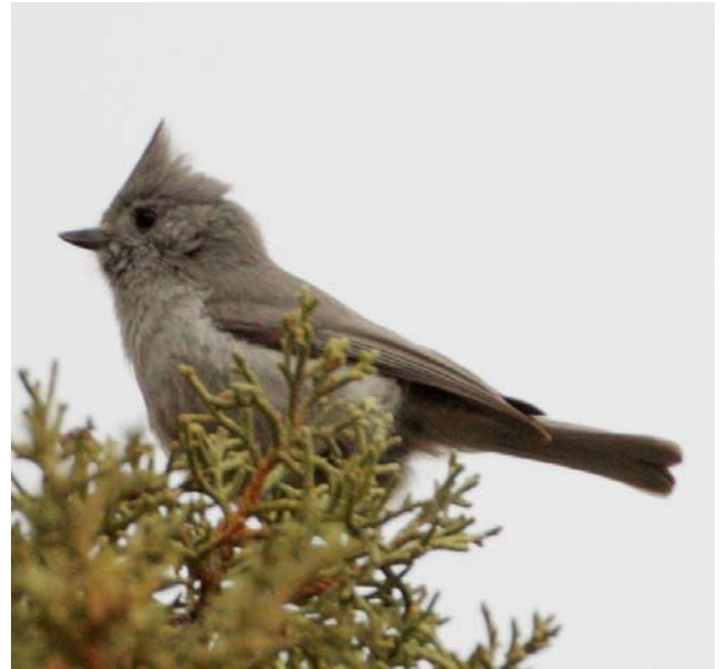
Figure 77. Baeolophus ridgwayi , Juniper Titmouse. Members of this species often include mosses in their nests.