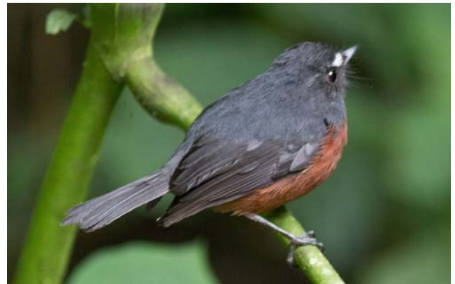
Figure 36. Ochthoeca cinnamomeiventris . Members of this species place mossy cups on ledges.