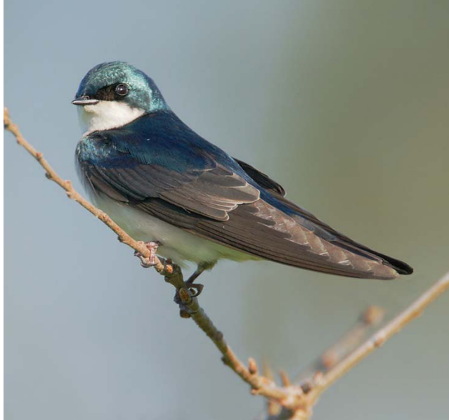
Figure 54. Tachycineta bicolor , Tree Swallow, male. Members of this species use bryophytes in their treehole nests.

Tree Swallows ( Tachycineta bicolor ; Figure 54) are known to construct a basket nest (Figure 55) of sticks with an "upholstery" of moss, grass, and animal fur (Heinrich 2000). Heinrich assumed these to provide insulation and to cushion the eggs.