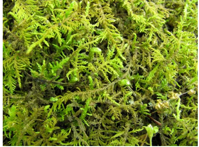
Figure 71. Thuidium delicatulum , a ground moss used in the nest of a Carolina Chickadee.