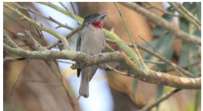
Figure 37. Pachyramphus aglaiae , Rose-throated Becard. Members of this species often include mosses in their nests.