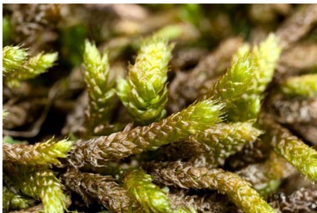
Figure 64. Bryoandersonia illecebra , the only non-epiphytic moss used in a Carolina Chickadee nest.