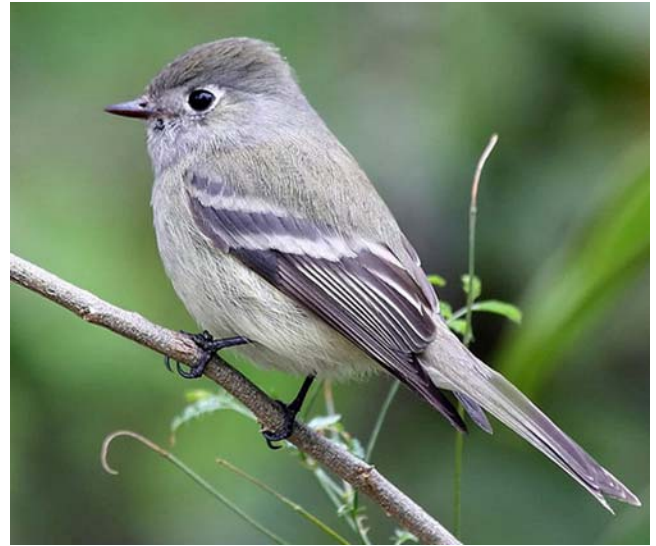
Figure 13. Empidonax hammondii , Hammond's Flycatcher. Members of this species often include mosses in their nests.

The Hammond's Flycatcher ( Empidonax hammondii ; Figure 13) has a nest that is distinctly different from that of the Pacific Slope Flycatcher ( Empidonax difficilis ; Figure 7-Figure 9) (Sakai 1988). The Hammond's Flycatcher nest is taller, more tightly woven, and mimics the surrounding substrate. The outer bowl of the only retrieved nest was made with mostly white scale lichens, mosses Dendroalsia abietina (Figure 14), Homalothecium nuttallii (Figure 15), Isothecium sp. (Figure 11), Alsia sp. (Figure 16), and the leafy liverwort Porella navicularis (Figure 17). By comparison, in the 22 Pacific-slope Flycatcher nests, the material was mostly mosses. They often lacked the camouflage effect because they used the same materials on all substrates. The nests were held together with spider webs that were also used to secure the nests to the substrate.