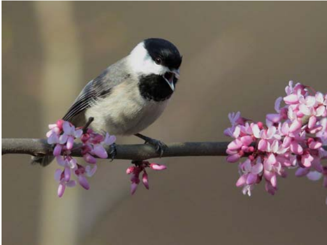
Figure 58. Poecile carolinensis , Carolina Chickadee. Members of this species often include mosses in their nests.

Erichsen (1919) describes the appearance of "down" on the cinnamon and royal ferns as a signal that the Carolina Chickadee ( Poecile carolinensis ; Figure 58) will begin its nest building (Figure 59). The Carolina Chickadee often begins this nest (Figure 60) by placing a thick mat of green moss (often Hypnum ; Figure 61) from the tree trunks into the nesting cavity (Figure 60). This always occurs first, followed by the soft down of the ferns.