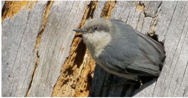
Figure 104. Sitta pygmaea , Pygmy Nuthatch, at tree hole. Members of this species often include mosses in their nests.