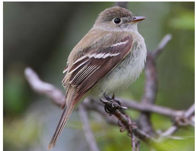
Figure 6. Empidonax minimus , Least Flycatcher. Members of this species often include mosses in their nests.