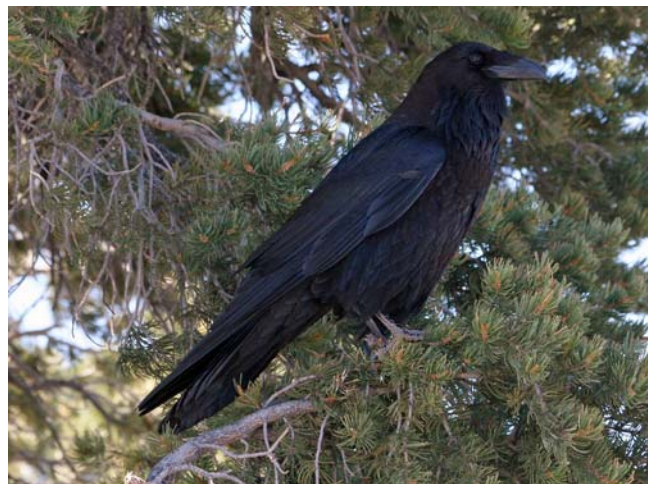
Figure 53. Corvus corax , Raven. Members of this species often include mosses in their nests.

The Raven ( Corvus corax ; Figure 53) uses mosses to line its nest (Giannetta 2000).