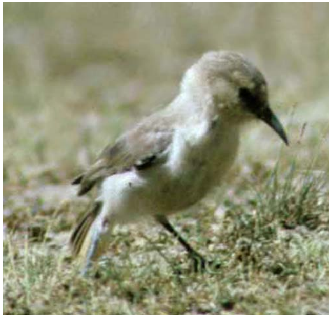
Figure 95. Pseudopodoces humilis , Ground Tit. Members of this species build nests of grasses and mosses.

Ground Tit, also known as Hume's Jay, ( Pseudopodoces humilis ; Figure 95) has been considered the smallest member of the Jay and Crow family (Lipsker 2004). But more recently it appears that it should be classified in the Paridae with the Chickadees. These birds are common in forests and woody suburbs of Europe and North America, but it appears that their ancestors lived on the dry, treeless Tibetan plateau. They nest in cavities where they build nests of grasses and mosses. Like Jays, they rarely fly, but they do not run like the Jays; rather, they hop.