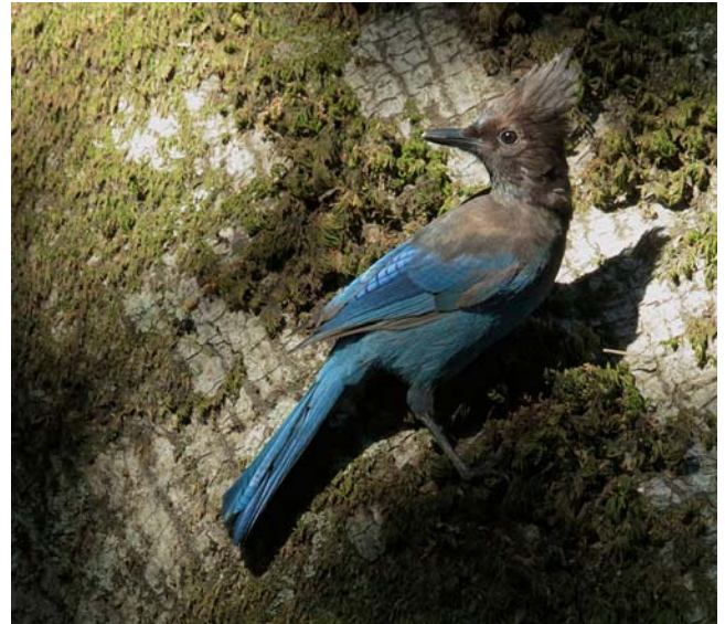
Figure 45. Cyanocitta stelleri , Steller's Jay. Members of this species often include mosses in their nests.