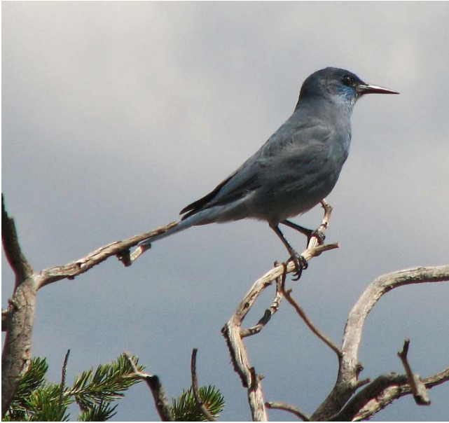
Figure 49. Gymnorhinus cyanocephalus , Pinyon Jay. Members of this species often include mosses in their nests.