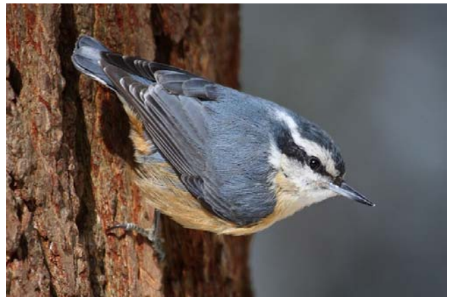
Figure 103. Sitta canadensis , Red-breasted Nuthatch, outside the mossy nest in the treehole.

The Red-breasted Nuthatch ( Sitta canadensis ; Figure 103) builds its nest in tree holes, generally about 2.5 cm in diameter (Heinrich 2009; Moss Musings 2017). Inside the hole it lines the nest with mosses, down, and fibers. In fact, its nest can be recognized from those of woodpeckers because they never line their nests.