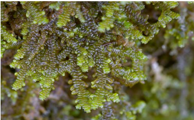
Figure 17. Porella navicularis , a leafy liverwort used in nests of the Hammond's Flycatcher in the Pacific Northwest.