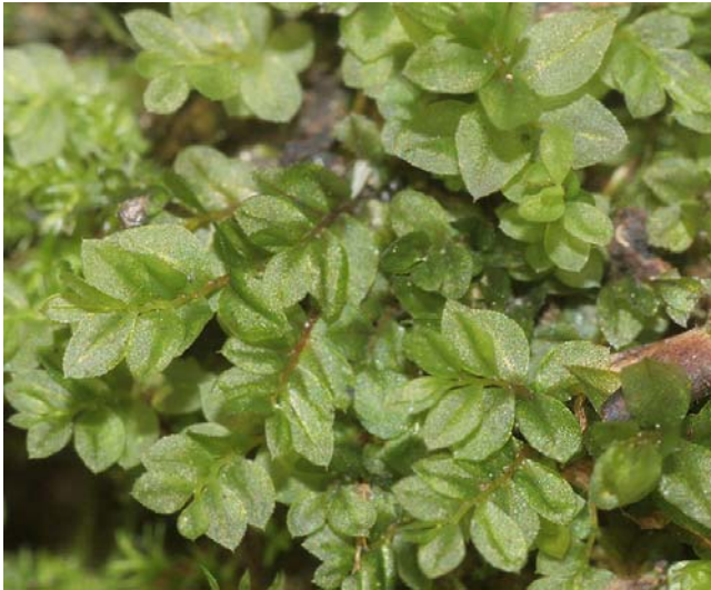
Figure 22. Mniun stellare , a moss used in the Eastern Phoebe ( Sayornis phoebe ) nests.