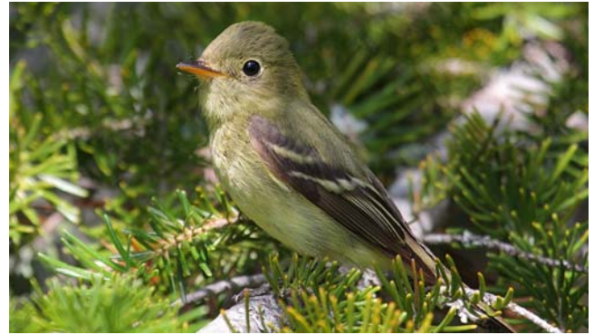
Figure 4. Empidonax flaviventris , Yellow-bellied Flycatcher. This species builds nests on a bed of mosses on the ground.

In the eastern United States, Yellow-bellied Flycatcher ( Empidonax flaviventris ; Figure 4) nests close to mature stands of lowland coniferous forest (Harrison 1975; Hawrot & Niemi 1996). These forests often have a well-developed layer of mosses and these mosses appear to be necessary for the bird's nesting. The Yellow-bellied Flycatcher nests on the ground in a layer of mosses.