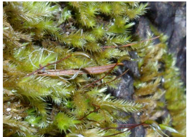
Figure 15. Homalothecium nuttallii , a species used in nests of the Hammond's Flycatcher in the Pacific Northwest.