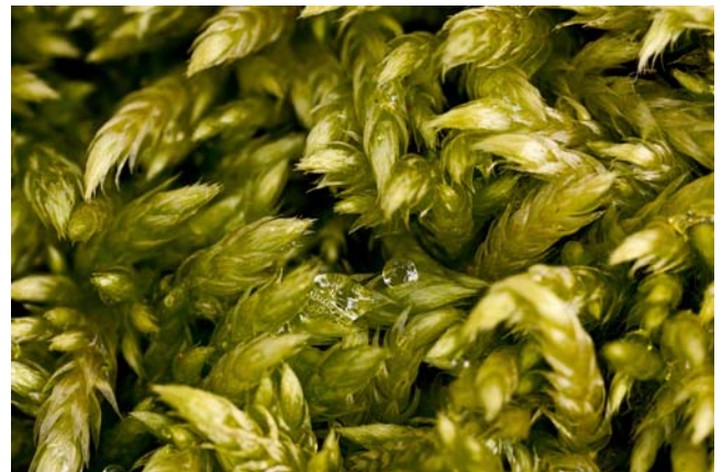
Figure 67. Brachythecium laetum , an epiphytic moss that was ignored when the Carolina Chickadee built its nest.