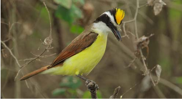
Figure 28. Pitangus sulphuratus , Great Kiskadee. Members of this species often include mosses in their nests..