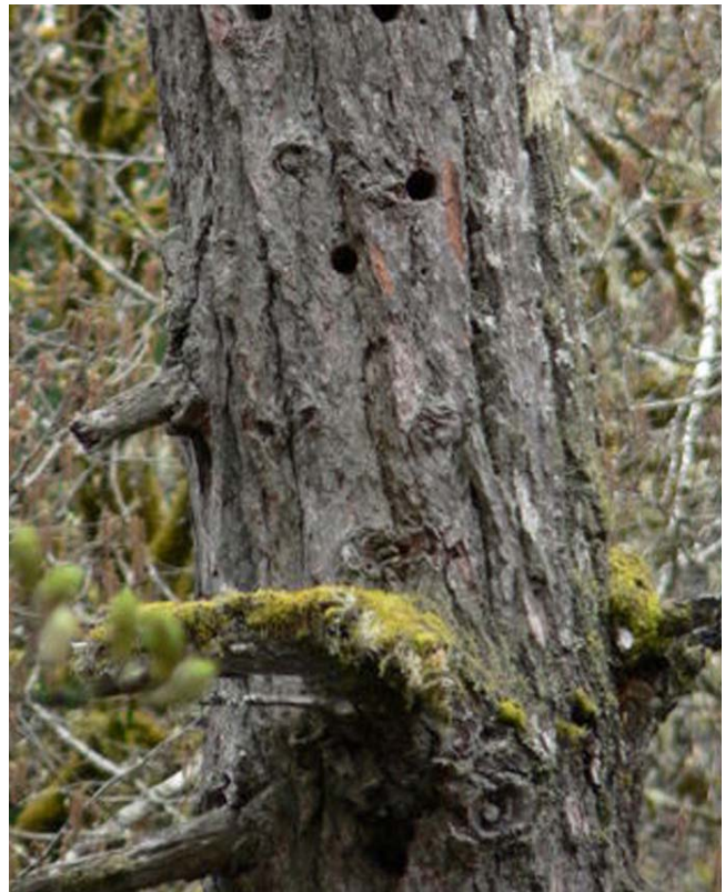
Figure 10. Pseudotsuga menziesii bark where Pacific-slope Flycatchers ( Empidonax difficilis ) build their nests in crevices.

In the Pacific Northwest, USA, Wolf (2009) found a nest of the Pacific-slope Flycatcher (Figure 8) on a fractured piece of bark on the tree bole of Pseudotsuga menziesii (Figure 10) at ~4 m above the ground. The bird had woven strands of the moss Isoetecium (Figure 11) into the rim of the nest and decorated the exterior with fragments of the lichen Sphaerophorus globosus (Figure 12). The Isoetecium had been relocated from elsewhere in the forest understory.