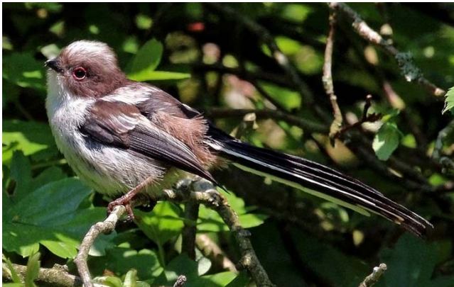
Figure 100. Aegithalos caudatus , Long-tailed Tit juvenile.