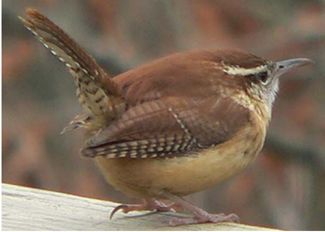
Figure 109. Thryothorus ludovicianus , Carolina Wren. Members of this species often include mosses in their nests and nest linings.

nest mostly in nooks and crannies, so nest boxes are especially suitable for them. Their nests (Figure 110) often contain mosses, along with leaves, twigs, rootlets, weed stalks, and even cast-off snake skins. Both males and females are the nest builders, but it is she who lines the nest with feathers, hair, fine grass, and moss. These prolific breeders will typically lay a second set of eggs as soon as the young birds leave the nest and may even have a third set.