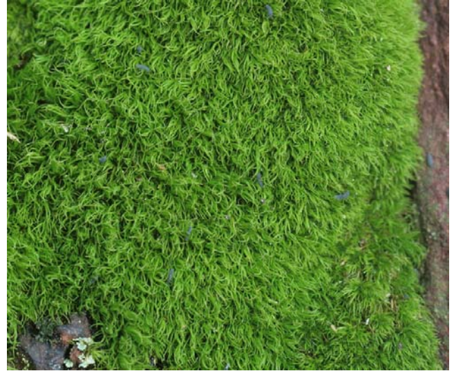
Figure 65. Dicranum montanum , an acrocarpous moss used in the nest of a Carolina Chickadee.