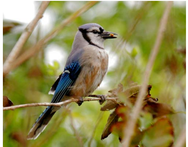
Figure 46. Cyanocitta cristata , Blue Jay. Members of this species often include mosses in their nests.