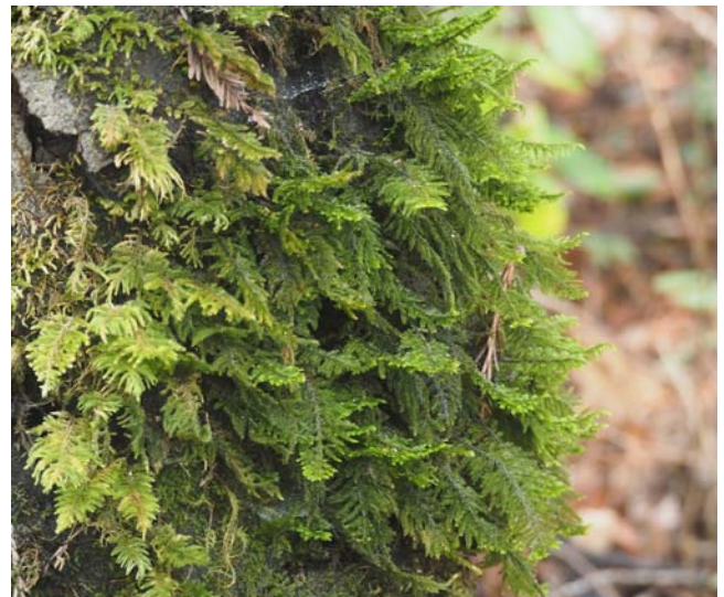
Figure 14. Dendroalsia abietina , a nest component of the Hammond's Flycatcher in the Pacific Northwest.