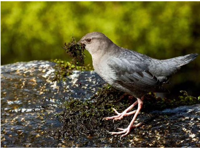
Figure 118. Cinclus mexicanus , American Dipper, gathering moss for its nest.

The American Dipper (Figure 117-Figure 118) is the only aquatic songbird in North America (Rosentreter 2014). It is a year-round resident, maintaining its streamside territorial defense year-round. It is known for its diving ability, down to nearly 7 m below the surface, and lives along unpolluted streams with riffles, cascades, and waterfalls. It makes a ball-shaped nest with a side entrance, placed on a cliff face, in a crevice, or under a bridge abutment, positions that help it to avoid predators. The outer shell of this nest is moss with its inner chamber made of pine needles. It uses stream mosses that it dives to obtain, hence they are dripping wet. These are woven into the nest, still wet, and as they dry they tighten the weave and help to affix the nest to its vertical substrate.