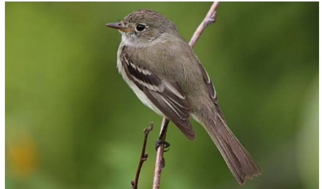
Figure 5. Empidonax alnorum , Alder Flycatcher. Members of this species often include mosses in their nests.