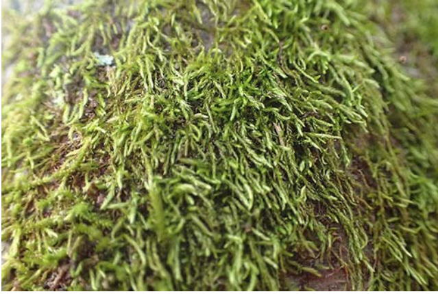
Figure 68. Clasmatodon parvulus , an epiphytic moss that was ignored when a Carolina Chickadee built its nest.