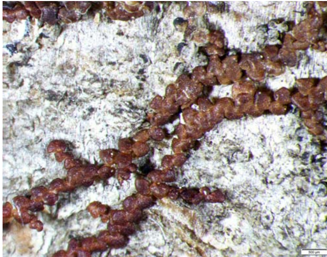
Figure 63. Frullania eboracensis , a leafy liverwort used in nests of Carolina Chickadees.