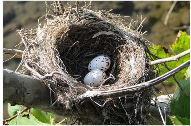
Figure 30. Tyrannus tyrannus , Eastern Kingbird, nest with eggs.