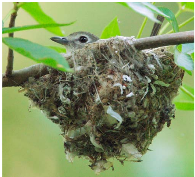
Figure 42. Vireo cassinii , Cassin's Vireo, nest with female. Members of this species often include mosses in their nests.