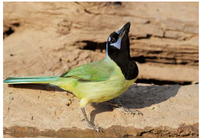
Figure 47. Cyanocorax yncas , Green Jay. Members of this species often include mosses in their nests.