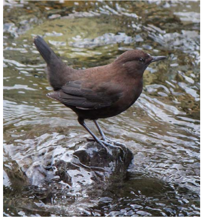
Figure 123. Cinclus pallasii pallasii , Brown Dipper, a bird that uses aquatic bryophytes in its nests.

The Brown Dipper, also known as the Pallas Dipper, ( Cinclus pallasii ; Figure 123), is an Asian dipper that uses mosses in its nests (Nishimura et al. 1980).