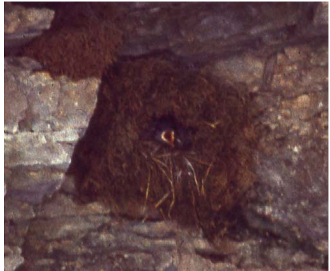
Figure 120. Cinclus mexicanus , American Dipper, nest of Hygrohypnum and Hygroamblystegium .

Terry McIntosh (Bryonet 2 June 2010) identified mosses in Dipper ( Cinclus mexicanus ; Figure 117-Figure 118) nests from northern Idaho. To his surprise, he found only one species, Scouleria marginata (Figure 121), a somewhat rare moss, despite the much greater abundance of S. aquatica (Figure 122). He attributed this selection to the stronger plants of S. marginata . By contrast, Ellen Anderson (Bryonet 2 June 1010) found 30 moss species and 5 liverwort species (plus a few unknowns) in 7 dipper nests in the area around Juneau, Alaska, USA. Most of the nests had only traces of mosses, but nevertheless had quite a few species, numbering 1, 7, 10, 11, 13, 14, and 16 (plus 5 unknowns).