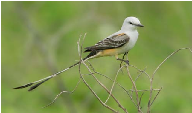
Figure 33. Tyrannus forficatus , Scissor-tailed Flycatcher. Members of this species often include mosses in their nests..