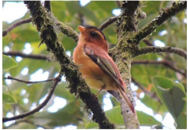
Figure 96. Piprites pileata , Black-capped Piprites. Members of this species often build their nests of mosses.

Only one example in this family has emerged. The Black-capped Piprites ( Piprites pileata ; Figure 96) builds a spherical nest made of mosses (Cockle et al. 2008).