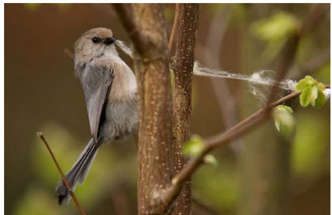
Figure 98. Psaltriparus minimus , Bushtit, pulling on nest materials.