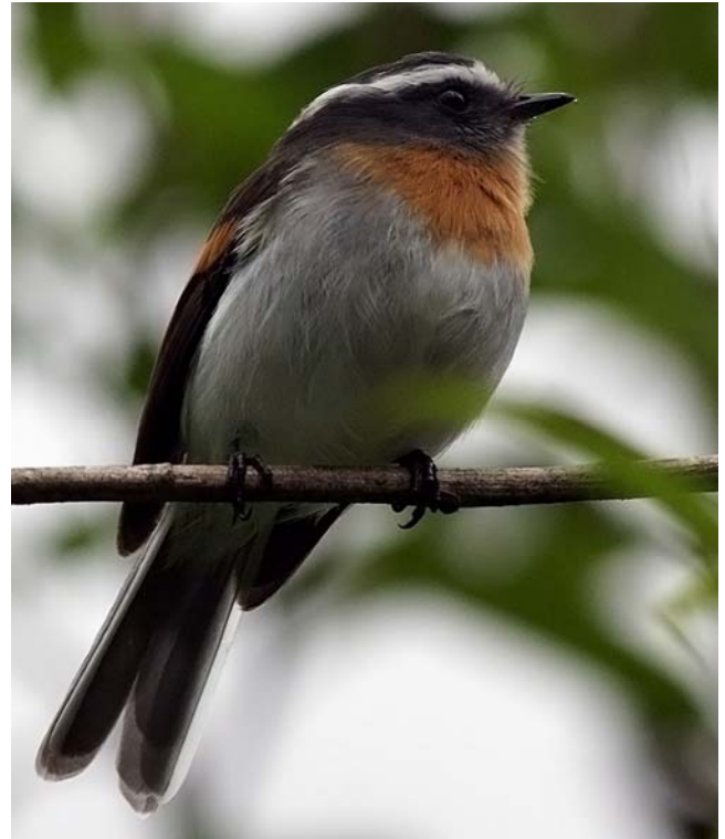
Figure 35. Ochthoeca rufipectoralis , Rufous-breasted Chat Tyrant. Members of this species often include mosses in their nests.

Other species, such as Rufous-breasted Chat ( Ochthoeca rufipectoralis ; Figure 35) and Slaty-backed Chat-tyrant ( O. cinnamomeiventris ; Figure 36) also place their mossy cups on ledges (Hilty & Brown 1986; Greeney 2007).