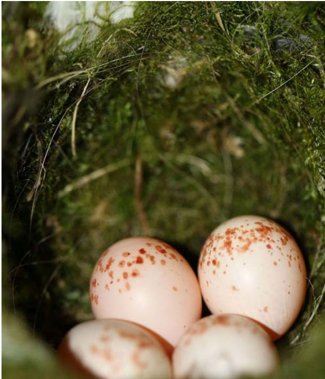
Figure 8. Empidonax difficilis , Pacific-slope Flycatcher mossy nest with eggs.