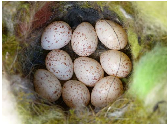
Figure 92. Parus major , Great Tit, with eggs in nest on mosses.

When Great Tits ( Parus major ; Figure 80) built a second nest in nest boxes after rearing their first brood, they still used mosses in the nest, but there was no lining or inner layer – or any eggs (Slagsvold 1984).