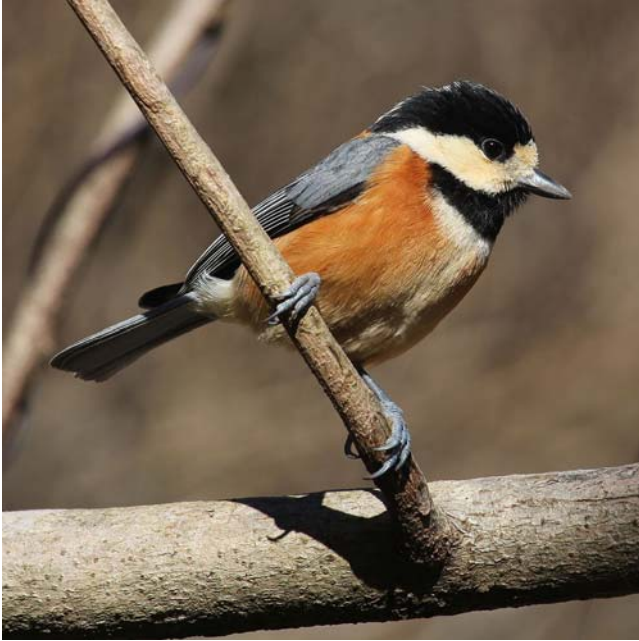
Figure 79. Sittiparus varius , Varied Tit. Members of this species often include mosses in their nests.