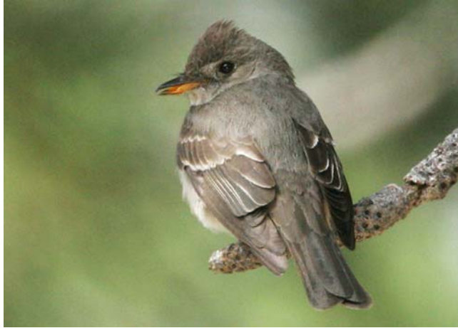
Figure 2. Contopus sordidulus , Western Wood Pewee. Members of this species often include mosses in their nests.

Contopus sordidulus (Western Wood-Pewee; Figure 2) Empidonax flaviventris (Yellow-bellied Flycatcher; Figure 4) Empidonax alnorum (Alder Flycatcher; Figure 5) Empidonax minimus (Least Flycatcher; Figure 6) Empidonax difficilis (Pacific-slope Flycatcher; Figure 7-Figure 8) Empidonax hammondi (Hammond's Flycatcher; Figure 13) Empidonax occidentalis (Cordilleran Flycatcher; Figure 18) Sayornis nigricans (Black Phoebe; Figure 19) Sayornis phoebe (Eastern Phoebe; Figure 20-Figure 21) Sayornis saya (Say's Phoebe; Figure 26-Figure 27) Pitangus sulphuratus (Great Kiskadee; Figure 28) Tyrannus melancholicus (Tropical Kingbird; Figure 31) Tyrannus couchii (Couch's Kingbird; Figure 32) Tyrannus forficatus (Scissor-tailed Flycatcher; Figure 33) Pachyramphus aglaiae (Rose-throated Becard; Figure 37)