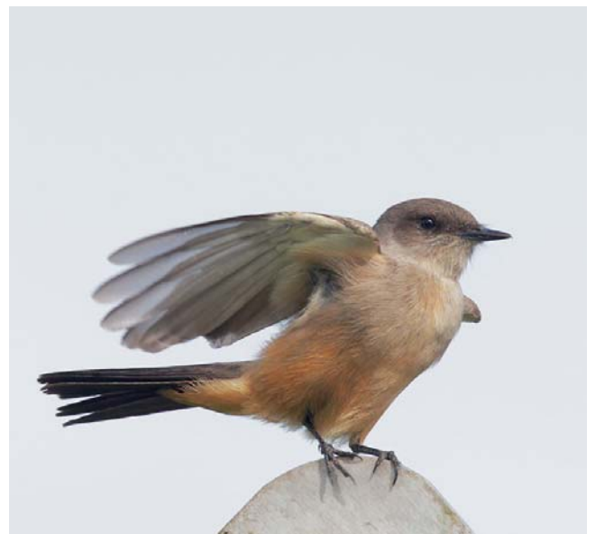
Figure 26. Sayornis saya , Say's Phoebe. Members of this species often include mosses in their nests.