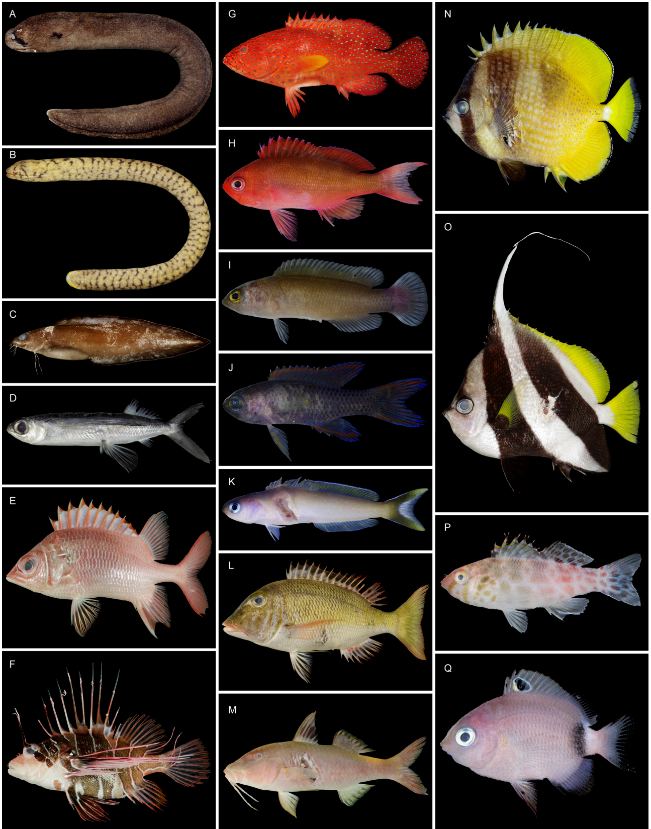
Fig. 1. Additional fishes of Yonaguni-jima Island – 1. A: Gymnothorax breedeni , KAUM-I. 88890, 587.0 mm TL; B: Uropterygius fasciolatus , KAUM-I. 88909, 317.0 mm TL; C: Brotula sp., KAUM-I. 88883, 220.4 mm SL; D: Cypselurus poecilopterus , KAUM-I. 88905, 154.7 mm SL; E: Sargocentron caudimaculatum , KAUM-I. 88906, 119.5 mm SL; F: Pterois radiata , KAUM-I. 88906, 119.5 mm SL; G: Cephalopholis miniate , KAUM-I. 88892, 200.4 mm SL; H: Pseudanthias cooperi , KAUM-I. 88466, 31.6 mm SL; I: Pseudochromis luteus , KAUM-I. 88454, 38.3 mm SL, female; J: Assessor randalli , KAUM-I. 88452, 24.0 mm SL; K: Hoplolatilus cuniculus , KAUM-I. 88465, 52.4 mm SL; L: