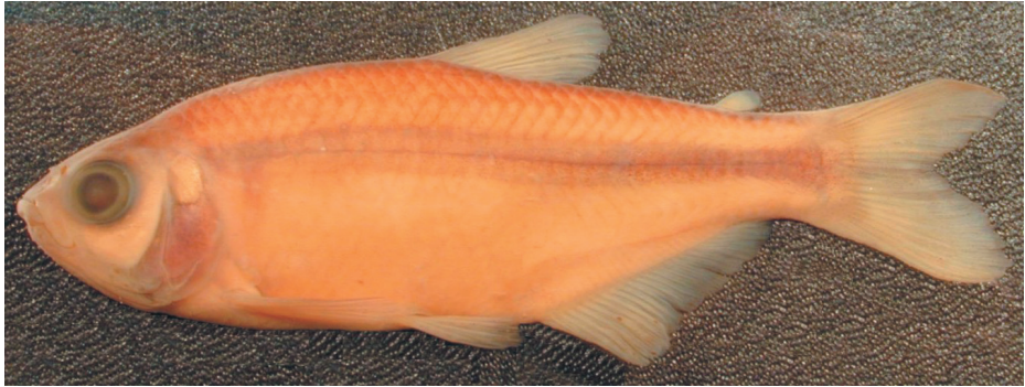
Fig.1 Astyanax hermosus sp. n., ILPLA 1690. Holotype male, 78.5 mm SL.