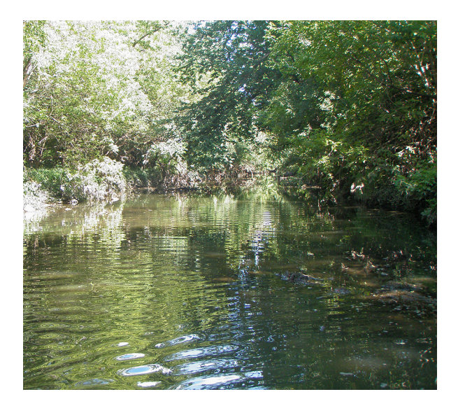
PLATE 4 . Photograph of Flag Creek at Cochise Drive, Cook County, Illinois.