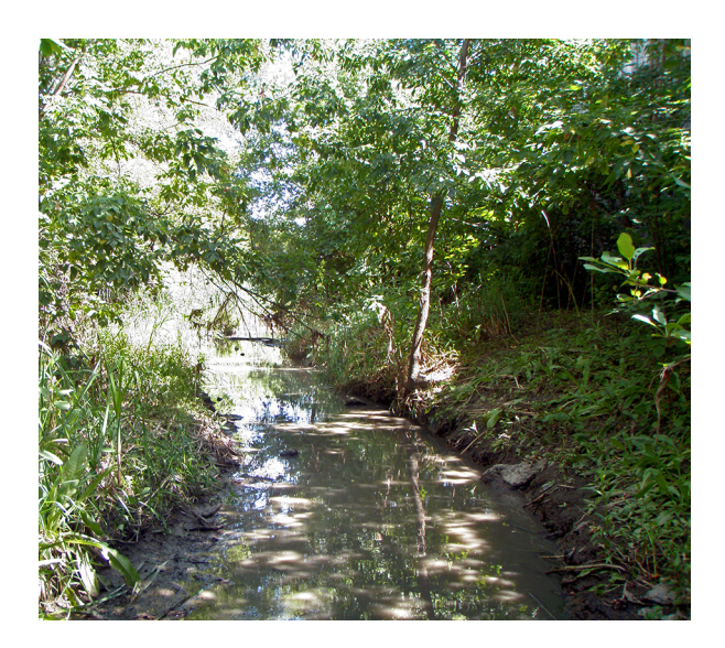
PLATE 2. Photograph of Crystal Creek, Cook County, Illinois.