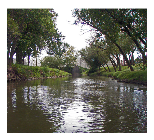
PLATE 1. Photograph of Willow Creek, Cook County, Illinois.

Site-specific photographs for mussel surveys within the I-294 project corridor.