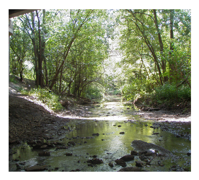
PLATE 5 . Photograph of Flag Creek at Spring Rock Park, Cook County, Illinois.

Site-specific photographs for mussel surveys within the I-294 project corridor.