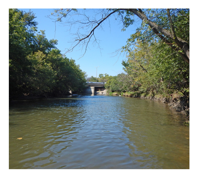
PLATE 6 . Photograph of Salt Creek at Dean Nature Preserve, upstream from I-294, Cook County, Illinois.