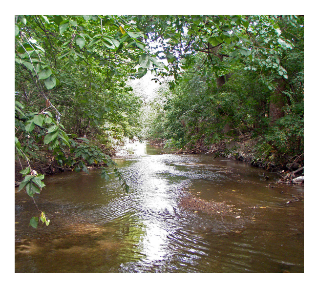
PLATE 3 . Photograph of Addison Creek, Cook County, Illinois.