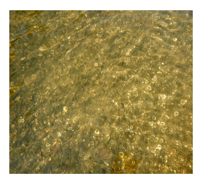
PLATE 8 . Relict shells of the invasive Asian Clam, Corbicula fluminea , composing part of the substrate in Salt Creek at Bemis Woods, Cook County, Illinois.