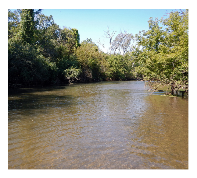
PLATE 7 . Photograph of Salt Creek at Bemis Woods, Cook County, Illinois.