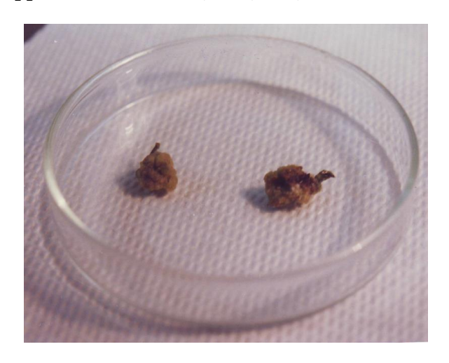
Figure 3 Callus from explants of leaf M. boaria

The major advantage of the cell cultures include synthesis of bioactive secondary metabolites, running in controlled environment, independently of climate and soil conditions. The use of in vitro plant cell culture for the production of chemicals and pharmaceutical has made great strides building on advances in plant science.