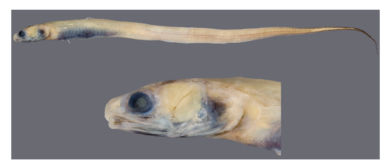
Fig 1. Echiodon prionodon sp. nov., left lateral view (holotype NMNZ P.041833, 165 mm TL).

Off White Island, outer Bay of Plenty, New Zealand, 37° 33.57'S – 176° 59.1-58.8'E, 313 m bottom trawl.