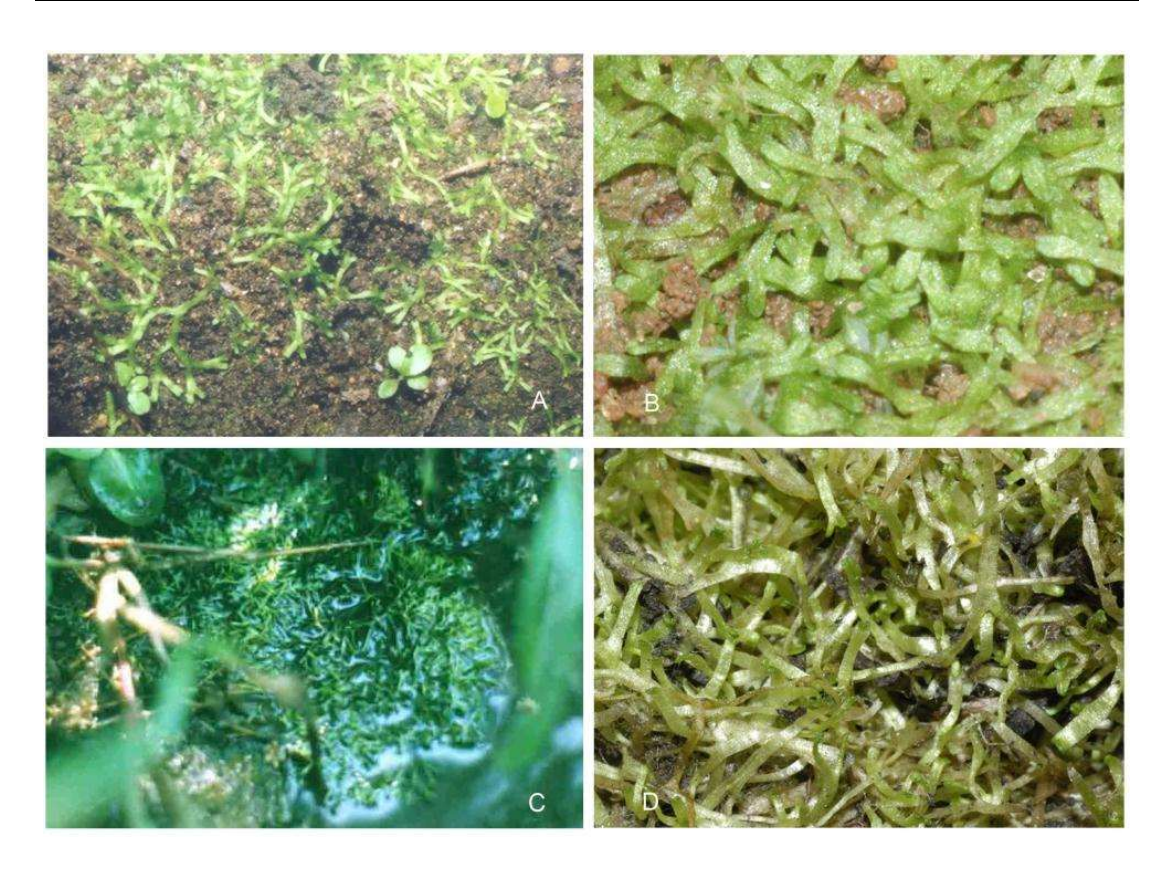
Figure 1. Riccia stricta specimens collected from different localities of Western Ghats, A: KPR 106927 (terricolous). B: MCN 84369 (terricolous). C: MCN 84511 (aquatic). D: KPR 99809 (aquatic).

Riccia fluitans auct. mult. non L., Species Plantarum 1139. 1753; emend K.Mueller, Aufl. 6 Bd. 1. Abt. 204. f. 134. 1907. Ricciella fluitans (L.) A.Braun, Species Plantarum 1139. 1753. Riccia canaliculata Hoffm., Deutsch. Fl. 2: 96. 1795. R. canaliculata Hoffm. var. fluitans Schiffn., Oester. Bot. Zeitsch. 49: 387. 1899. Riccia duplex Lorb. & K.Mueller, Hedwigia 80: 100. 1941. Riccia media Klingm., Flora 146: 616. 1958.