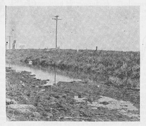
Figure 2—A breeding place for mosquitoes This roadside pool, composed largely of seepage from a nearby stockyard, contained more than 3,000 mosquito larvae per square foot of water. A light application of fuel oil sprayed on the surface, gave complete control.

number 2 grade of fuel oil are satisfactory as larvacides. An educational program is necessary to familiarize the citizens with the life history of mosquitoes so that they can treat or eliminate the breeding places around their own premises. A typical breeding place is shown in Fig. 2.