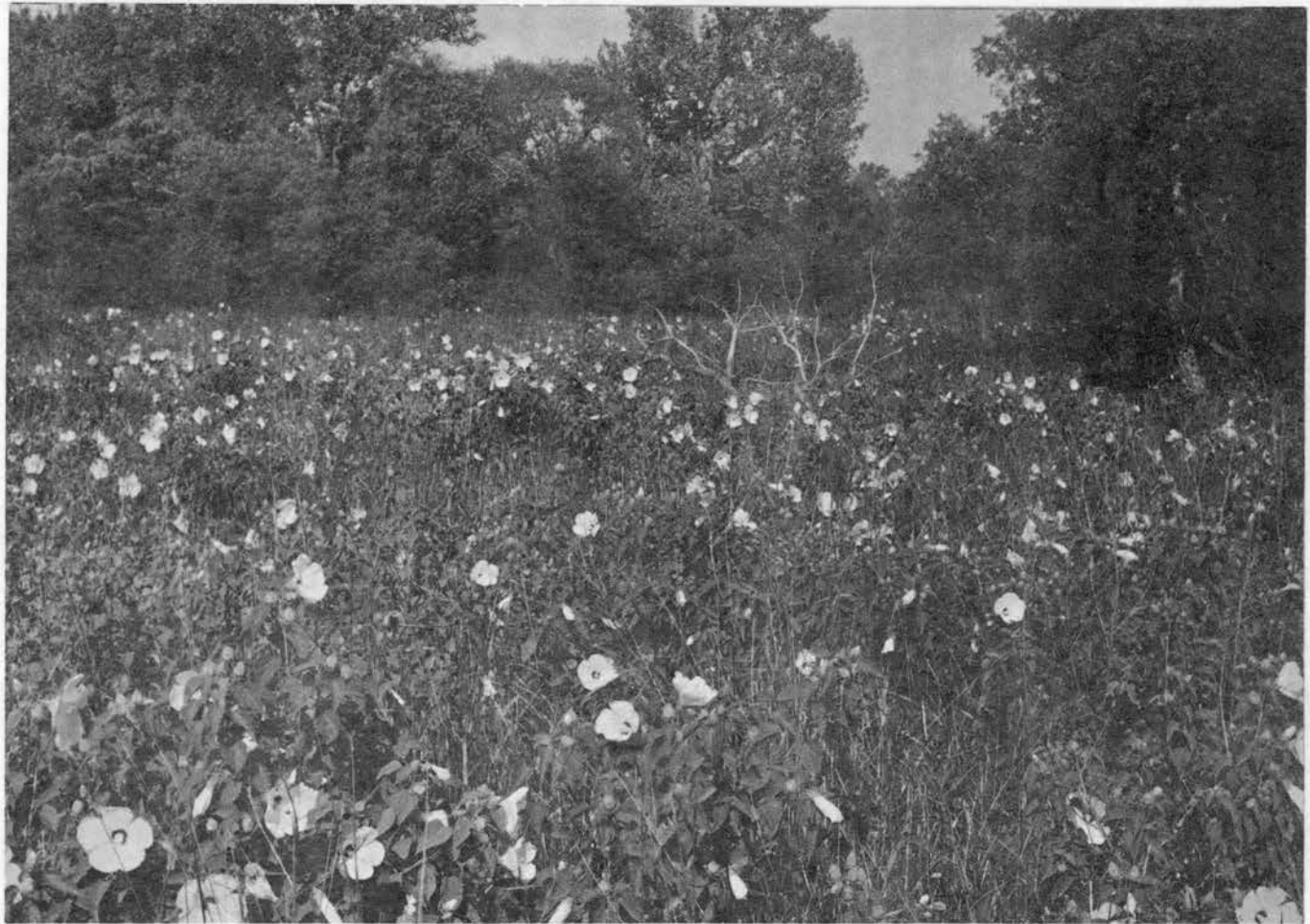
Figure 6. Riparian Vegetation of Canadian River Bottomlands.