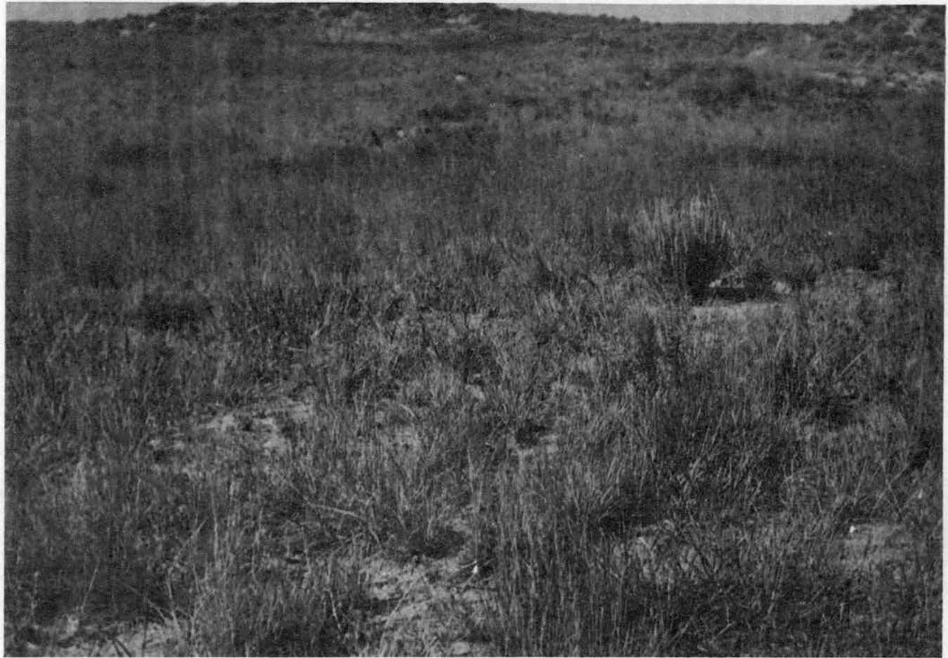
Figure 4. Highplains Bluestem Postclimax Community. Detail View.