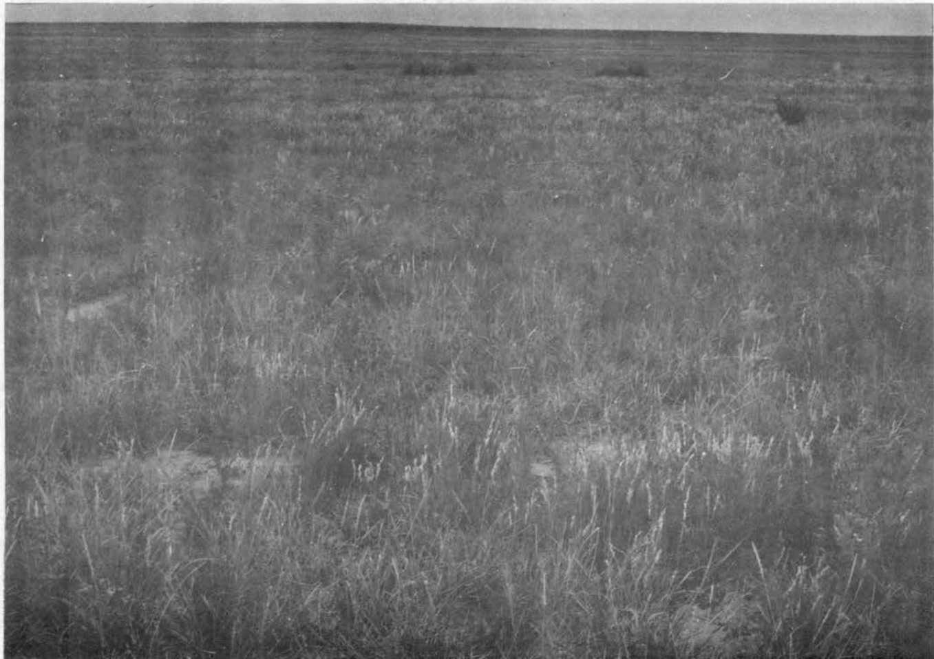
Figure 5. Climax Mixed Prairie.