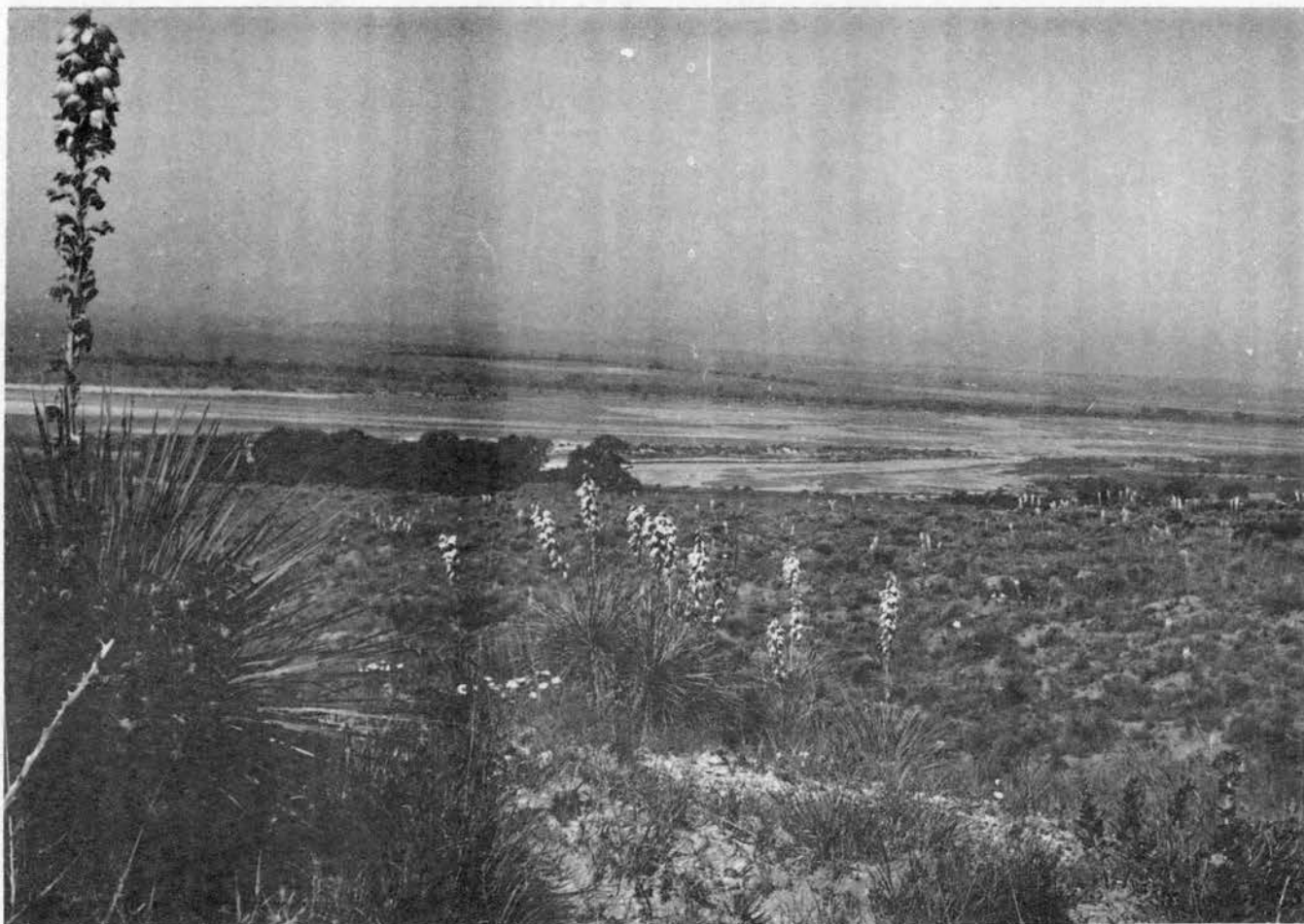
Figure 3. Highplains Bluestem Postclimax Community. General View.