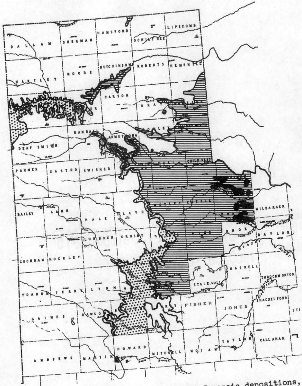
Figure 1. Geological map. Undivided Cenozoic depositions, unshaded; Jurassic and Triassic, stippled; Permian, horizontal lines; Quaternary, solid black.