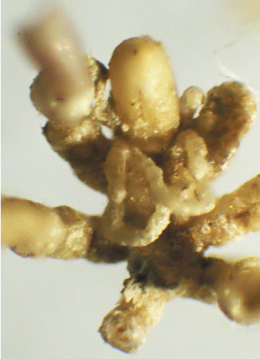
Figure 3. Abnormal Neotrygaeus communis female specimen: dorsal (left) and ventral (right) view. Scale bar: 0.5 mm.

Sea Pycnogonida, probably due to an oversight. The former is collected on algae between 0 and 160 m depth, while the latter is associated to Posidonia prairies and algae from 2.9 to 16 m (Chimenz Gusso 2000; Munilla & Soler-Membrives 2014). On the other hand, on the vertical rocky cliff of Portofino shallow waters, we found C. phantoma , C. tiberi and P. pusillum , which are new records for the Ligurian Sea.