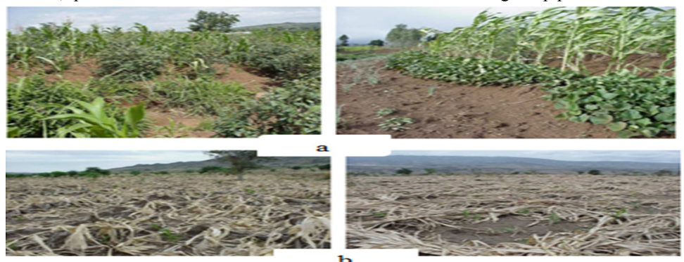
Figure5: Cha-sorghum-sweet potato, bean intercropping in Harereghe (a) and crop residue management (Konso)

Agronomic land management practice, which involves the growing of different kinds of crops in the same field. The crops grown together are, however, harvested at different times. Different agronomic measures (such as mixed, strip, and inter cropping, fallowing, contour cultivation, mulching). According to MoA (2010), in Konso farmers are used to growing of 10-15 types of crops on the same field. The aim is to avoid risk of crop loss and reduce vulnerability to food shortage. Some crops are more resistant to or escape the adverse conditions of drought, pest and diseases. Annual crops are sown or planted in two seasons. Annual and perennial crops are planted and managed according to their seasonal calendar. Low fertility status, unpredictable and erratic rainfall, pest and diseases are some of the constraints limiting crop production.