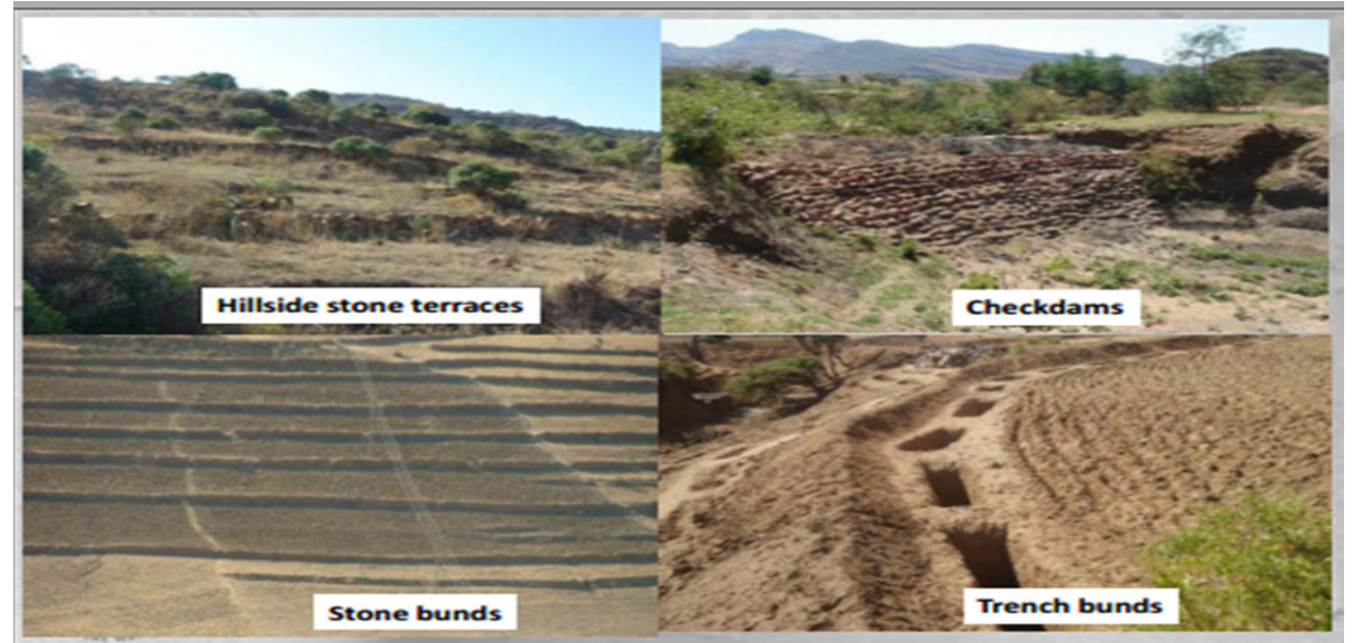
Figure2: Different soil and water conservation structures in Tigray, Ethiopia, Kifle (2012)

Physical or mechanical conservation include a wide variety of practices and structures in most cases are aimed to reduce slope of the land so as to stop or slow down the velocity of water that will cause erosion. Moreover, physical structure is implemented to control runoff and soil erosion in fields where biological control practices alone are insufficient to reduce erosion. According to Alemu and Kidane (2014), and Kebede (2015) mechanical structure such terraces, check dams, stone or/and soil bunds, trenches and micro basins modify terrain through changing slope length and angle, which in turn reduce runoff velocity, enhance water infiltration and trap sediments washed down the terrain.