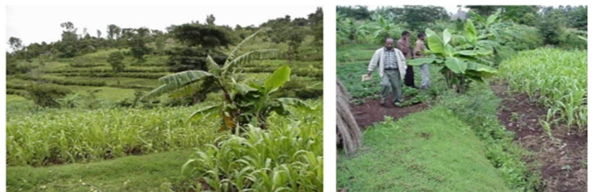
Figure3 : Farmland terraces vegetated by various vegetative measures in Omo Sheleko Woreda.