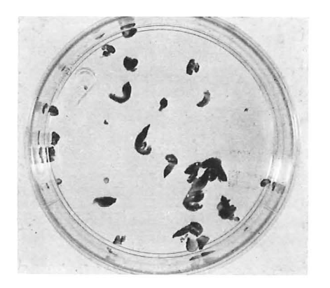
Fig. 1: Differentiation of leaf-like structures from a single fragmented apex of Cabernet Sauvignon grapevine after 1 month in liquid culture. \times 0.8.

The number of woody plant species which has been propagated in vitro by means of somatic embryos or adventitious buds is very small compared with herbaceous plant species (MURASHIGE 1974). Induction of plantlets from embryogenic