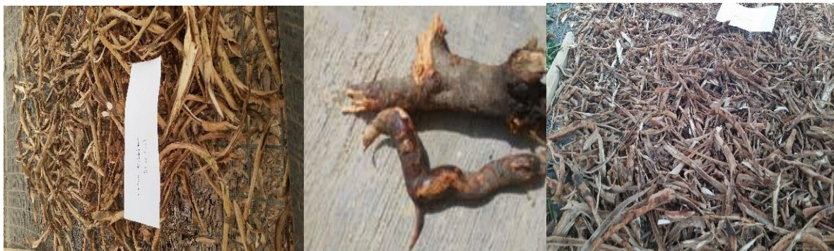
Figure 4: Stem bark (CPMR Arboretum)