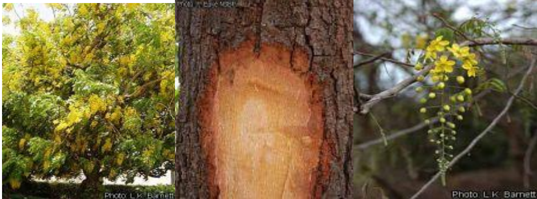
Figure 1: Flowering tree [5]

Individuals range from 10-20m in height. The colour of the bark ranges from dark grey to black. The lenticels are horizontal and reddish in colour. The leaves are arranged in leaflets that contain 7-10 pair of opposite leaves. The upper side of the leaf is moderately shiny while the bottom has very fine nerves with stipules that are deciduous.[6] This plant has both flowers and fruit. The flowers are very bright yellow during the dry season, which is from February through to March. The flowers are also arranged either uprightly or in pendulous racemes ranging from 30–50 cm. September through to February is when the fruit reaches maturity. [6]