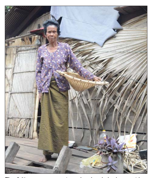
Fig. 2 Kuy woman carrying a handmade basket outside a traditional house. Phneak Roluek Village, Preah Vihear Province, September 2014.