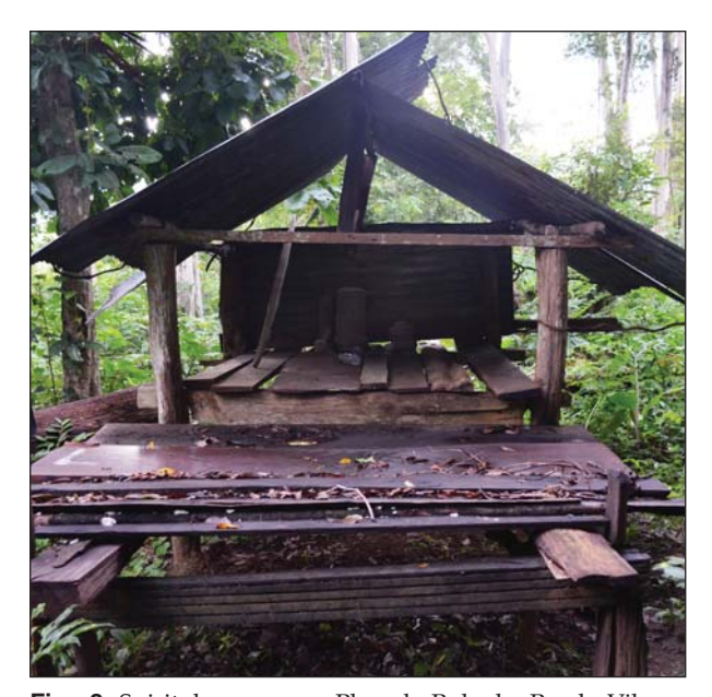
Fig. 8 Spirit house near Phneak Roluek. Preah Vihear, September 2014 (© Nerea Turreira-García).

© Centre for Biodiversity Conservation, Phnom Penh