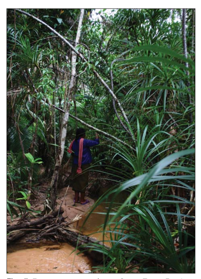
Fig. 7 Evergreen swamp forest. Stung Treng Province, December 2016.