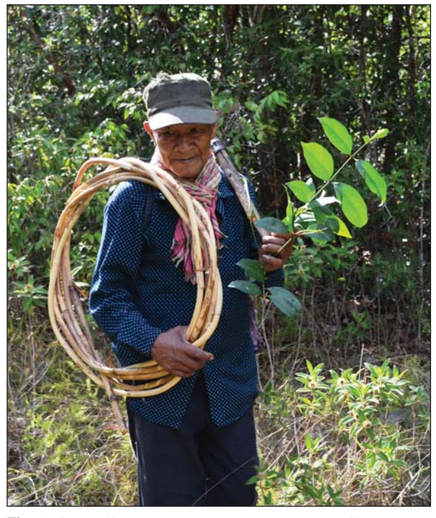
Fig. 3 Plant collector in Prey Lang, near Spong Village, Stung Treng Province, May 2015.