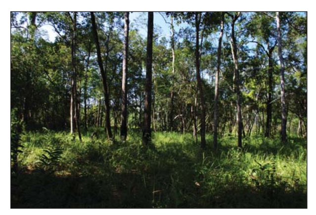
Fig. 4 Deciduous forest. Stung Treng Province, September 2014.