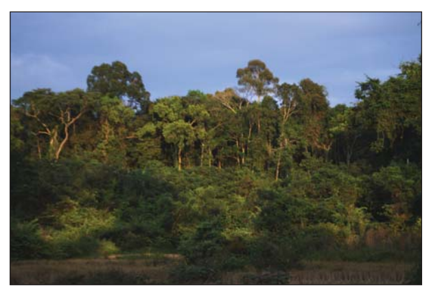
Fig. 6 Short semi-evergreen forest and evergreen dipterocarp forest. Preah Vihear Province, December 2016.