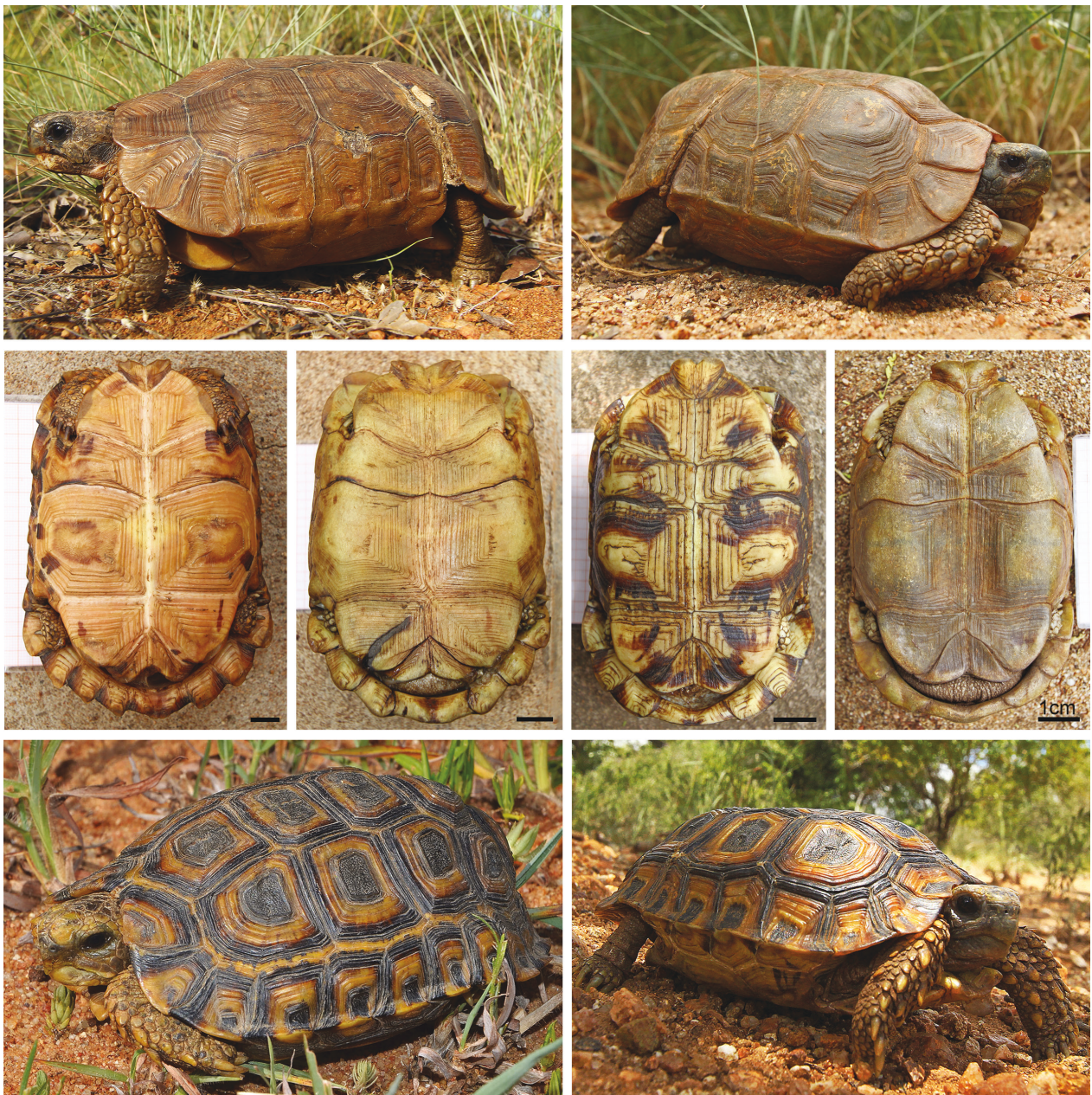
Fig. 2. Top: Lateral views of adult Kinixys lobatsiana (left) and K. spekii (right). Center: Ventral views of young (SCL 106 mm) and adult (SCL 161 mm) K. lobatsiana (left) and young (SCL 131 mm) and adult (SCL 151 mm) K. spekii (right). Note the strongly serrated posterior marginal scutes in K. lobatsiana compared to the smooth carapace rim in K. spekii . Bottom: Lateral views of adult K. natalensis (left) and young K. spekii (right).

natalensis additional voucher photographs showing the tricuspid beak should be taken.