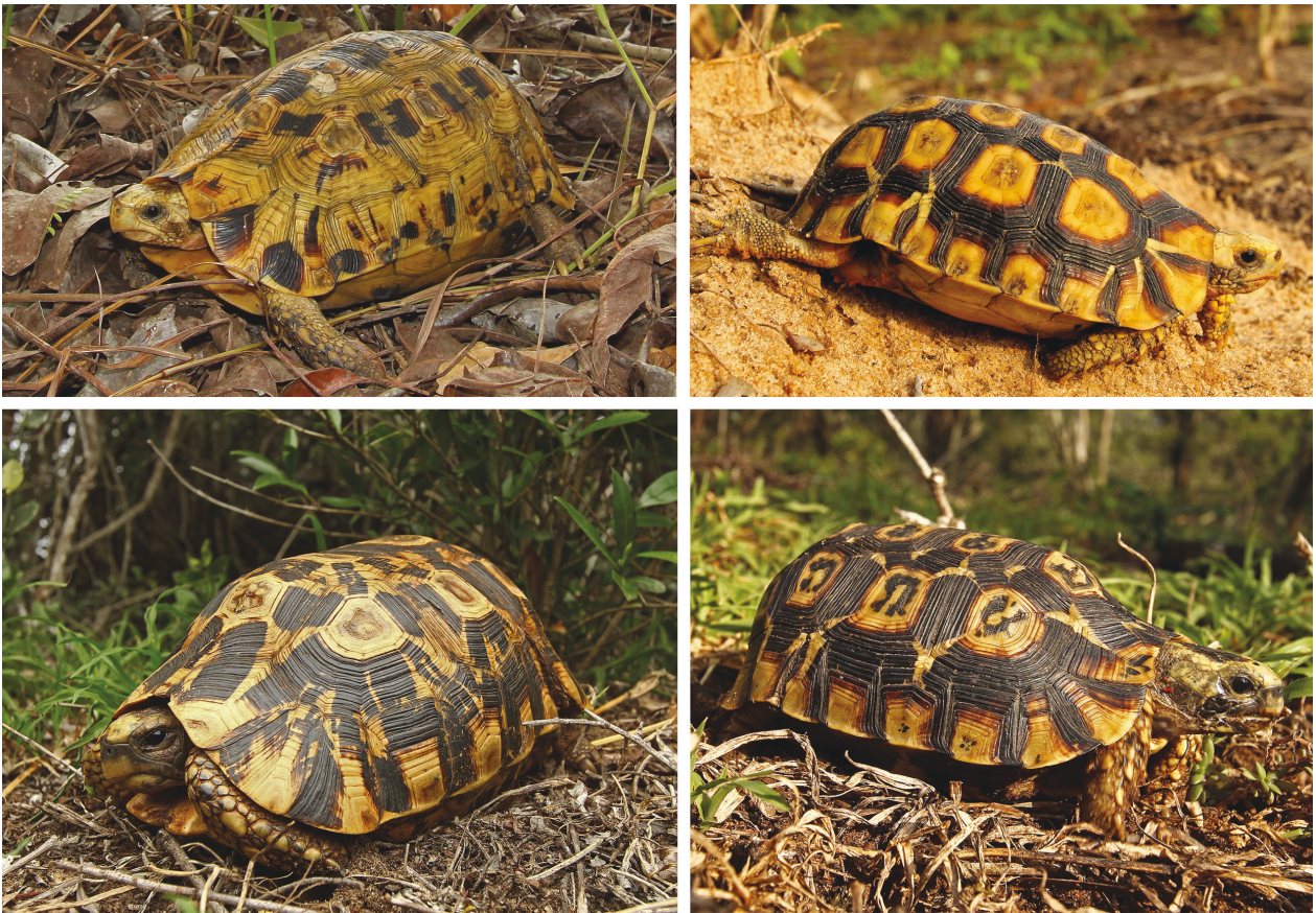
Fig. 3. Top: Lateral views of the putative hybrids from the Afungi Peninsula, Cabo Delgado Province, Mozambique, which have mtDNA sequences of Kinixys spekii but morphologically resemble K. zombensis . Bottom: Lateral views of genetically verified K. zombensis from KwaZulu-Natal Province, South Africa.