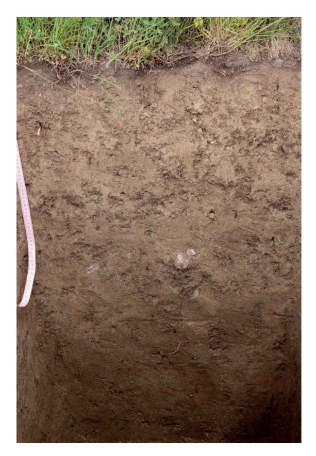
Figure 4: Soil profile cleared of stones. Large artificial terrace, 1943 m a.s.l., meadow steppe (North Ossetia, Uallagcom Basin).

Slika 4: Talni profil z odstranjenim kamenjem. Velika umetna terasa, 1943 m n.m.v., travniška stepa (Severna Osetija, Uallagcom).