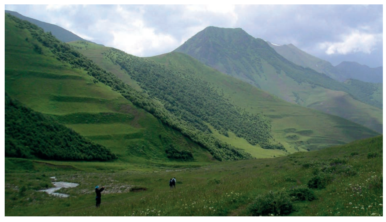
Figure 3: Meadow steppes on the abandoned bench-like terraces, northern slope, 1800–1900 m a.s.l. (North Ossetia, Uallagcom Basin).

Slika 3: Travniška stepa na opuščenih terasah, podobnih klopi, severno pobočje, 1800–1900 m n.m.v. (Severna Osetija, Uallagcom).