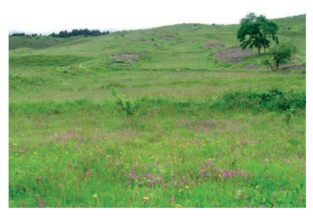
Figure 2: Subalpine meadows on the small abandoned terraces formed by plowing, 1870–1980 m a.s.l. (North Ossetia, Tsey Basin).

The most gentle terraces at the lowest slope position with deep soils are the most mesophilous habitats. They were used for growing vegetables, and newly formed grasslands, which developed after the abandonment of the Upper Tsey village, are not older than 25 years. Soils, Mollic Umbrisols (Anthric Loamic Aric), are loose, well