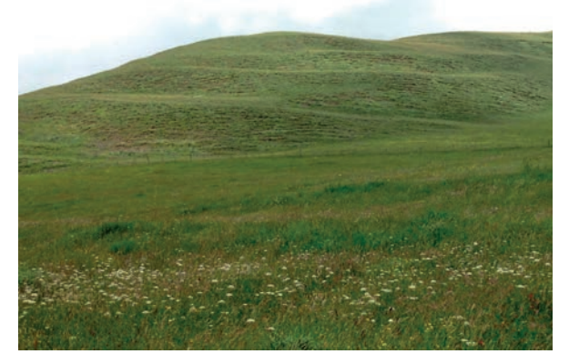
Figure 5: Scarps of the terraces on the southern slope, 1900–2000 m a.s.l. (North Ossetia, Uallagcom Basin). Slika 5: Terasne stopnje na južnem pobočju, 1900–2000 m n.m.v., (Severna Osetija, območje Uallagcom).

A large terrace with stone retaining wall was described on the northern slope, left bank of Songutidon River, 1996 m a.s.l. The vegetation cover had characteristics similar to those described on the southern slope and did not reflect the climatic differences of different slope aspects.