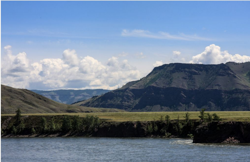
Figure 5. doi

West Sayan, Yenisei river. Two individuals of M. davidii were captured with ground-level mist-nets.