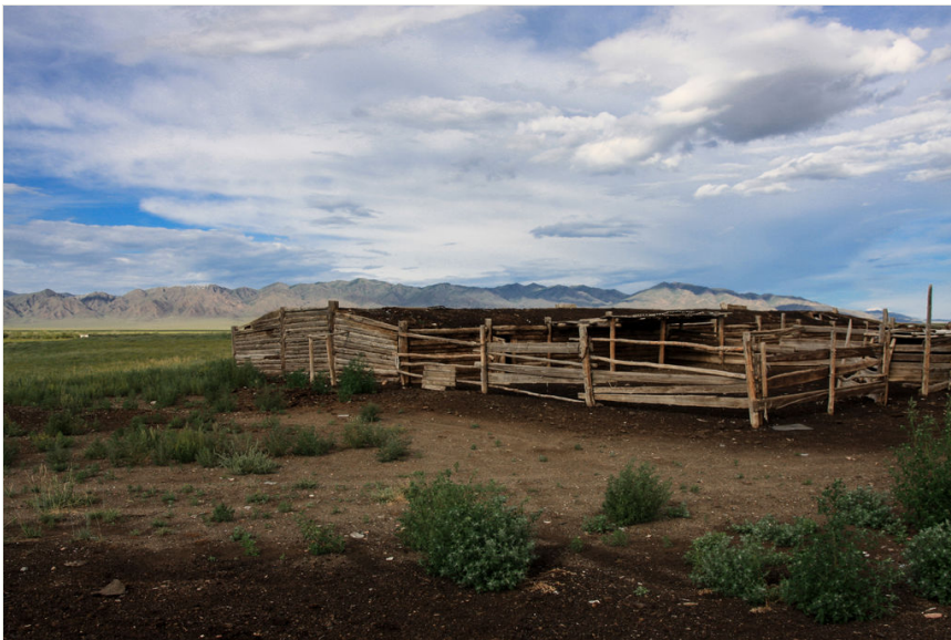
Figure 6. doi

West Sayan, Yenisei river. Two individuals of M. davidii were captured with ground-level mist-nets.