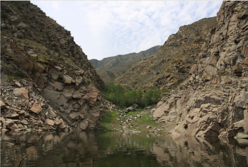
Figure 4. doi

Tes river. Fourteen individuals of M. davidii were captured with ground-level mist-nets.