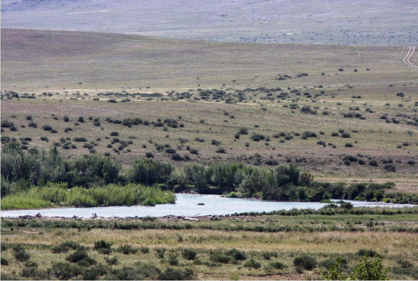
Figure 3. doi

Tes river. Fourteen individuals of M. davidii were captured with ground-level mist-nets.