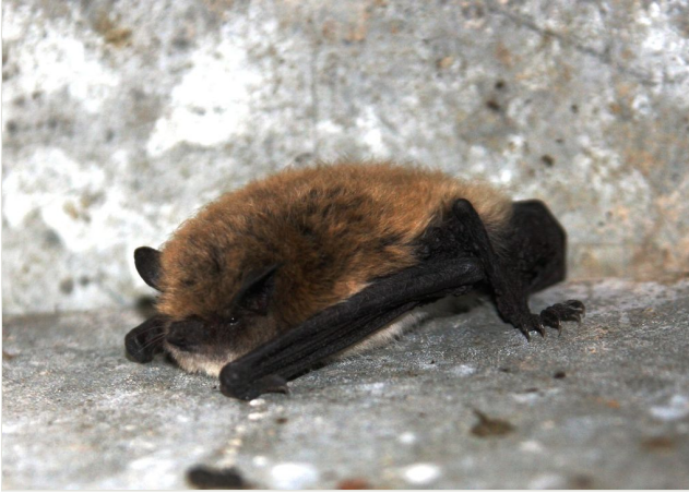
Figure 1. doi

The base of the hair is dark, the tip is light, the wing membranes and ears are dark Fig. 1.