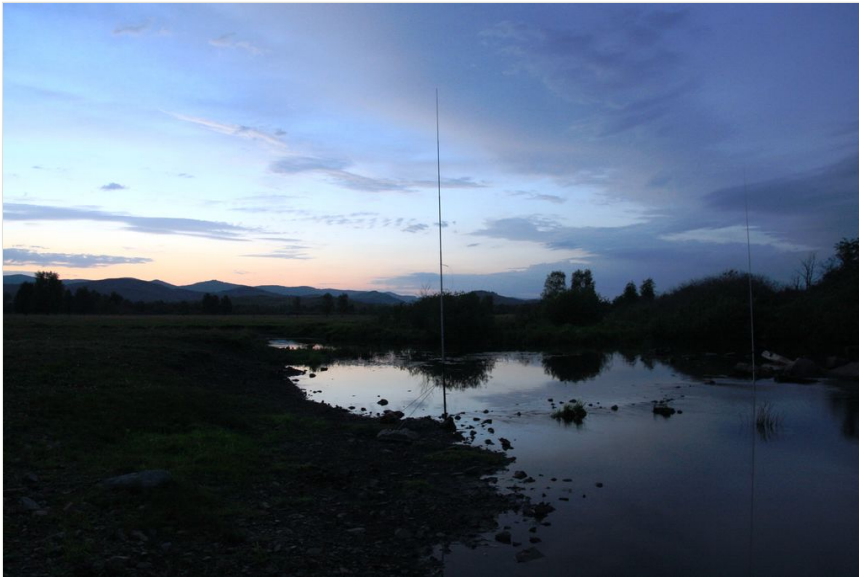
Figure 7. doi

We captured 2 adult males of M. davidii on the Bol'shoj Kizil river (Fig. 7), which is 150 km north of the previously known find. Myotis mystacinus were captured in the same locality. Thus, these cryptic species occur in sympatry.