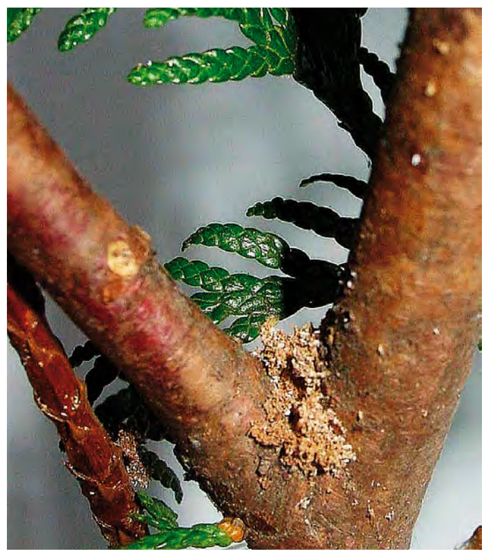
Starting maturation feeding of adult Phloeosinus rudis. Beginnende rijpingsvraat door een adulte Phloeosinus rudis.

is larger and is able to kill large mature trees. For the identification keys on Phloeosinus can be referred to Balachowsky (1949) and Pfeffer (1995). Information on the biology can be found in Schwenke (1974) and Sobczyk & Lehmann (2007).