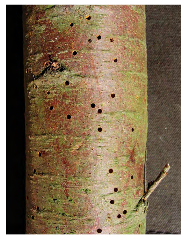
Exit holes of young Phloeosinus rudis beetles. Uitvlieggaatjes van jonge Phloeosinus rudis kevers.