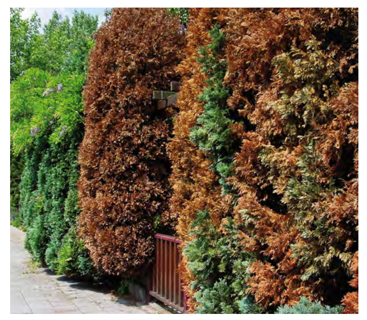
Hedge of Chamaecyparis with dead shrubs infested by the Japanese cypress bark beetle, Phloeosinus rudis. Heg van Chamaecyparis met dode struiken aangetast door de Japanse thujabastkever, Phloeosinus rudis.