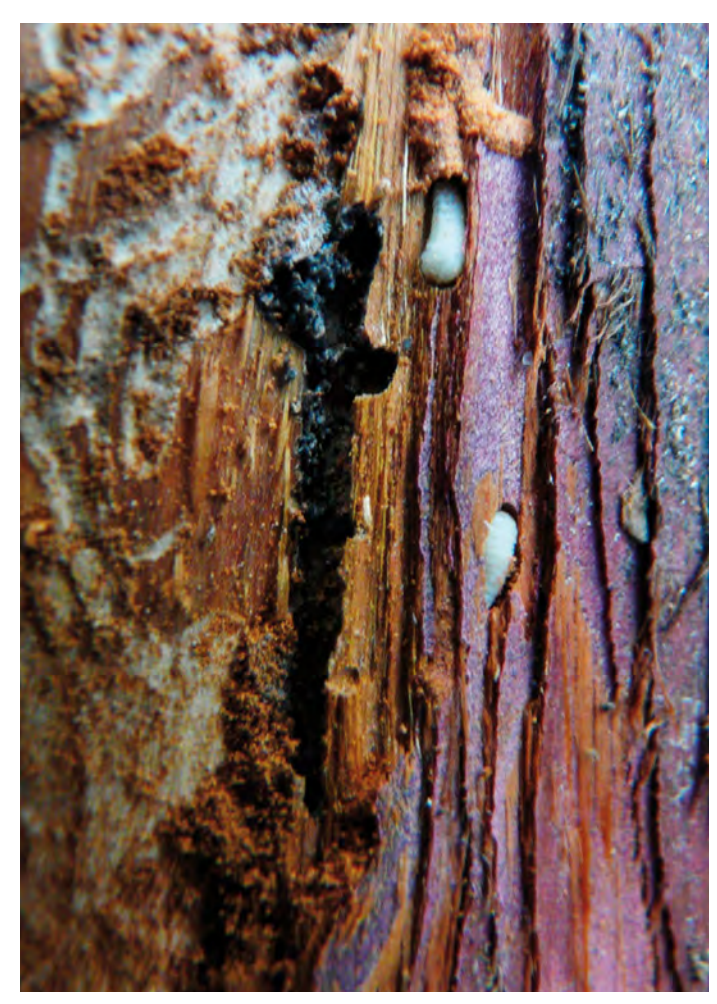
7. Overwintering Phloeosinus rudis larvae in the bark.

7. Overwinterende Phloeosinus rudis larven in de bast.