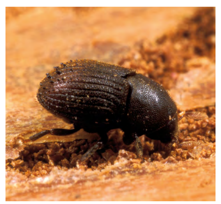
6. Adult of Phloeosinus rudis. 6. Een adult van Phloeosinus rudis.

Juniperus communis is a protected indigenous shrub species in The Netherlands, mainly growing on heath lands in nature reserves. Until now, no infestations of P. rudis were found on this shrub in The Netherlands. In Germany, P. bicolor and P. thujae seem not to be able to disperse over a large area, because the infestations occur only locally in certain cities. The wild Juni perus communis grows far away from cities and seems here not really endangered (Sobczyk & Lehmann 2007). However, in North-America it was demonstrated that Phloeosinus chamberlini Blackman 1942, had dispersed over about 24 km (Furniss & Furniss 1972). The widespread infestations in 2004 about 30 km around Rotterdam also suggest that P. rudis may have a good active dispersal capacity and it may not be excluded that it may colonize heath lands from infested urban areas in the long run. It remains unclear what the impact of P. rudis on J. communis will be.