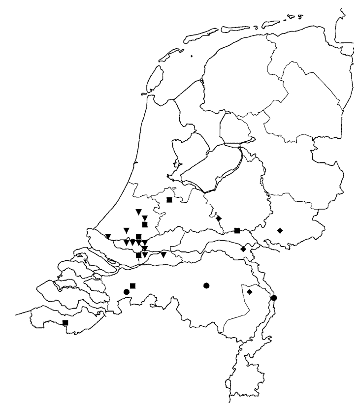
8. Records of infestations by Phloeosinus rudis (♥), P. thujae (♦), P. bicolor (●) and Phloeosinus spec. (■ - unidentified Phloeosinus species) in 2004 as derived from the Alterra monitoring scheme. Not all records are visible, due to some overlap in sites for the separate species. 8. Waarnemingen uit het Alterra monitoringsproject van aantastingen door Phloeosinus rudis (♥), P. thujae (♦), P. bicolor (●) en Phloeosinus spec. (■ - ongeïdentificeerde Phloeosinus soorten) in 2004. Niet alle waarnemingen zijn zichtbaar door overlap in enkele vindplaasten van de verschillende soorten.

7. Overwinterende Phloeosinus rudis larven in de bast.