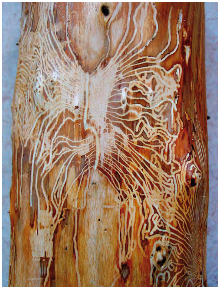
4. Trunk of 60-year-old Thuja with the longitudinal egg gallery and transversal larval galleries of Phloeosinus rudis . 4. Stam van een 60-jarige Thuja met het broedbeeld van Phloeosinus rudis , een verticale moedergang met horizontaal uitwaaierende larvengangen.

In 2004, infestations of P. thujae were observed in the Dutch cities of Veenendaal (Gelderland, in a hedge of Juniperus chinensis ), Nijmegen (Gelderland, hedge with unidentified conifers), Doetinchem (Gelderland, 15-year-old Thuja ), Venray (Limburg, hedge of Chamaecyparis ) and in Thuja at Boskoop (Zuid-Holland)