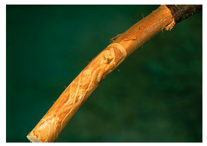
Maturation feeding of adult Phloeosinus thujae in a small branch. Rijpingsvraat door een adulte Phloeosinus thujae in een dunne tak.

In 2004, the year of the first infestations, all records from the Alterra monitoring project are situated within a range of about