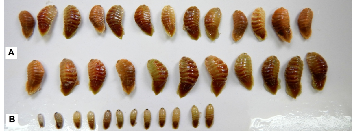
Fig. 1 - Norilecaindicadorsal views: A. Females, B. Males