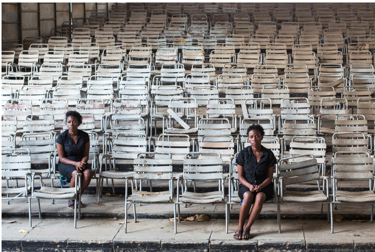
Mónica de Miranda, Twins , 2017. Inkjet print on fine art paper, 63 x 92 cm. From the series Cinema Karl Marx , 2017.