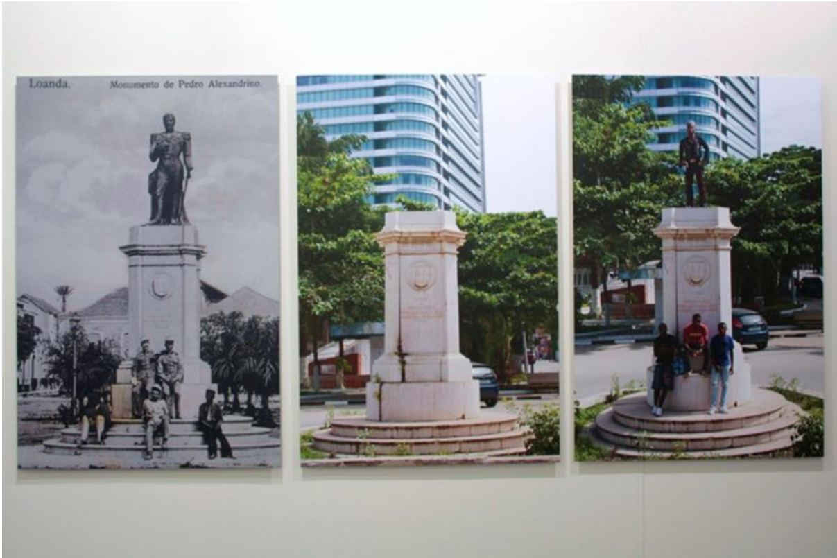
Kiluanji Kia Henda, Redefining The Power III , 2011.

3 photographic prints on aluminium, 80 x 120 cm. From the series Homem Novo , 2009-13.