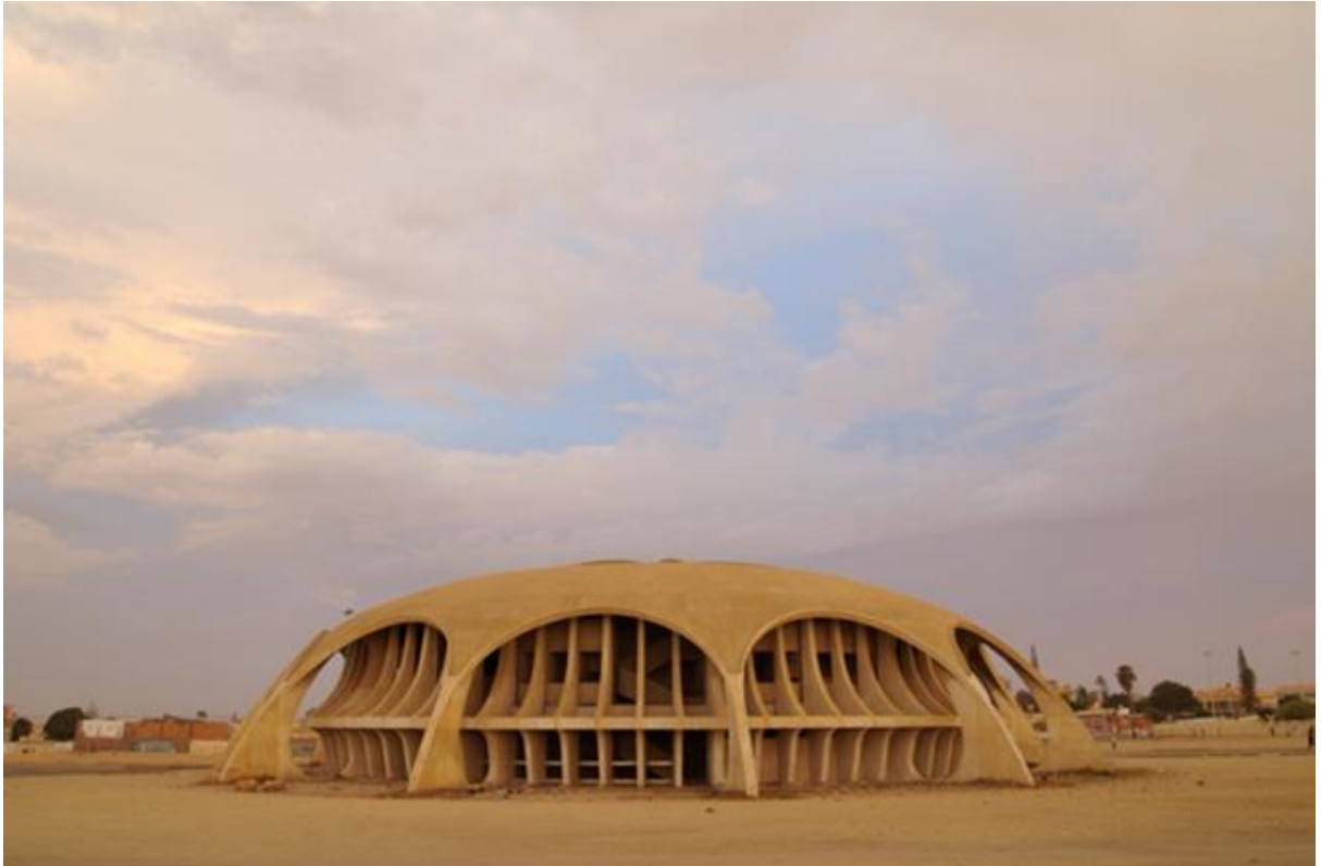
Kiluanji Kia Henda, The Astronomy Observatory, Namib Desert, 2008 . Photograph mounted on acrylic frame, 120 cm x 80 cm. From Icarus 13 , 2008.