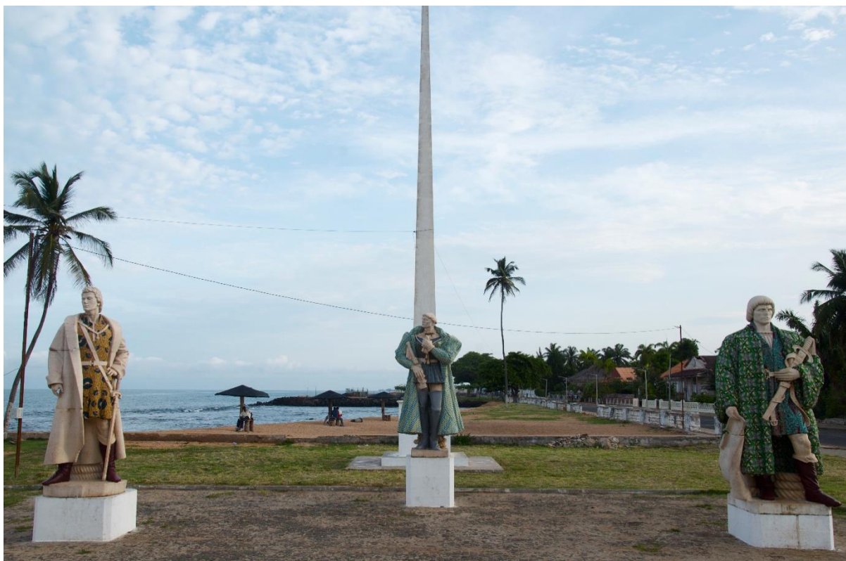
Olavo Amado, (Re)Descobertos , 2013.

Inkjet print on matte paper, 70 cm x 100. From the series (Re)Descobertos , 2013.