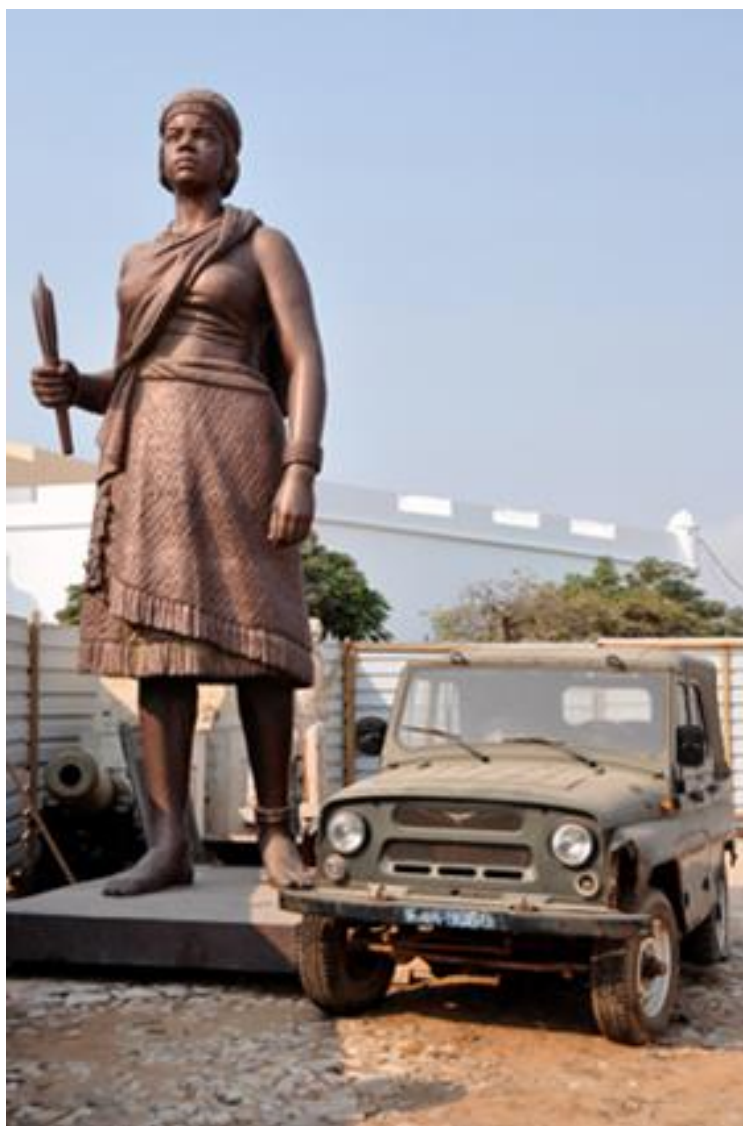
Kiluanji Kia Henda, part of Balumuka (Ambush) , 2010.

12 digital chromogenic prints on matte paper mounted on aluminium, 166 x 110 cm each. From the series Homem Novo , 2009-2013.