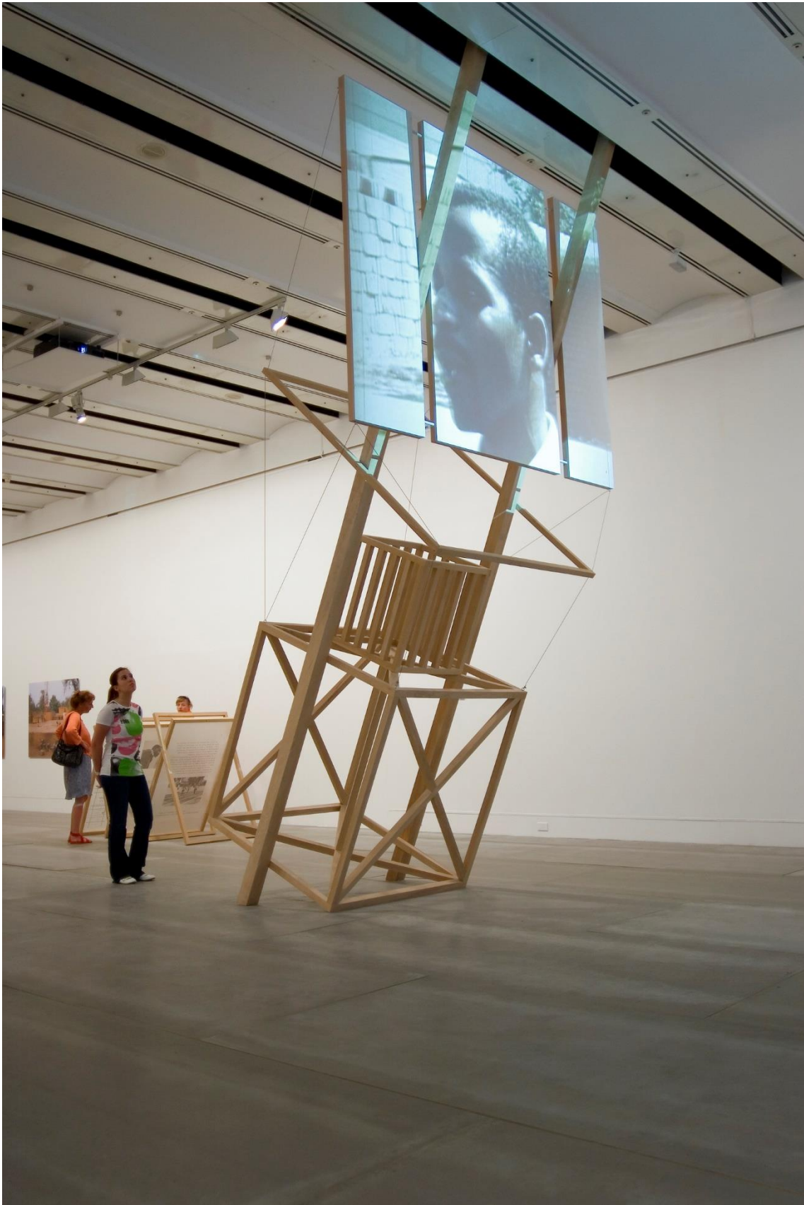
Ângela Ferreira, For Mozambique (Model No. 1 of Screen-Tribune-Kiosk celebrating a post-independence Utopia) , 2008. Installation view, Ângela Ferreira. Hard Rain Show , Museu Coleção Berardo, Lisbon, 2008.