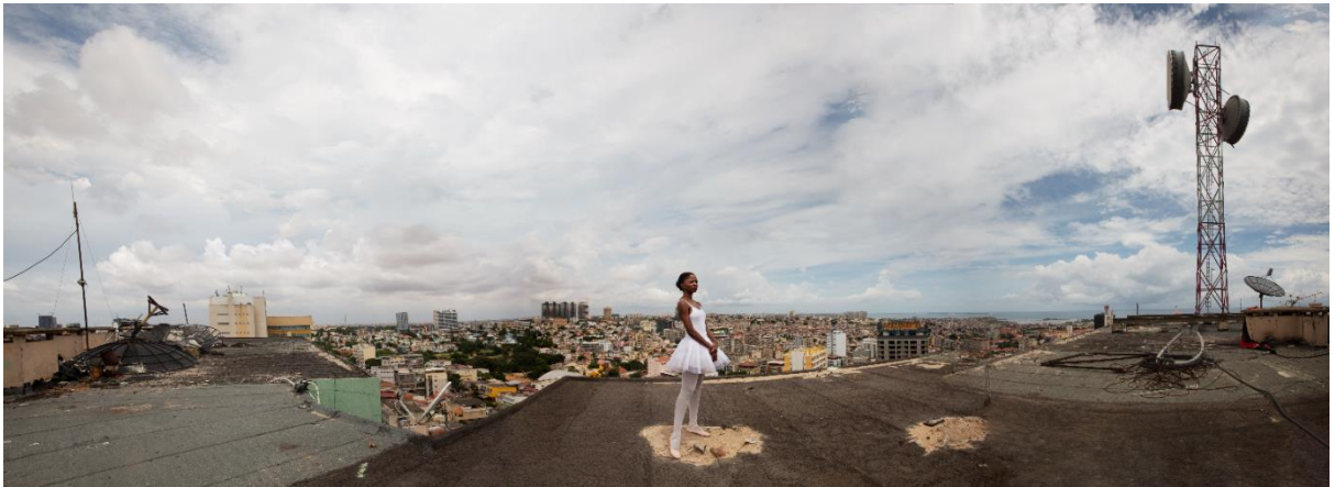
Mónica de Miranda, Elevé , 2018. Inkjet print on cotton paper, 60 x 90 cm. From the series Ballerina , 2018.