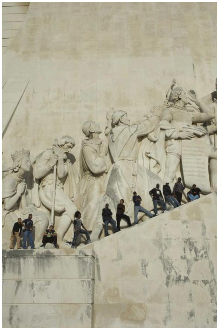
Kiluanji Kia Henda, Padrão dos Descobrimentos , 2006.

Inkjet print on cotton paper, 188 x 120 cm.