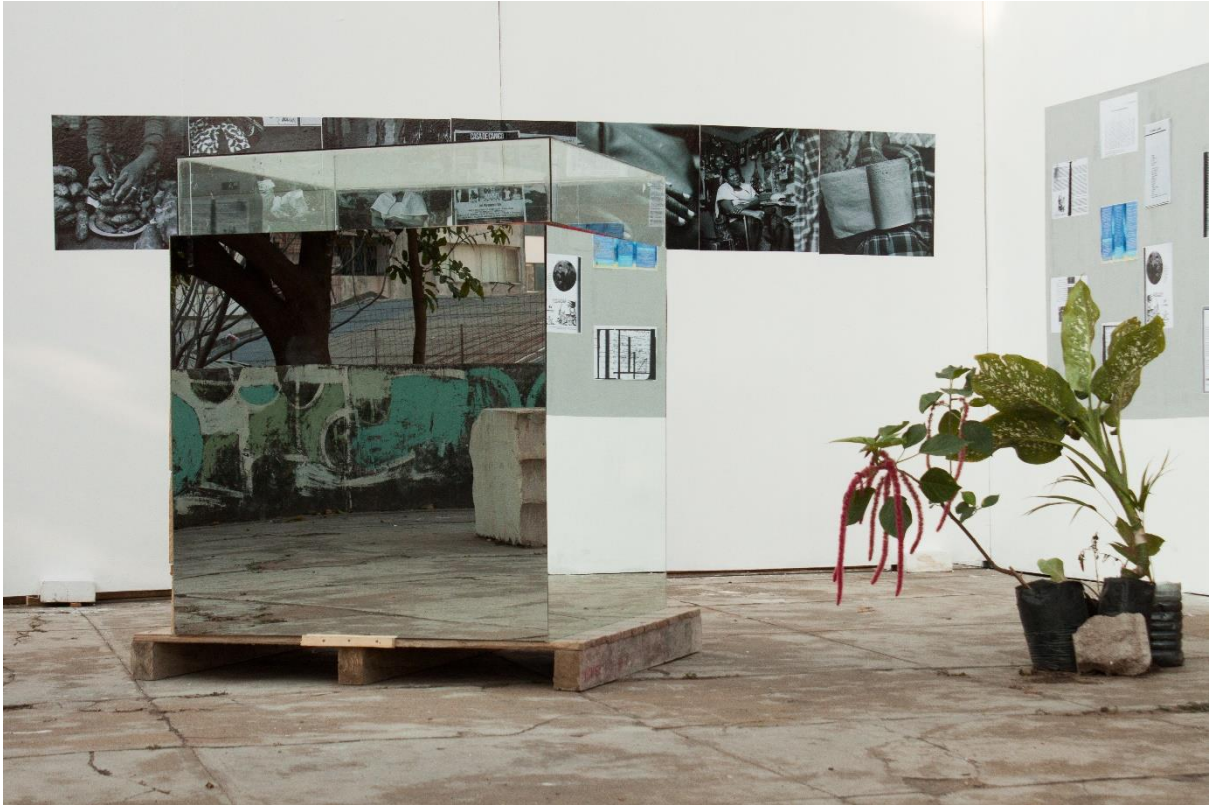
Eurídice Kala aka Zaituna Kala, Will See You in December... Tomorrow (WSYDT) , 2015. Installation view, Will See You in December... Tomorrow (WSYDT) , MUSART – Museu Nacional de Arte, Maputo, 2015.