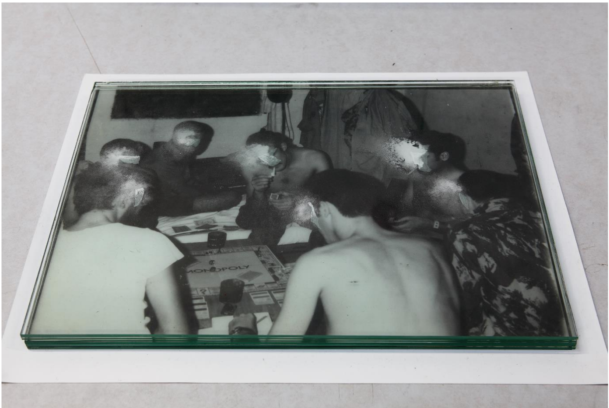
Daniel Barroca, Layered Object #6 , 2011. 9 engraved glass layers and glass powder on inkjet print, 29 x 40 cm. © Daniel Barroca. Courtesy of the artist.