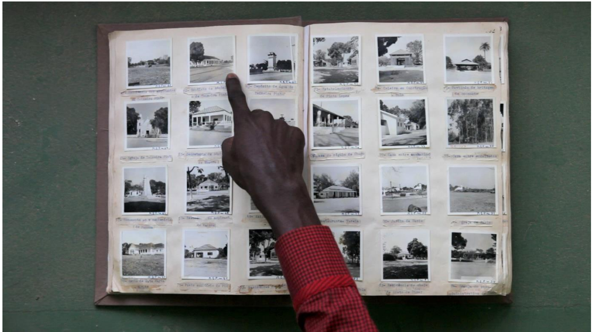
Filipa César, The Embassy , 2011. Video still. © Filipa César. Courtesy of Cristina Guerra Contemporary Art, Lisbon.