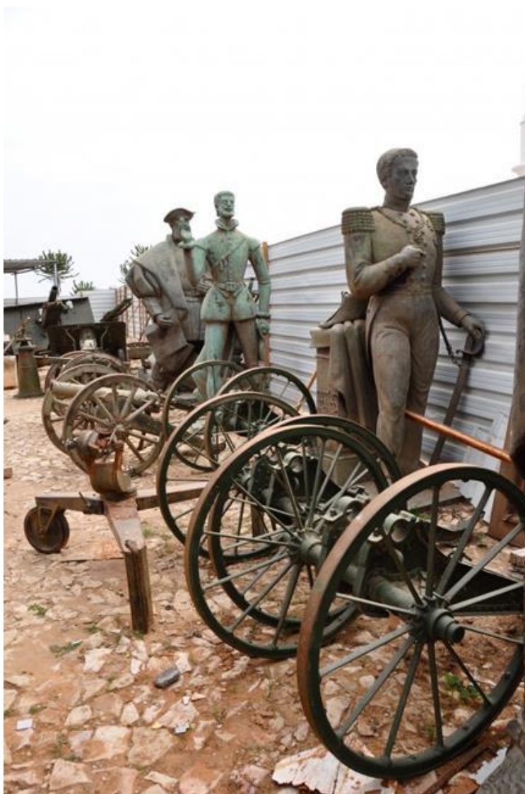
Kiluanji Kia Henda, part of Balumuka (Ambush) , 2010.

12 digital chromogenic prints on matte paper mounted on aluminium, 166 x 110 cm each. From the series Homem Novo , 2009-2013.