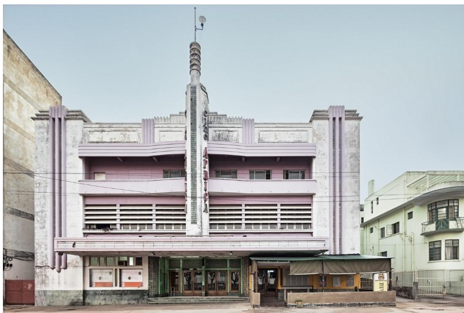
Filipe Branquinho, Cine Theater Africa , 2015.

Inkjet print, variable dimensions. From the series Interior Landscapes , 2011-2015.