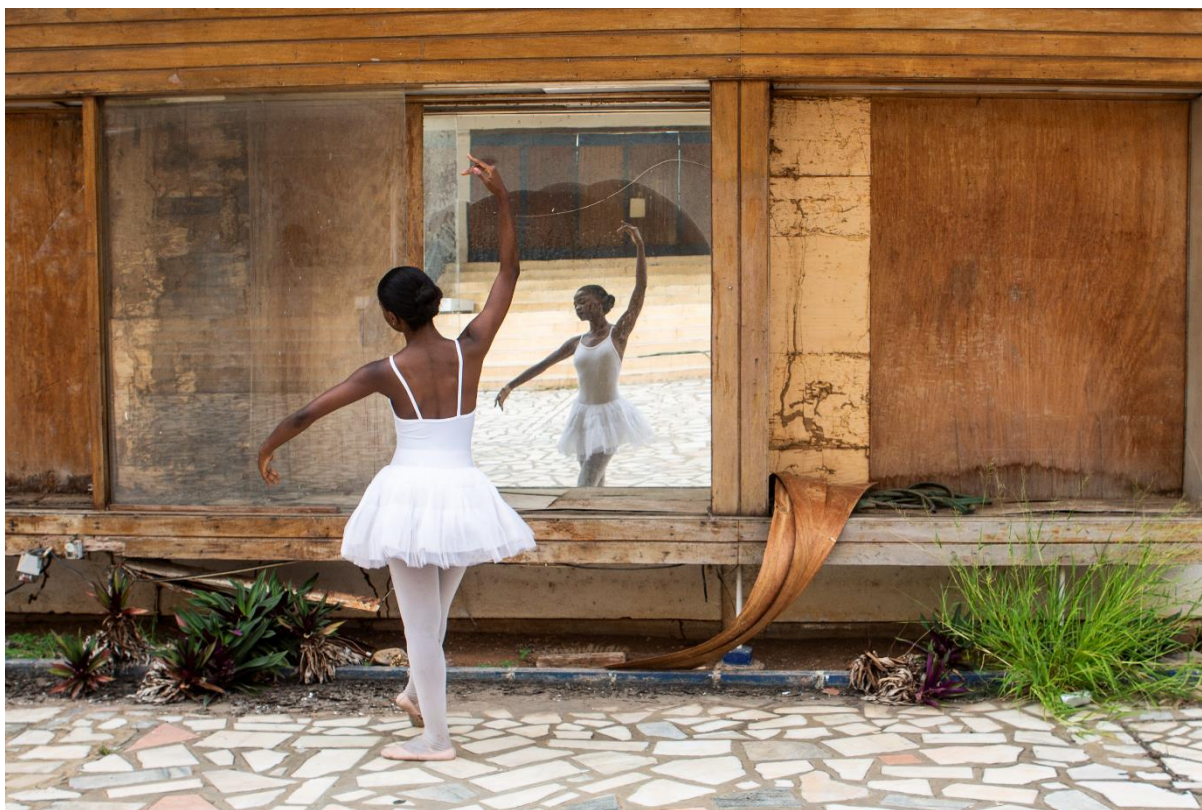
Mónica de Miranda, Assemblé , 2018.

Inkjet print on cotton paper, 60 x 90 cm. From the series Ballerina , 2018.