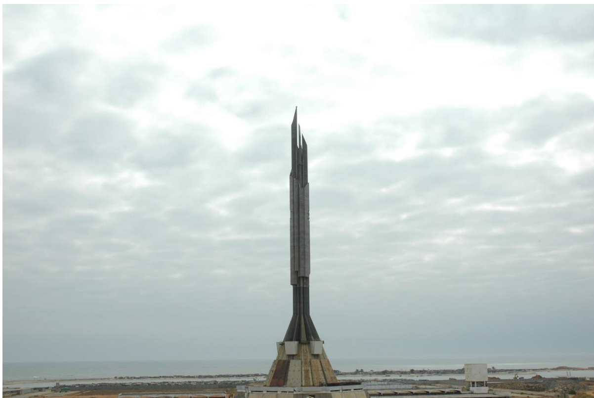
Kiluanji Kia Henda, The Spaceship Icarus 13, Luanda , 2008.

Photograph mounted on acrylic frame, 120 cm x 80 cm. From Icarus 13 , 2008.