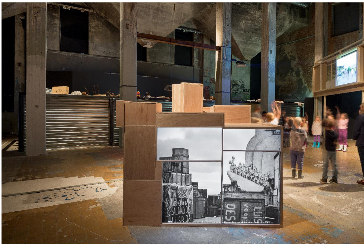
Ângela Ferreira, Messy Colonialism, Wild Decolonization , 2015. Installation view, GIBCA – Gothenburg International Biennial of Contemporary Art, Roda Sten Konsthall, Gothenburg, 2015.