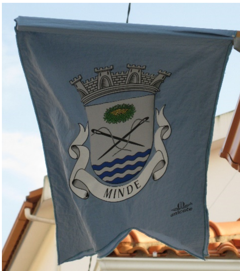
FIGURE 1: Coat of arms of Minde

The coat of arms of Minde (Figure 1) reflects the intrinsic relation between the geological features, the economic activity, and the language – three elements that strongly formed the identity of what can be called the Minderico community. The green nest on the top of the coat of arms metaphorically represents the geological depression in which Minde lies and, simultaneously, the autochthone name of the village - Ninhou (“big nest”), an augmentative derivation of the Portuguese word ninho “nest”. The needles with wool in the middle show the importance of the textile industry and the blue waves at the bottom are again related to the geological specificities of the village, representing the polje .