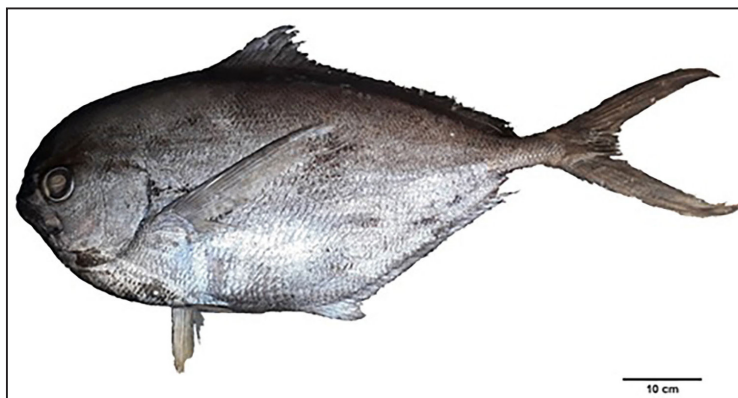
Figure 1. Specimen of Brama brama (672.5 mm SL) collected in Ghazaouet Bay, Algeria.

FAO identification sheets (Gomes, 1990; Haedrich, 2016) was used to identify the specimen as Brama brama (Figure 1), and morphometric characteristics are summarized in Table 1. The species is characterized by having: a moderate body height and somewhat compressed; head very compressed with very convex back profile; very rounded interorbital space; large oblique mouth; wide and scaly maxillary extending at least up to the middle of the eye; lower edge of the mandibles in close contact on the ventral median line behind the symphysis, the isthmus not being visible between