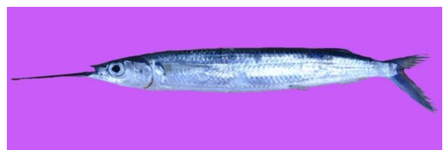
FIGURE 1 Hemiramphus lutkei collected from Odisha coast, India, Bay of Bengal.