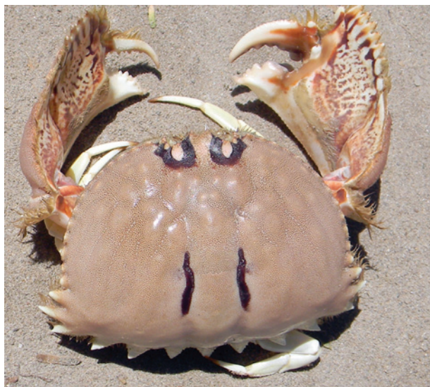
Table 1. Calappa species list