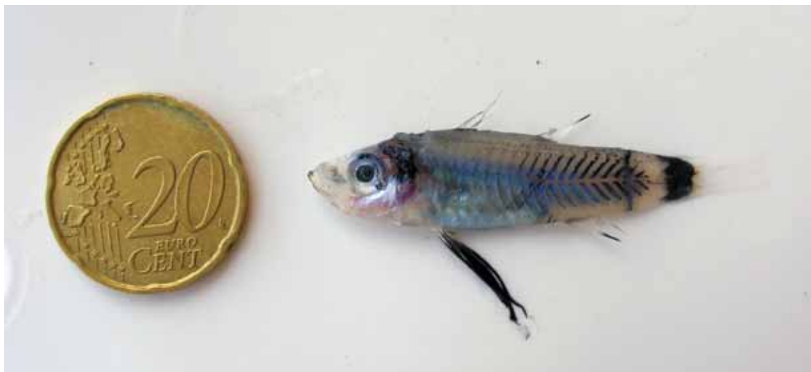
Fig. 1. The specimen of Microichthys sanzoi (TL = 51.1 mm) found stranded on shore of the Strait of Messina on 29 th March 2013

this species and allows to deepen the current knowledge on the morphology of its sagittal otoliths.