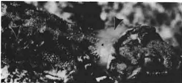
Figure 1 Freshly wounded Pachydactylus namaquensis from the Richtersveld National Park showing the extensive (but not exceptional) integumentary damage (arrows). The exposed areas remain covered by a thin portion of the lower dermis.

Pachydactylus namaquensis and P. bibronii were collected in rocky habitat at Anysberg Nature Reserve, Cape Province, South Africa (33°44'S / 20°27'E) on 19 October 1991. These specimens have been deposited in the collection