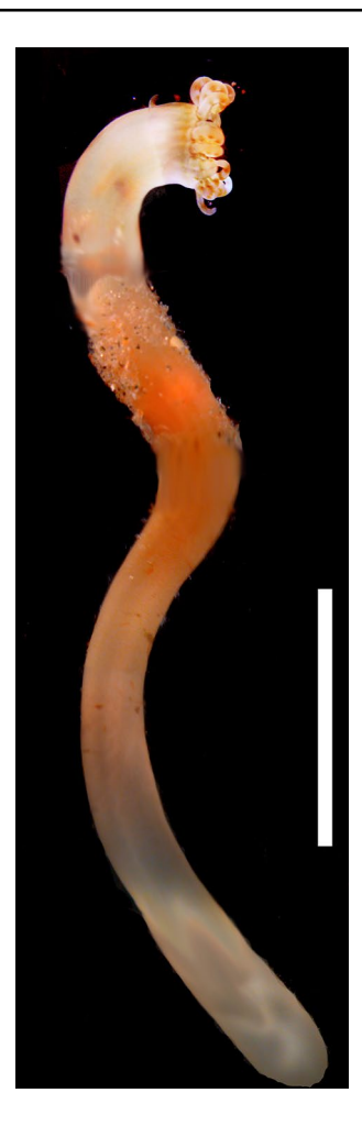
Fig. 2 Adult polyp of Isarachnanthus nocturnus obtained from the developed larva (Larva A). Scale 40 mm

can have serious taxonomic implications, making it difficult to estimate the diversity of the group and requiring great effort to stabilize the nomenclature. Because many