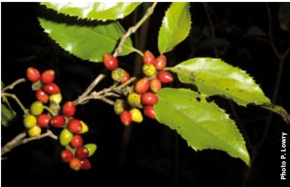
Figure 79: Fruits of Hedycarya dorstenioides , a member of the ancient, primitive family Monimiaceae.