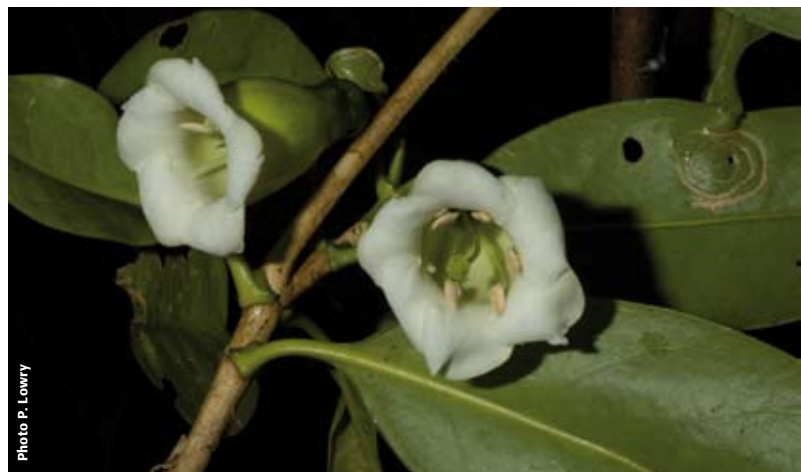
Figure 89: Large, showy flowers of Fagraea ceilanica .