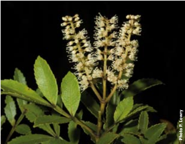
Figure 85: Flowers of Weinmannia denhamii , a typical dominant in montane cloud forest on Santo.

on Santo, Syzygium and Eugenia , whose fruits are fleshy. The flowers of Metrosideros collinum are variable in color, ranging from red or pink to yellow (Fig. 86). In humid summit areas, the trees are smaller and covered with epiphytes, mostly filmy ferns and liverworts, but also epiphytic shrubs such as Vaccinium (Ericaceae) (Fig. 87), which is easily recognized by its small, pink, urn-shaped flowers.