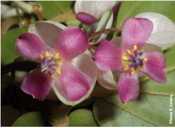
Figure 77: Flowers of the epiphyte Medinilla heteromorphophylla , which grows on trunks of large trees.