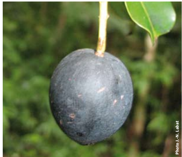
Figure 72: A ripe fruit of Calophyllum neoëbudicum , common tree in mid-elevation forest.