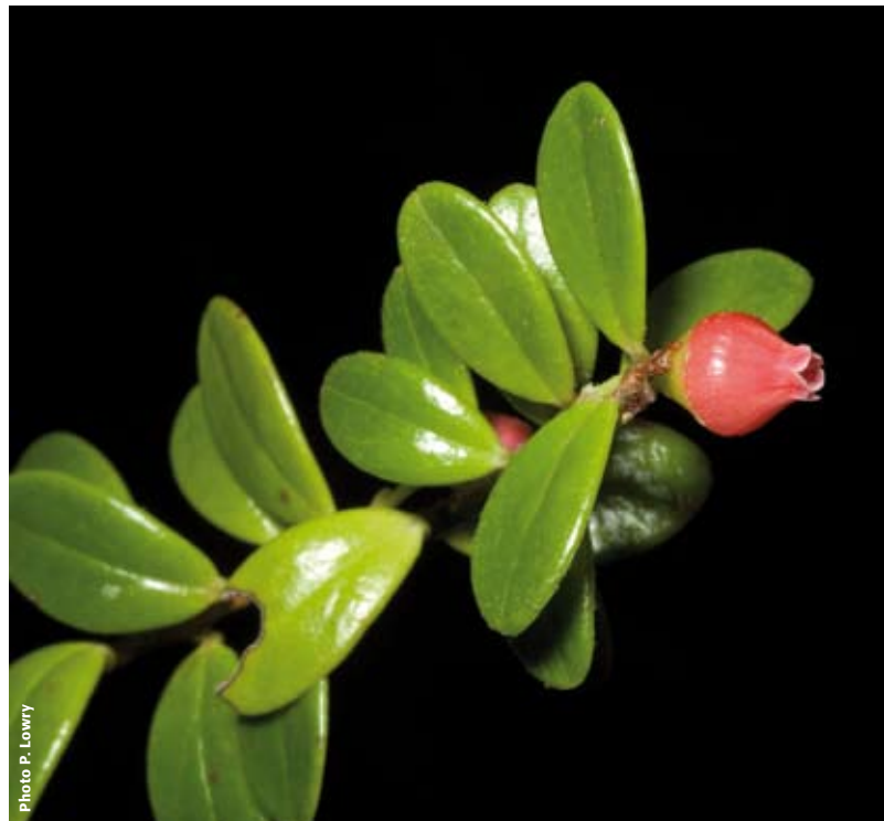
Figure 87: A flower of the epiphytic shrub Vaccinium whiteanum , which grows high in the trunks of the largest trees.

In some places the montane cloud forest can take a distinctive appearance when tree ferns and/or palms are present. In the Penaoru Valley, at about 1200 m elevation, we visited an area of forest in which a single regionally endemic palm was frequently seen, Cyphosperma voutmelense (Fig. 88). The species name refers to the place where it was first collected, Voutmélé Peak. This palm alone represented fully 14% of the trees with a DBH (diameter at breast height) of 5 cm or more, but the presence of several tree ferns, belonging to three different genera, Cyathea , Dicksonia and Leptopteris , was even more striking as they accounted for 20% of the individuals with a DBH \geq 5 cm. The showy white flowers of Fagraea ceilanica (Gentianaceae) were also very distinctive (Fig. 89), although only a few individuals were observed.