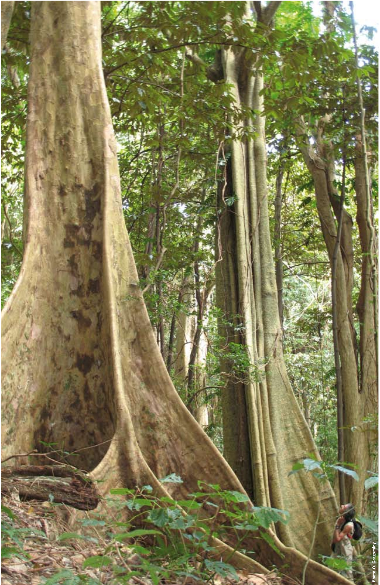
Figure 65: Jean-Noël Labat examining the canopy in medium-stature forest.