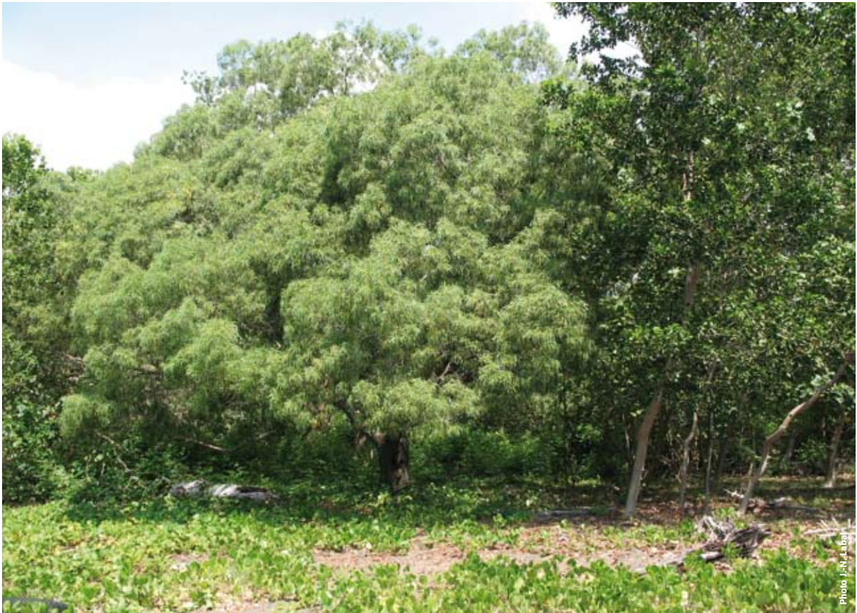
Figure 90: Gaiac ( Acacia spirorbis ) is characteristic of a "gaiac forest".

The seasonal forest, scrub and grassland can also be divided into three variants (Table 5), one of which, Acacia spirorbis (Fabaceae) forest (Figs 90 & 91), is locally referred to as "gaiac forest". Another characteristic species of this vegetation type is Kleinhovia hospita (Sterculiaceae) (Fig. 92), locally known as Matalo and recognizable by its pink flowers and light, ribbed fruits. This formation can contain sandalwood, and in drier locations it may be dominated by introduced shrubs such as Leucaena leucocephala and Acacia