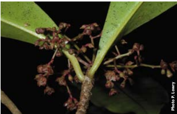
Figure 81: Flowers of Tapeinosperma netor , a member of a complex genus.

and whose flowers have separate carpels each of which develops into a bright red drupe (Fig. 79).