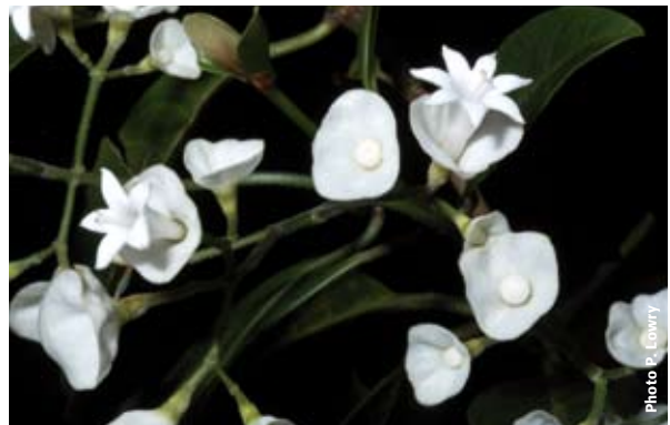
Figure 82: Psychotria milnei , a member of the coffee family, is easy to recognize by its showy white calyx that persists long after the petals fall off.