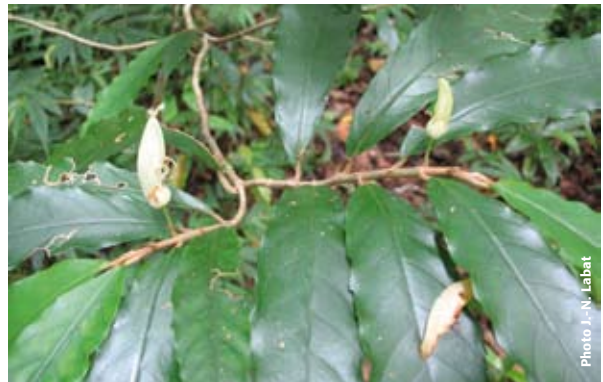
Figure 80: Young flowers of Cyrtandra efatensis in humid forest.