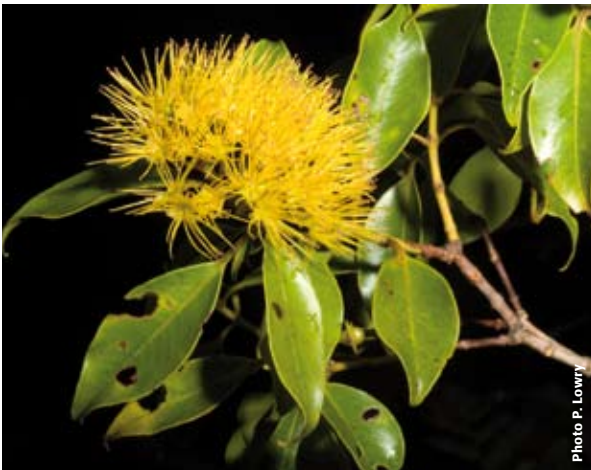
Figure 86: Metrosideros collinum in its yellow flowered form.