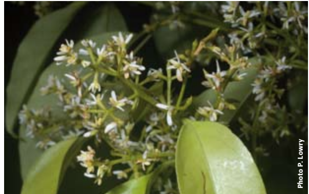
Figure 78: Ligustrum neoebudicum , a member of the olive family whose distinctive flowers have four white petals (which are quickly shed), four persistent sepals, and only two yellow stamens.

Some species are very abundant in the shrubby component of this type of forest, such as Cyrtandra efatensis , a member of the African violet family (Gesneriaceae) (Fig. 80) and several species of Tapeinosperma (Myrsinaceae) (Fig. 81) that are particularly difficult to distinguish from one another. Members of the coffee family (Rubiaceae) were also frequently encountered, notably in the genus Psychotria , including the spectacular species P. milnei , which has an enlarged, showy calyx (Fig. 82). We also encountered herbaceous plants, as for example Begonia vitiensis , with distinctive white flowers in the understory (Fig. 83).