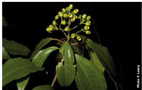
Figure 73: Astronidium novaeëbudaense , bearing young green fruits and showing the characteristic venation of the family Melastomataceae.

They can almost always be recognized by the very distinctive venation in their leaves, in which the tertiary veins are parallel to one another and oriente at right angles to the secondary veins, giving them an appearance that resembles a ladder, as clearly observed on Astronidium novaeëbudaense (Fig. 73). Some members of the family are also epiphytes, such as Medinilla cauliflora and M. heteromorphophylla (Fig. 77). Two tree species in the olive family (Oleaceae) should also be noted,