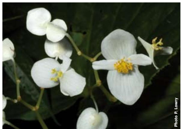
Figure 83: Begonia vitiensis , a native relative of the commonly cultivated begonias grown throughout the world.