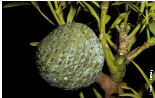
Figure 71: Cone of a giant Kauri ( Agathis macrophylla ), a dominant tree in forest above 600 m elevation.

Another species deserves to be mentioned as well, Astronidium novaeëbudaense (Fig. 73), a shrub or small tree belonging to the family Melastomataceae, which was the most frequently encountered of all in our studies. We recorded individuals from between 600 m and 1200 m altitude, indicating that this plant is capable of growing in a fairly wide range of forest types, from Lowland rain forest to Montane forest. The Melastomataceae are a large family occurring throughout the tropics.