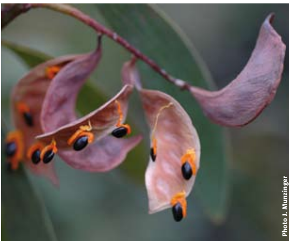
Figure 91: Acacia spirorbis . Its fruits open to reveal black seeds and their brightly colored arils that attract dispersers, primarily birds.

farnesiana (both Fabaceae) and Psidium guajava (Myrtaceae). Sandalwood ( Santalum austrocaledonicum ; Santalaceae) is an important element of the flora from a historical point of view, as this shrub or small tree was exploited for centuries for its prized, long-lasting essential oils that are used for perfumes, incense and in aromatherapy. Sandalwood trees can be distinguished by their opposite leaves that are slightly bluish below, their cream-colored flowers with four petals, and their angular fruit.