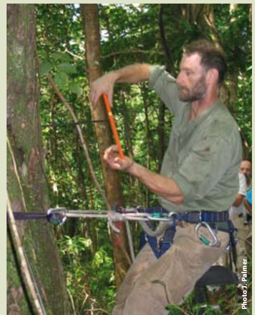
Figure 75: The extraction of small samples of wood being taken from a kauri tree using an increment corer. The samples are used to try to count the number of rings formed so that the age of the tree might be estimated.

The Santo kauri cores were found to have ring boundaries that varied greatly from distinct to diffuse and impossible to determine. In some situations there were no "visible" rings over many centimetres of growth. Although the visible rings were counted, we knew the age estimate would not be accurate. Even so, we then checked if there was a general systematic relationship between the number of visible rings and the diameter of the trees (Fig. 76). There is no relationship. Many other studies have shown the same result: tree size \neq age. This means for a tree found of a certain size, there is a large range of possible ages or visible rings. To check this we submitted two samples for radiocarbon dating. They were taken from inner-most ends of cores, the part closest to the centre (i.e. oldest) portion of two different trees. The results (Table 6) showed us two things. Firstly, that both samples were too young for accurate radiocarbon dating. The second thing was that although the tree Santo-15 was twice the diameter of Santo-14 (208 cm vs 102 cm respectively) there was not the same magnitude of difference in their calibrated radiocarbon ages; the trees were in fact fairly similar in probable age (note: the dates in Table 6 show the reverse trend if anything). Again, this supports the earlier result of tree size not being directly correlated to age.