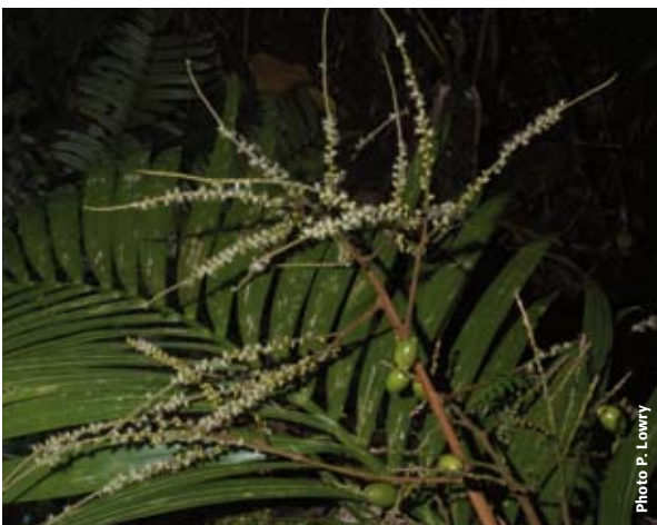
Figure 88: Flowers and fruits of the rare endemic palm Cyphosperma voutmelense .

In some places the montane cloud forest can take a distinctive appearance when tree ferns and/or palms are present. In the Penaoru Valley, at about 1200 m elevation, we visited an area of forest in which a single regionally endemic palm was frequently seen, Cyphosperma voutmelense (Fig. 88). The species name refers to the place where it was first collected, Voutmélé Peak. This palm alone represented fully 14% of the trees with a DBH (diameter at breast height) of 5 cm or more, but the presence of several tree ferns, belonging to three different genera, Cyathea , Dicksonia and Leptopteris , was even more striking as they accounted for 20% of the individuals with a DBH \geq 5 cm. The showy white flowers of Fagraea ceilanica (Gentianaceae) were also very distinctive (Fig. 89), although only a few individuals were observed.