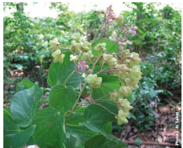
Figure 92: Kleinhovia hospita is another characteristic species in low elevation gaiac forest.