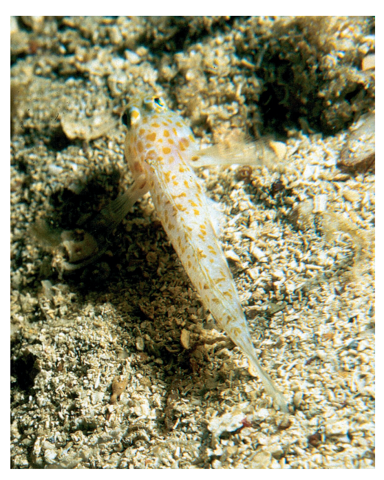
Fig. 1 - Specimen of Thorogobius macrolepis photogaphed in situ.

Thorogobius macrolepis (Fig. 1) was observed during visual census surveys carried out in several locations in the central and southern Adriatic, and Ionian Seas. Density was estimated by using visual census performed along 25 x 5 m transects and expressed as no. of individuals 100 m<sup>-2</sup> (see HARMELIN-VIVIEN et al., 1985). As we did not collect any specimen, identification was done in situ and from pictures, and was based on comparison of species with similar coloration (AHNELT and KOVAČIČ, 1997; ALBERTO et al., 1999: KOVAČIČ and MILLER. 2000). The coloration patterns of T. macrolepis and Gobius kolombatovici were thus checked on specimens in the collection of Natural