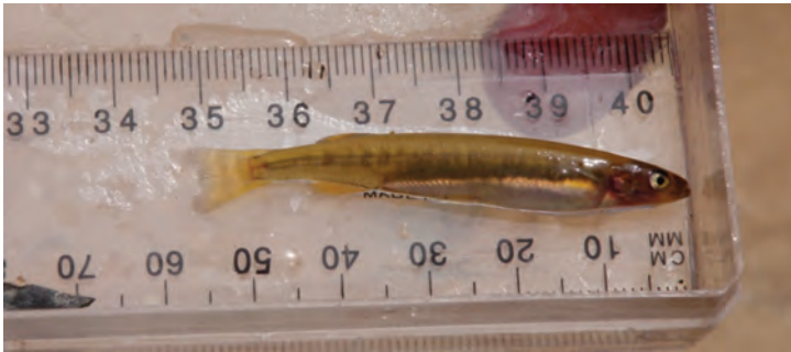
Figure 2 Healthy adult Western minnow ( Galaxiidae : Galaxias occidentalis ) caught in Lake Centaur, November 2009.