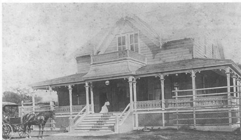
FIG. 4. The Cummins home on Alexander Street at Pawa'a, O'ahu.