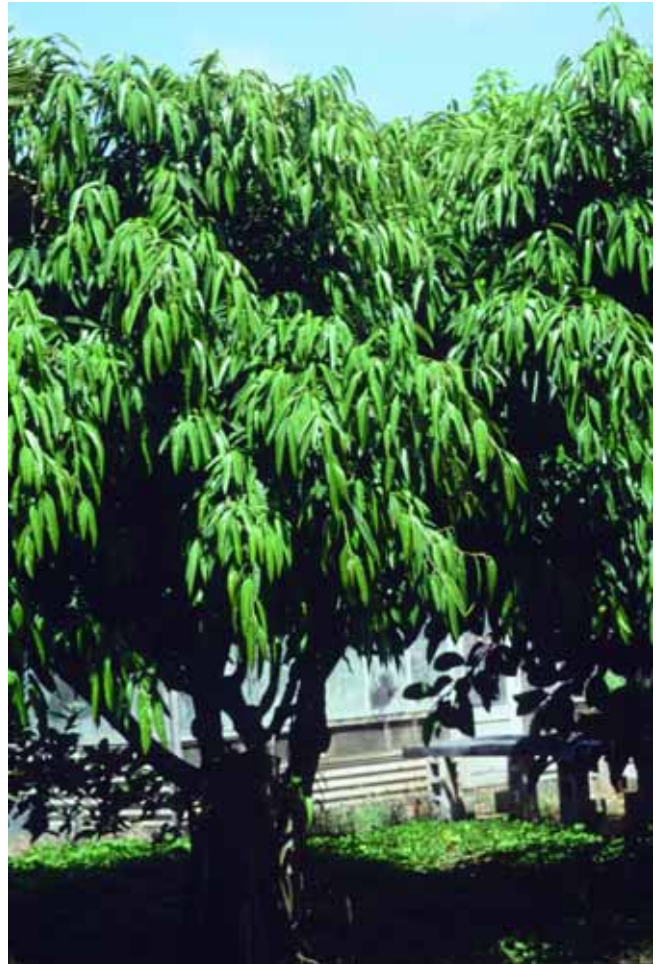
19. Ficus binnendykii 'Alii' (narrowleaf fig)