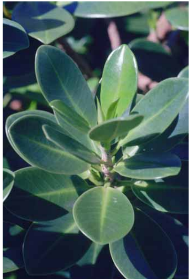
25. Ficus microcarpa var. crassifolia (wax ficus)