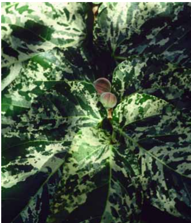
18. Ficus aspera (clown fig)