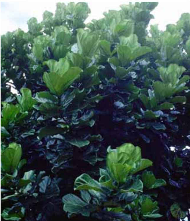
21. Ficus lyrata (fiddle-leaf fig)