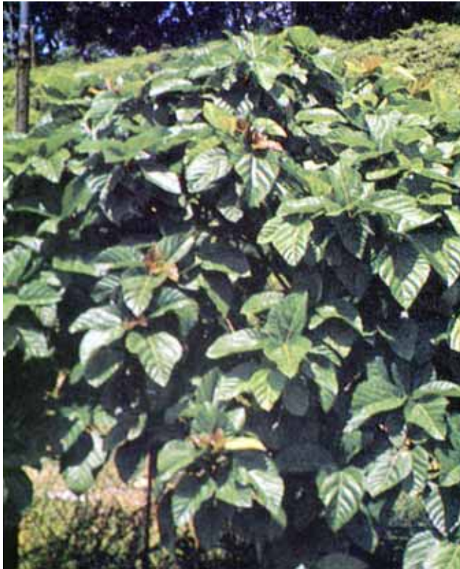
17. Ficus auriculata