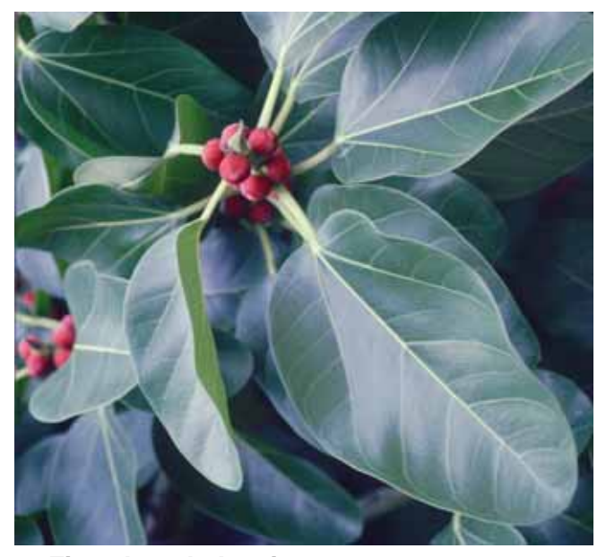
1. Ficus benghalensis