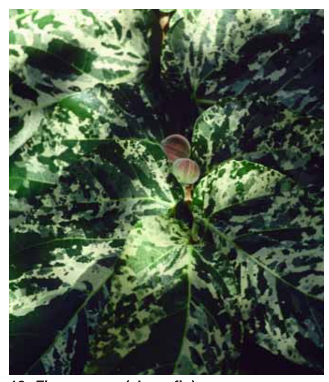
18. Ficus aspera (clown fig)