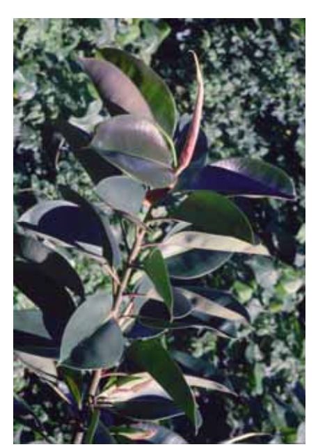
10. Ficus elastica 'Decora'