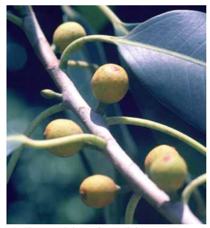
15. Ficus rubiginosa (rusty fig)