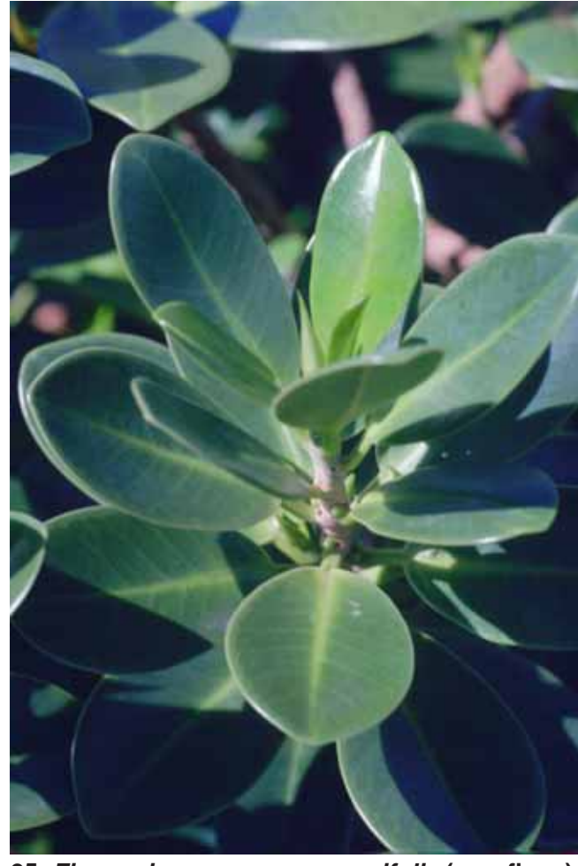
25. Ficus microcarpa var. crassifolia (wax ficus)