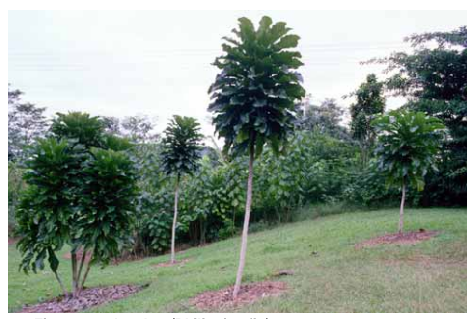
23. Ficus pseudopalma (Philippine fig)