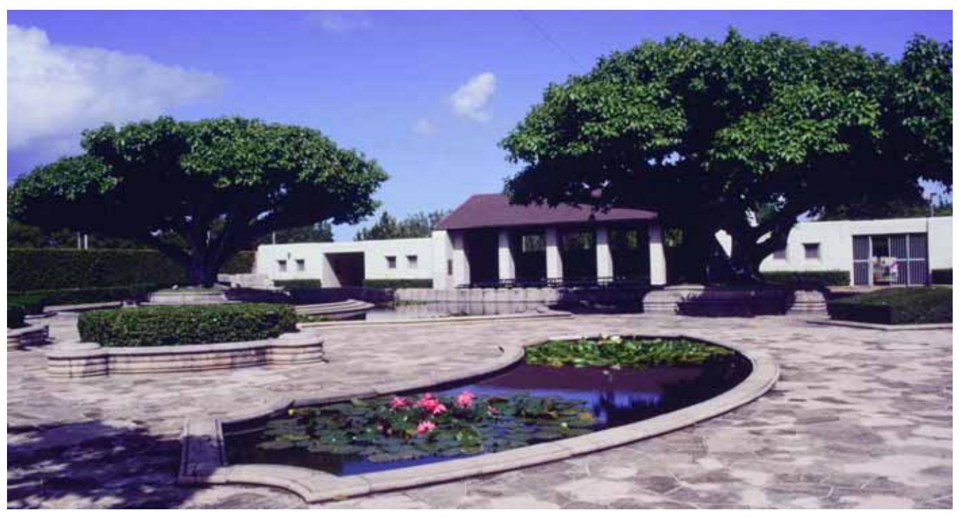
5. Ficus altissima (council tree)