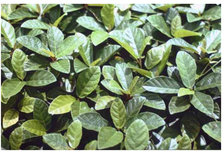
30. Ficus tikoua (Waipahu fig)