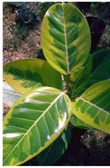
12. Ficus elastica 'Gold'