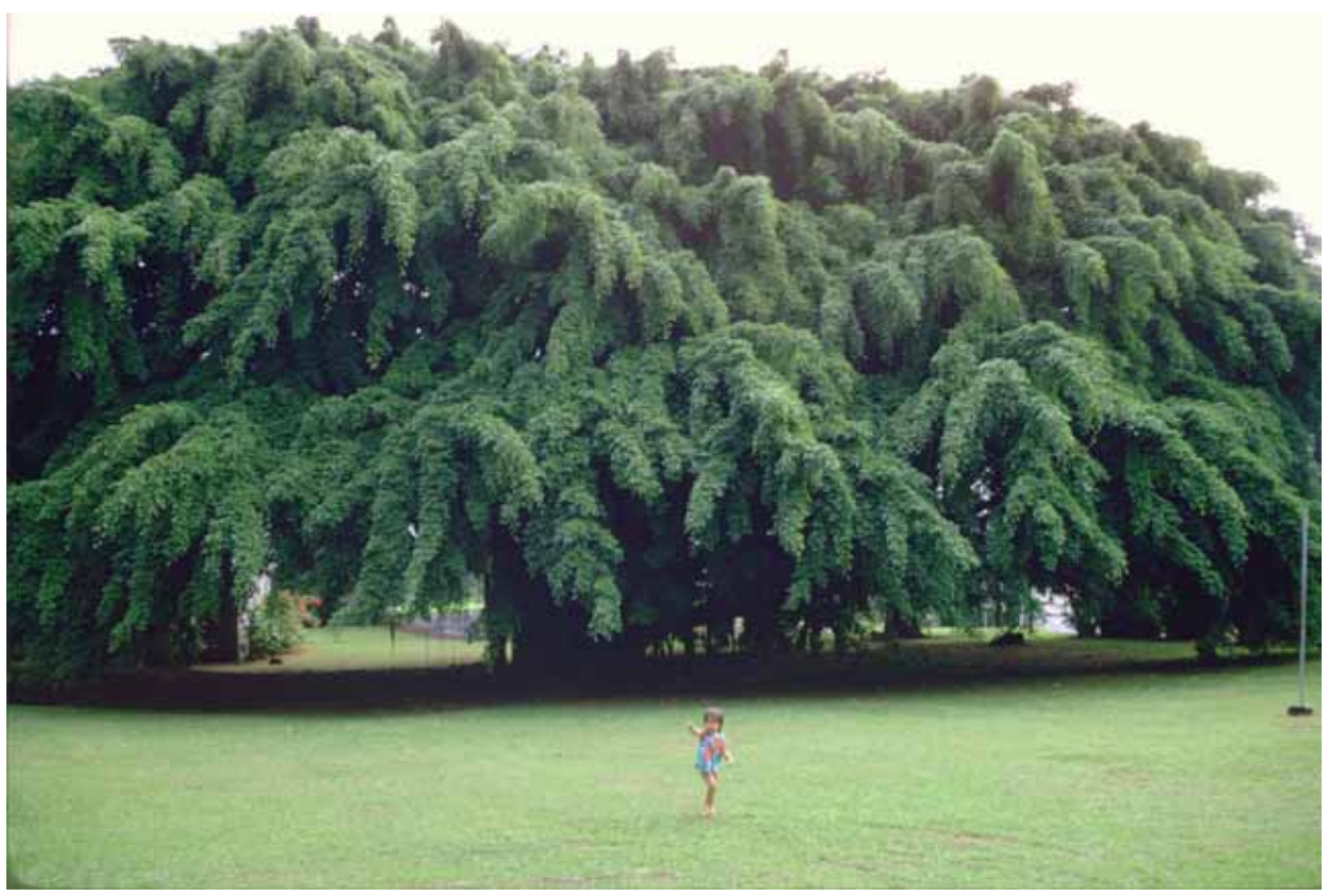
4. Ficus benjamina (weeping fig)