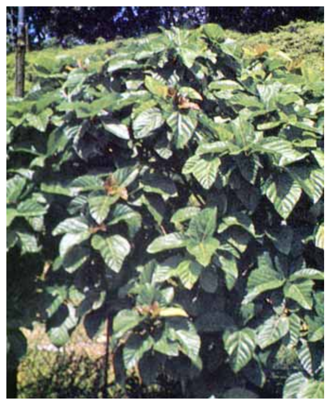
17. Ficus auriculata