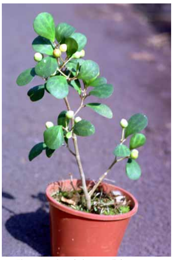
28. Ficus deltoidea (mistletoe fig)