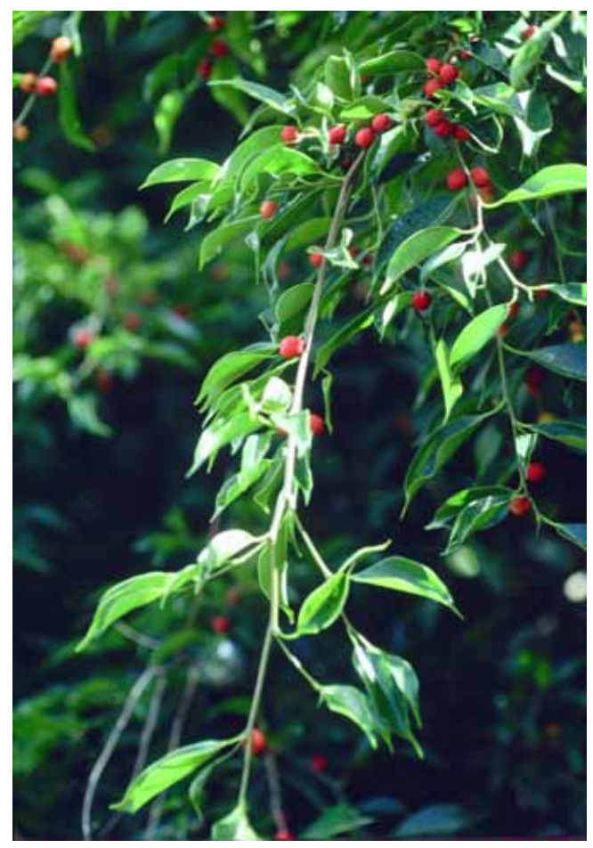
31. Ficus benjamina 'Exotica'