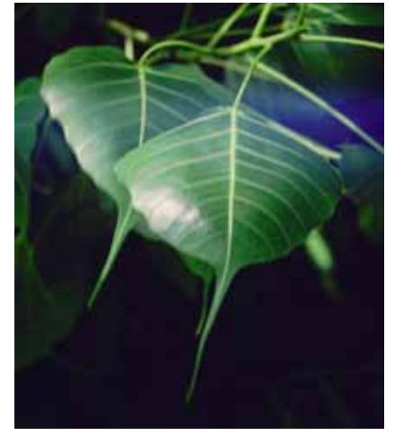
7. Ficus religiosa (bo tree)