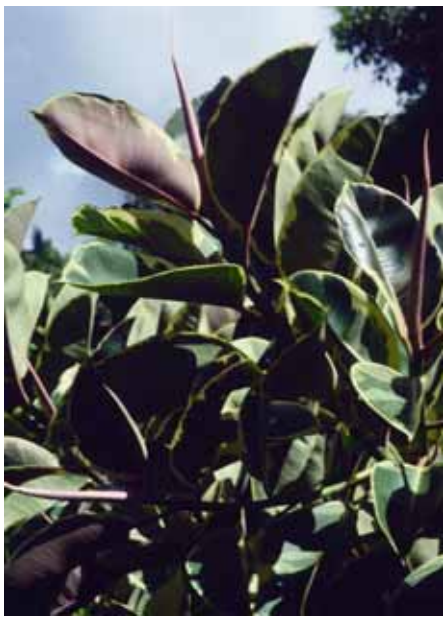
11. Ficus elastica 'Asahi'