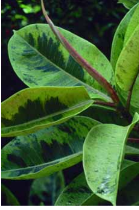
8. Ficus elastica 'Schrijveriana' 9. Ficus elastica 'Abidjan'