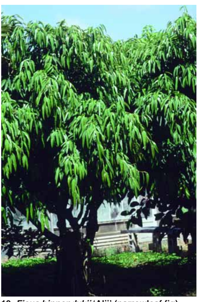
19. Ficus binnendykii 'Alii' (narrowleaf fig)