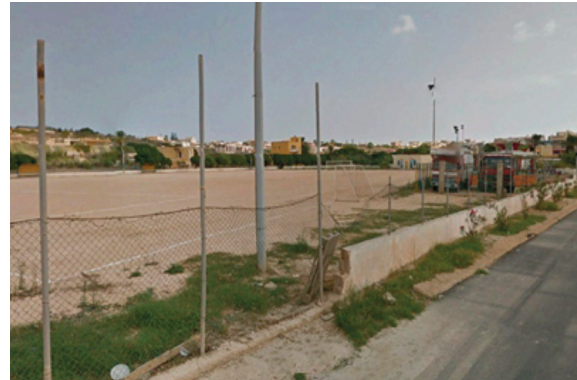
Fig. 3. The soccer field in Lampedusa on the place of the salt marsh near the harbour locus classicus et unicus of Limonium intermedium .

There are several cases of old, unconfirmed records, due perhaps to misidentification, and of taxa of uncertain taxonomic position, that must be taken into account in management and conservation plans for endangered species. Orobanche aegyptiaca Pers. (Orobanchaceae) was reported in error from Italy (Monte Gallo and Lampedusa). It was recorded in Scoppola & Spampinato (2005) as being