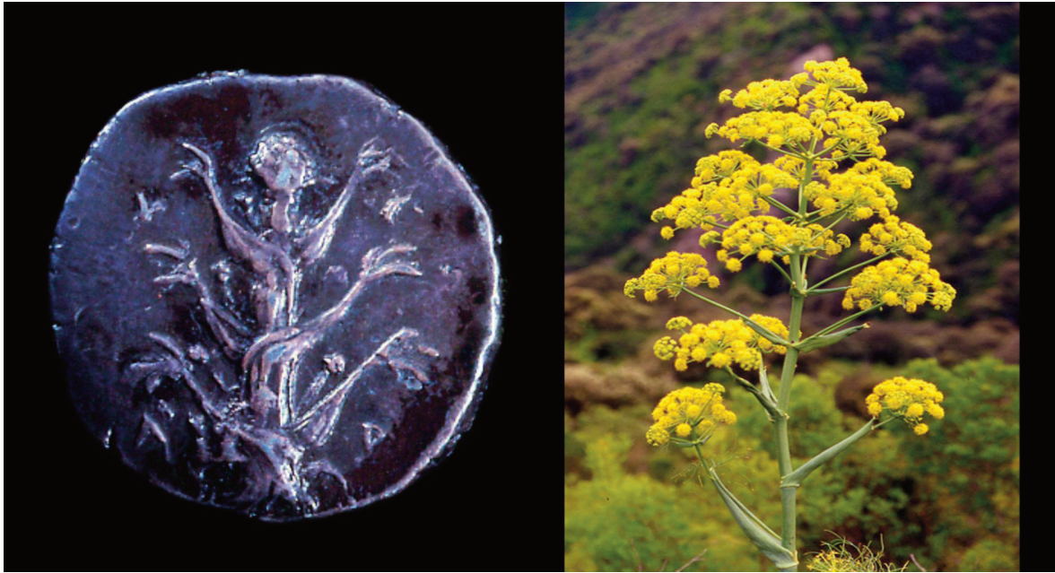
Fig. 1. Silver Coin of Cyrene dating back late 6th-early 5th centuries BC. depicting the silphium on the left and Ferula communis on the right.

reclamation of its native wetland areas. At present, 6 small populations are known to have survived (Laguna et al., 1994). 7) Salvia peyronii Post (Lamiaceae), discovered in 1883 on cliffs near Feitroun (Lebanon) and never seen until recently, although it is showy and had been looked for repeatedly, was found again in the same area (Jabal Moussa) in 2011 (Tohmé & Tohmé, 2011). 8) Silene rothmaleri Pinto da Silva (Caryophyllaceae), described in 1945 from Cabo S. Vicente (Algarve, Portugal) and not seen since in spite of a thorough search by Jeanmonod (Greuter & Raus, 1984), was rediscovered in 2000 (Dinter & Greuter, 2004). 9) Of Silene tomentosa Otth (Caryophyllaceae) a few 19th-Century specimens were known, all from the E side of the Gibraltar rock (Spain), but until 1984 none had been collected in the 20th Century (Jeanmonod, 1984). In 1994 the species was rediscovered growing in the wild and is since cultivated in the Alameda Botanical Gardens (Linares, 1998).