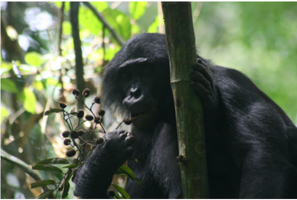
PLATE 1 Bonobo Pan paniscus eating velvet tamarind fruits ( Dialium sp.) and swallowing seeds at LuiKotale, Democratic Republic of Congo.