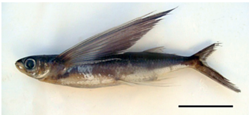
Fig. 2. Cheilopogon heterurus caught off Ras Jebel (Ref. FSB-Che-het-01), scale bar = 90mm.