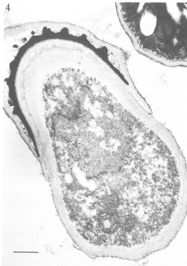
Figures 3 & 4 Arxiozyma telluris . TEM micrographs of sections through germinating ascospores. The bar represents 0,5 \mu\text{m} . (Material fixed in glutaraldehyde and osmium tetroxide; stained with uranyl acetate and basic lead citrate.)

Although the type strain of A. telluris was recovered from a sample of South African soil, most subsequently recorded isolates come from warm-blooded sources. It may be speculated that this association with warm-blooded sources might be indicative of the rather recent evolution of the genus.