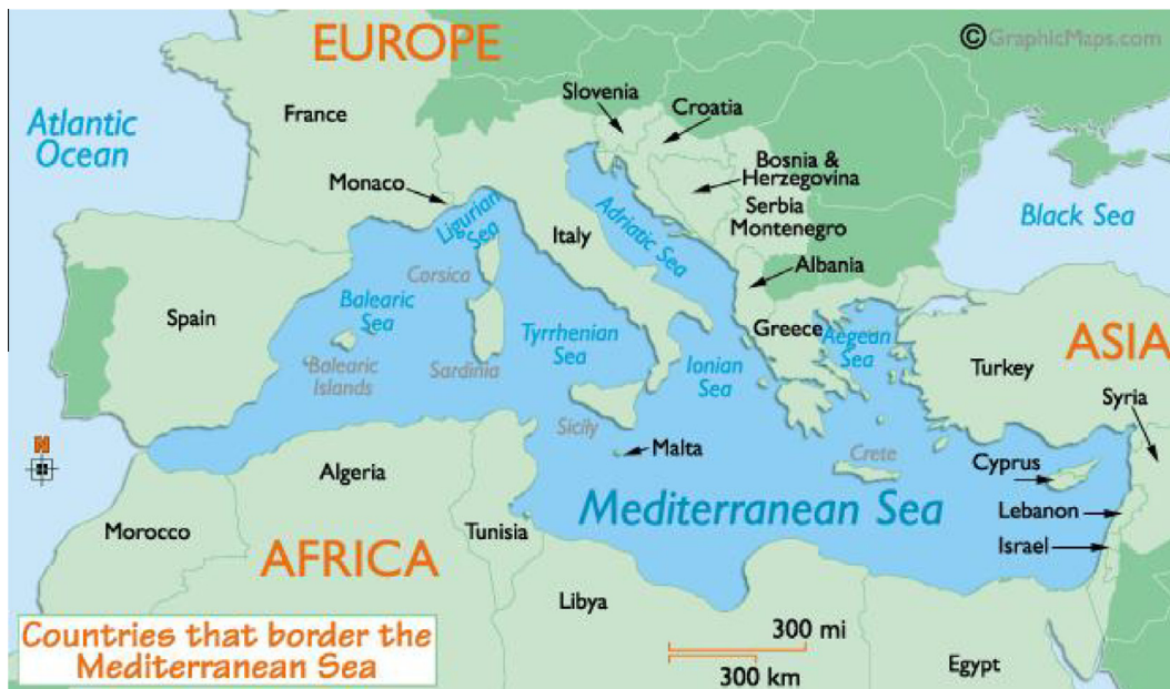
Figure 1 The Mediterranean Sea.

Strait of Sicily), reaching Gibraltar where it forms the Mediterranean outflow into the Atlantic Ocean.