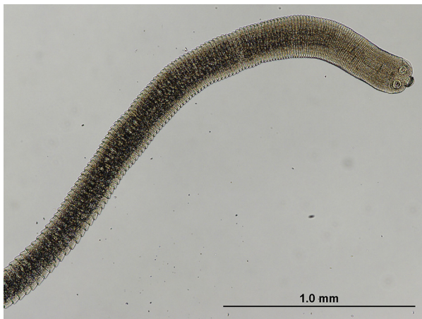
FIG. 1. Adult tapeworm of Hymenolepis nana .

transmission may be greater in poor, high-density urban environments and four recent reports found mice and rats in urban environments of Rio de Janeiro, Brazil, Uttarakhand in India, northern England and Kuala Lumpur, Malaysia, to be commonly infected with H. nana [10–13]. Molecular evidence is equivocal, suggesting that there may be two strains of H. nana that are maintained in zoonotic and non-zoonotic cycles but this remains to be determined. Macnish et al. [5] suggested that isolates of H. nana in Australia actually exist as two cryptic or sibling (morphologically identical, but genetically different) species, based on a sequence divergence of 5% in the