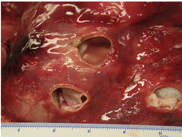
FIG. 4. Hydatid cysts of Echinococcus canadensis in the lungs of a moose. Some cysts have been cut open to reveal cystic layers on the inside that produce multiple scoleces by asexual budding, which develop into adult tapeworms following ingestion by the definitive host.

It has always been known that domestic or free-roaming dogs are important 'bridging hosts' between the sylvatic cycle of