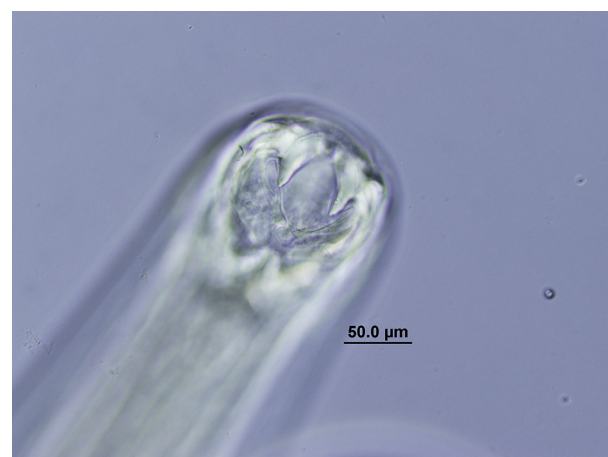
FIG. 5. Anterior of an adult Ancylostoma ceylanicum showing teeth used to lance capillaries in mucosa of small intestine in order to suck blood.

Hookworm along with Trichuris , Ascaris and Strongyloides , collectively comprise the soil-transmitted helminths, and