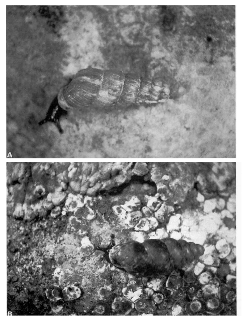
FIG. 1. Adult snails. A, Balea perversa (shell height 9.8 mm); B, Chondrina clienta (shell height 6.1 mm).

lichen samples were placed in transparent plastic containers lined with paper towelling. Two to 50 adult snails were put on the pieces of limestone (Table 1).