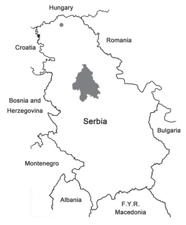
Fig. 1. Map of Serbia with marked regions where L. orientalis was detected.

Slovakia (Starý & Lukáš, 2009). In spite of a high number of samples and reared individuals, no L. orientalis have been found in these areas.