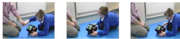
Fig. 4. Example of Experimental Investigation scenario of a turn-taking game with a sensory reward (Legorobot).

The game is played using the stationary inanimate robot (Legorobot), and consists in a turn-taking game with a sensory reward. The robot is placed on the floor and the participants are sitting around it (see fig. 4). The objective of the game is to engage the child in a collaborative turn-taking game with another person, whilst having enjoyment and sensory rewards (lights) as a result.