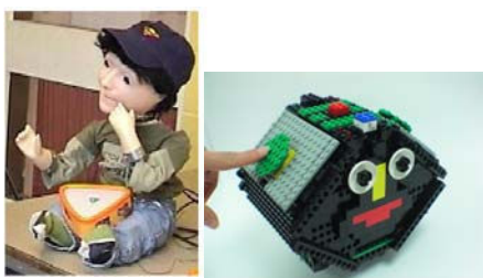
Fig. 2. The two robots that were used in the trials: Kaspar (left) and Legorobot (right).

b) LEGOROBOT - a small mobile robot that was developed specifically for a simple turn-taking and sensory game for children with autism (see figure 2 right).