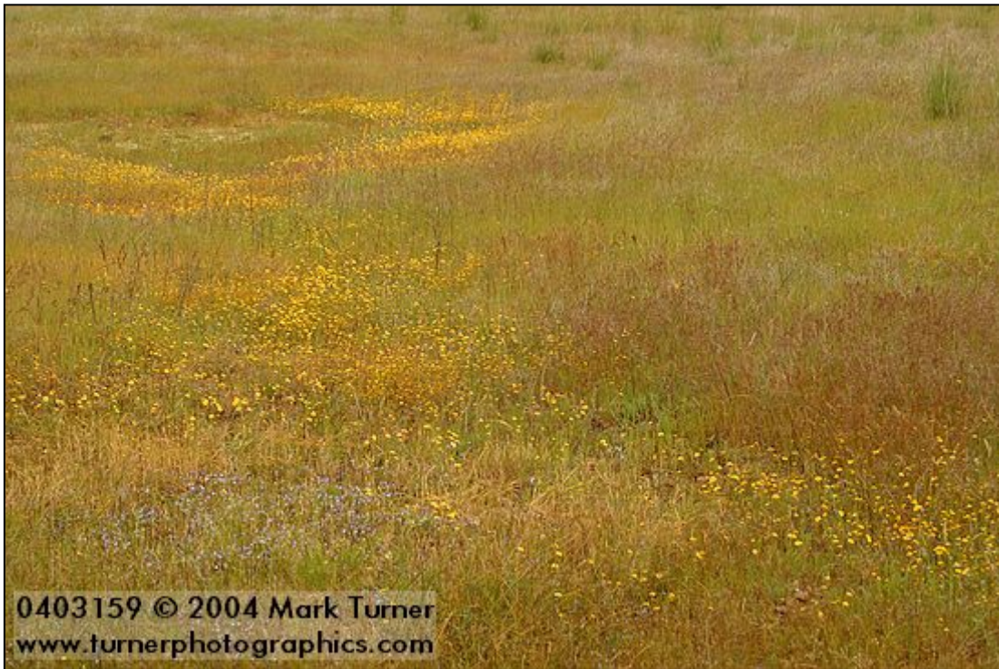
Figure 8. Agate Desert vernal pool habitat.

Limnanthes floccosa ssp. grandiflora : Limnanthes floccosa ssp. grandiflora occurs at the edge of vernal pools at elevations of about 375-400 m, primarily in the Agate Desert region north of Medford Oregon in Jackson County (Figure 8). Although the historic range of this plant may have encompassed over 130 km 2 , the current range is much