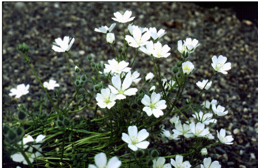
Figure 7. Limnanthes floccosa ssp. alba , commercially grown for its seed oil.