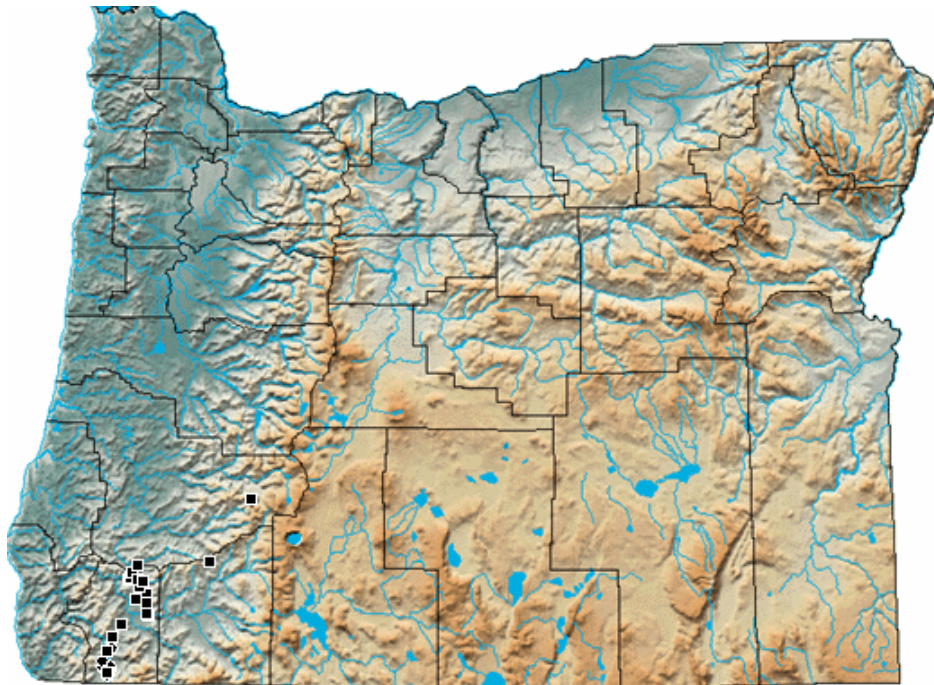
Figure 13. Distribution of Limnanthes gracilis var. gracilis . Map courtesy of the Oregon Flora Project.