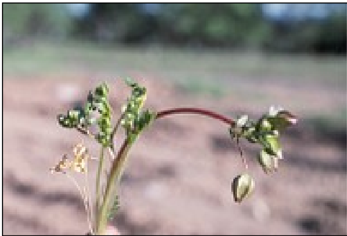
Figure 5. Limnanthes floccosa ssp. bellingermana .

Limnanthes floccosa Howell ssp. bellingermana (Peck) Arroyo (Figure 5) is found in