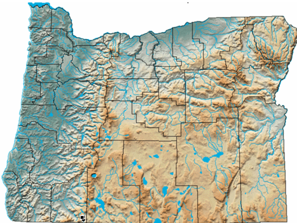
Figure 10. Distribution of L. floccosa ssp. bellingeriana .