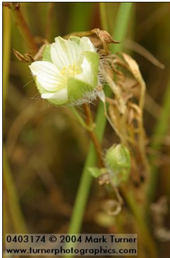
Figure 6. Limnanthes floccosa ssp. grandiflora .