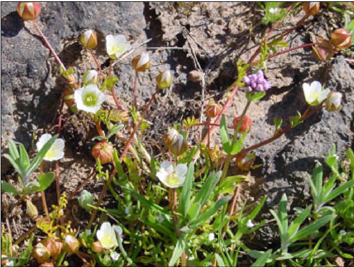
Limnanthes floccosa ssp. pumila . Photo by D. Detling – used with permission.