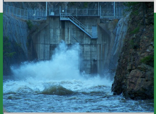
Projects such as Degray Lake, pictured above, note the potential for the occurrence of the Arkansas fatmucket.

Pink Mucket (pearlymussel) = $1,609,000 (since 2006)