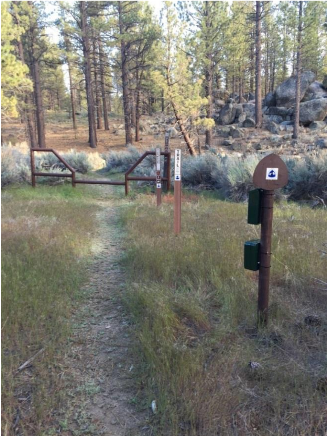
Survey Box Location