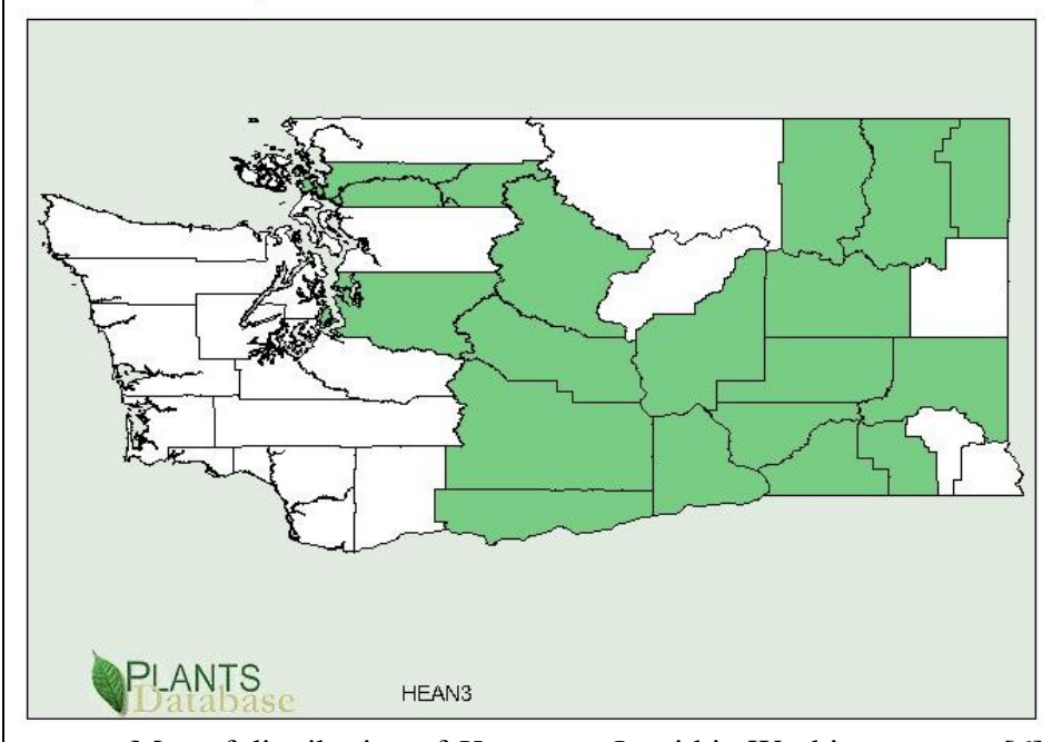
Map of distribution of H. annuus L. within Washington state [6]