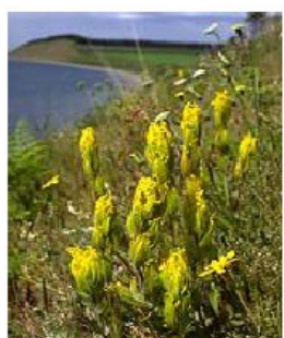
P. Dunwiddie/ TNC

Store at a low-temperature (5° C) in a dry, dark place.