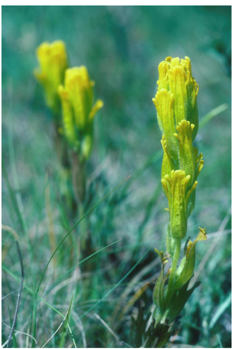
Flowering Stalk: Tom Kaye, CPC<sup>6</sup>