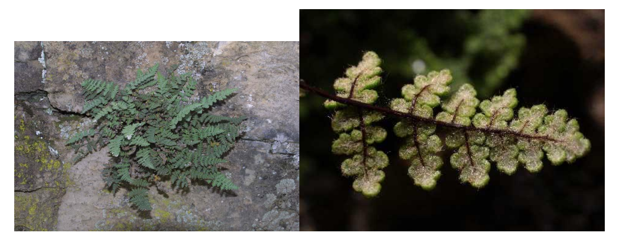
Image 3 (left): C. feei Image 4: C. feei underside