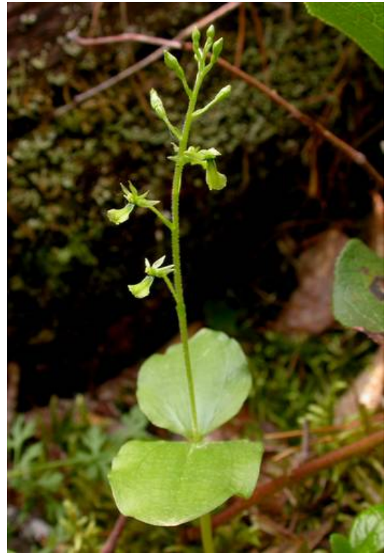
Figure 2 – Listera caurina .