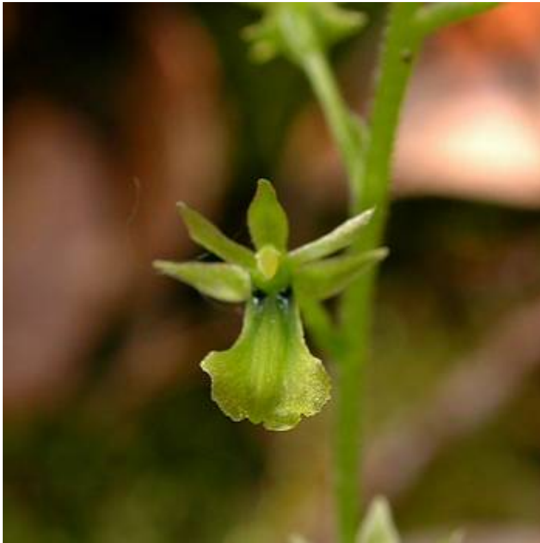
Figure 1- Listera caurina flower.

Protocol URL: https://courses.washington.edu/esrm412/protocols/LICA10.pdf