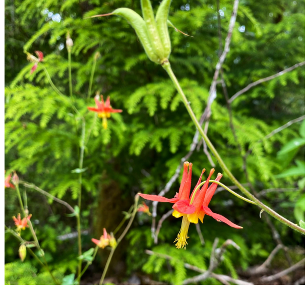
Aquilegia formosa Location: Baker Lake, WA Date: June 23, 2020